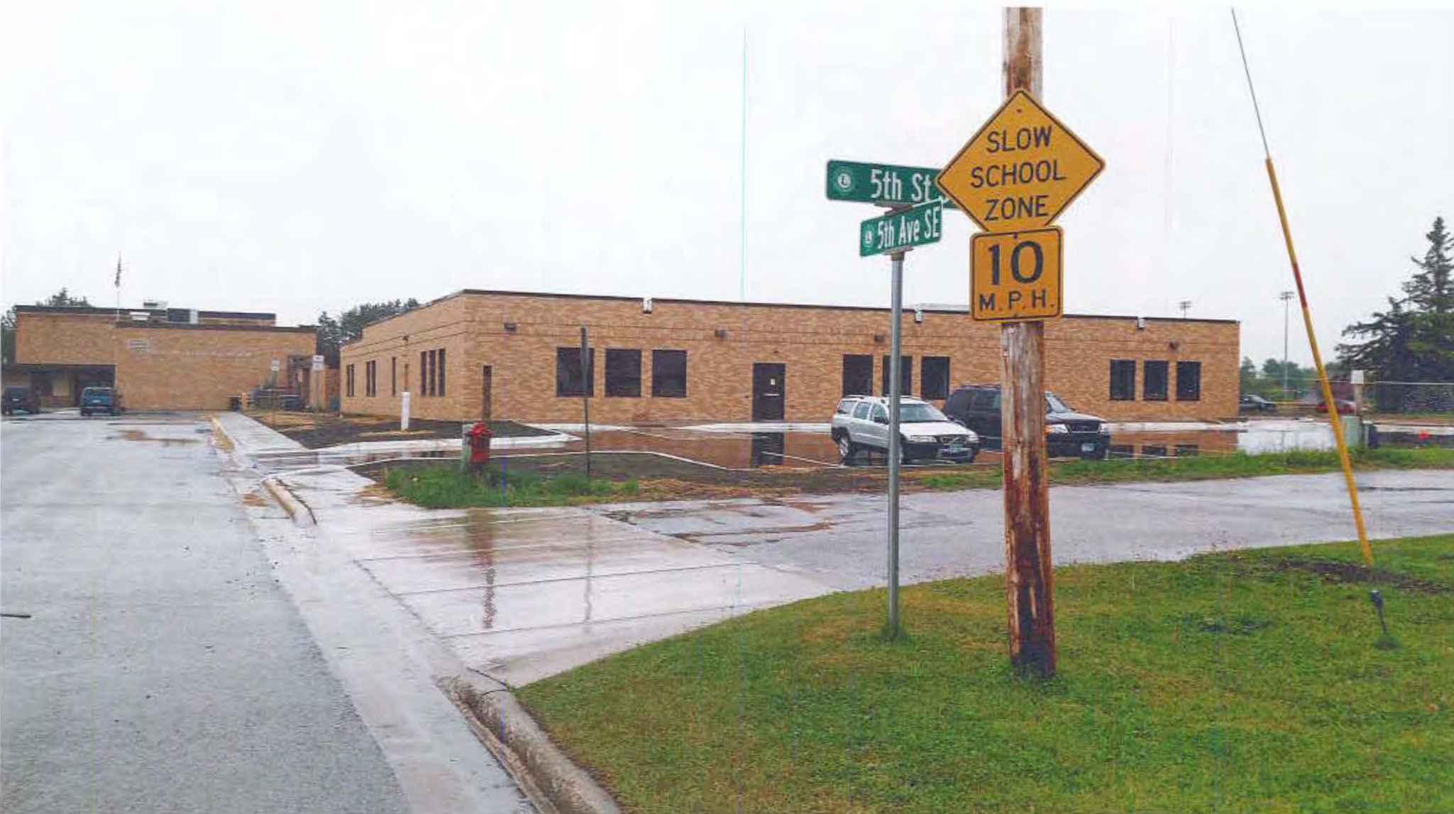
ITASCA LUMBER COMPANY SUPERINTENDENT'S RESIDENCE ITASCA COUNTY MN 27 MAY 2016 CAMERA FACING SE