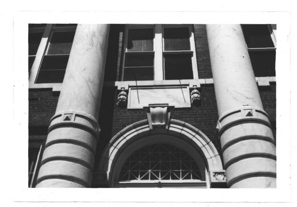
DETAIL - BANDED COLUMNS