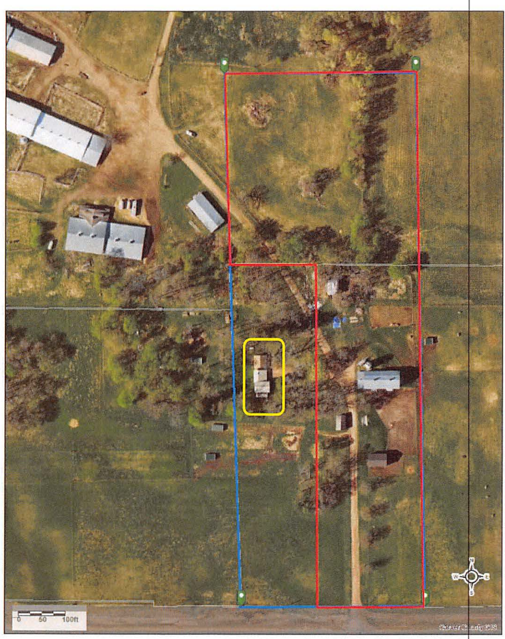
This map was created using Carver County's Geographic Information Systems (GIS), it is a compilation of information and data from various City, County, State, and Federal offices. This map is not a surveyed or legally recorded map and is intended to be used as a reference. Carver County is not responsible for any inaccuracies contained herein. Map Date: 11/5/2018

Overlay of corrected boundary (blue) and current boundary (red). The historic farmhouse is outlined in yellow.