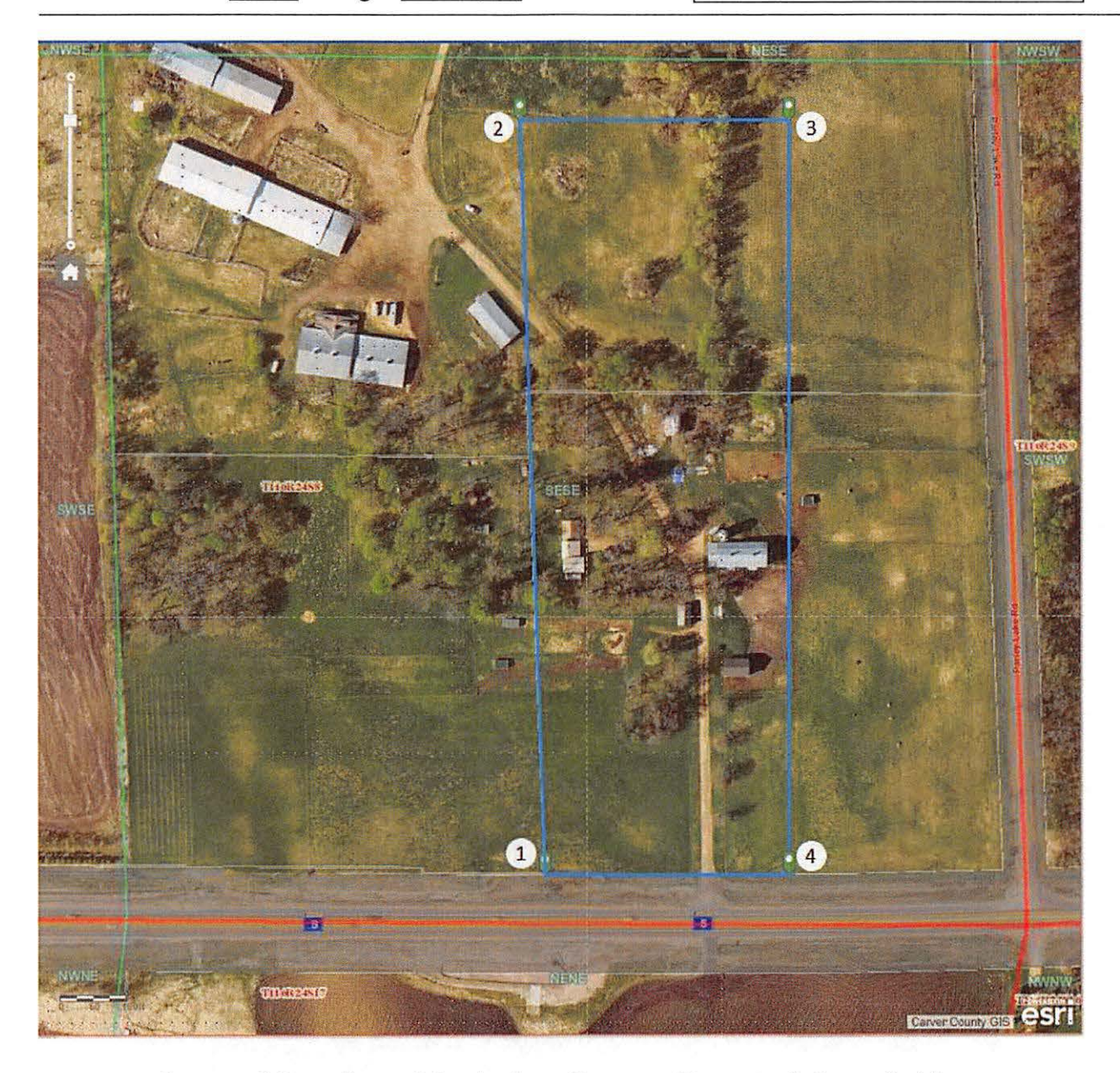
Corrected Boundary of the Andrew Peterson Farmstead shown in blue.

Name of multiple listing (if applicable)