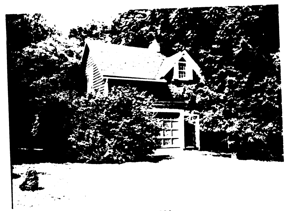
South side of barn, 1984. Neg. file #7-6