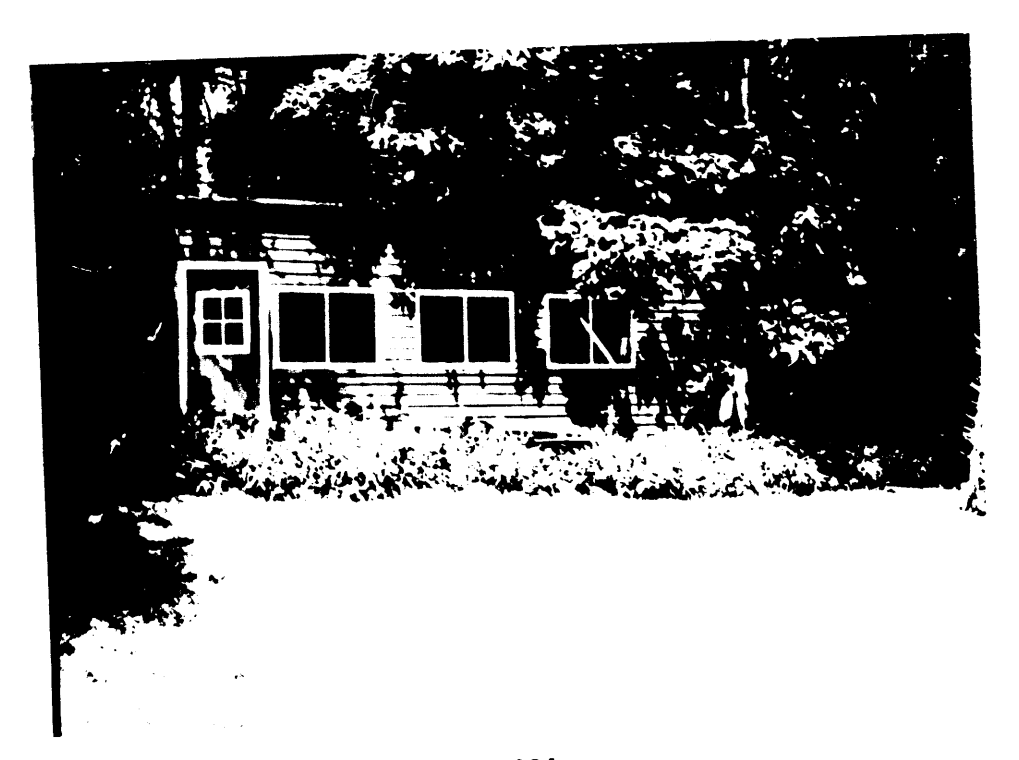
Chicken house in 1984 Neg. file #7-7