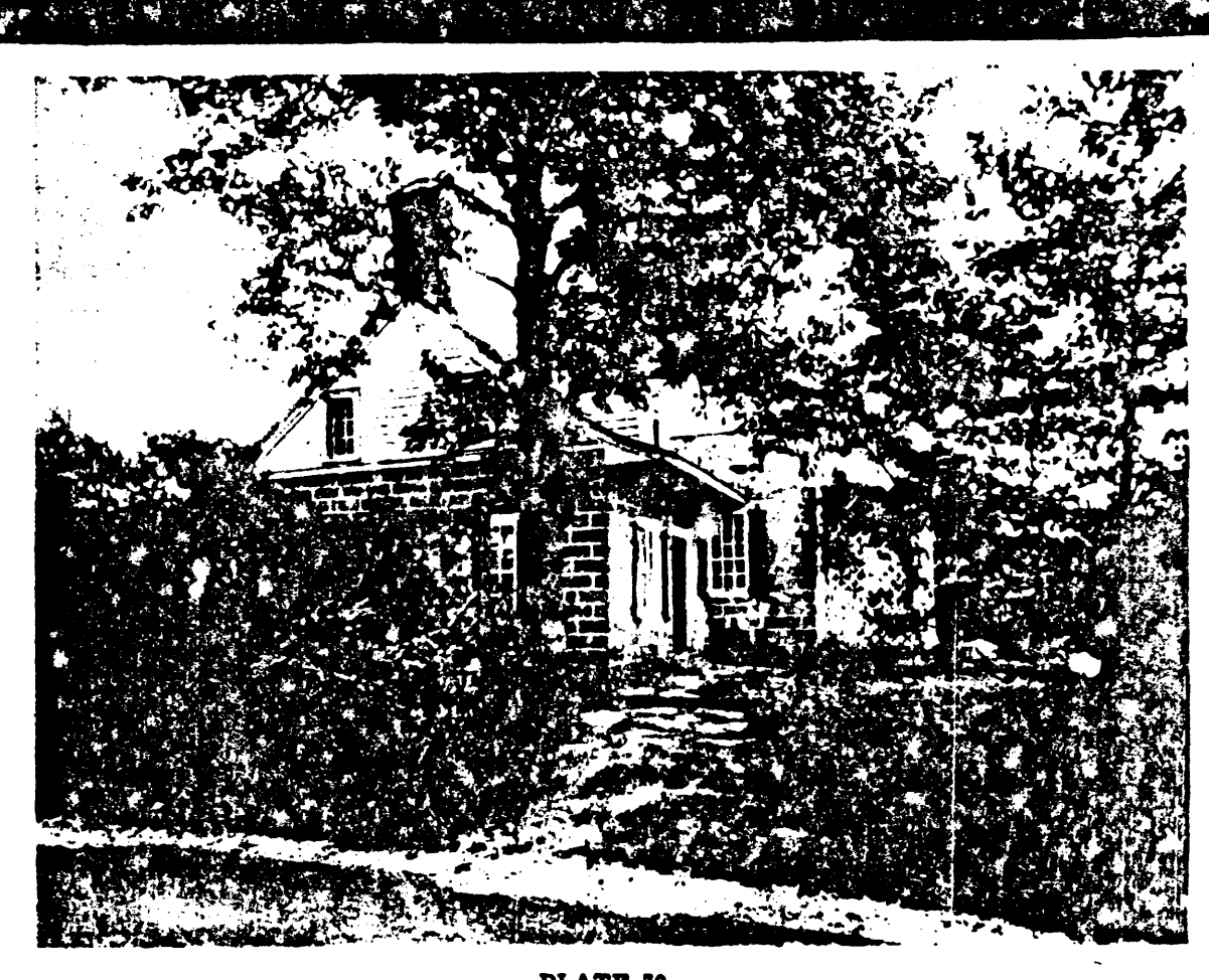
PLATE 70 Achenbach House Chestnut Ridge Road, Saddle River