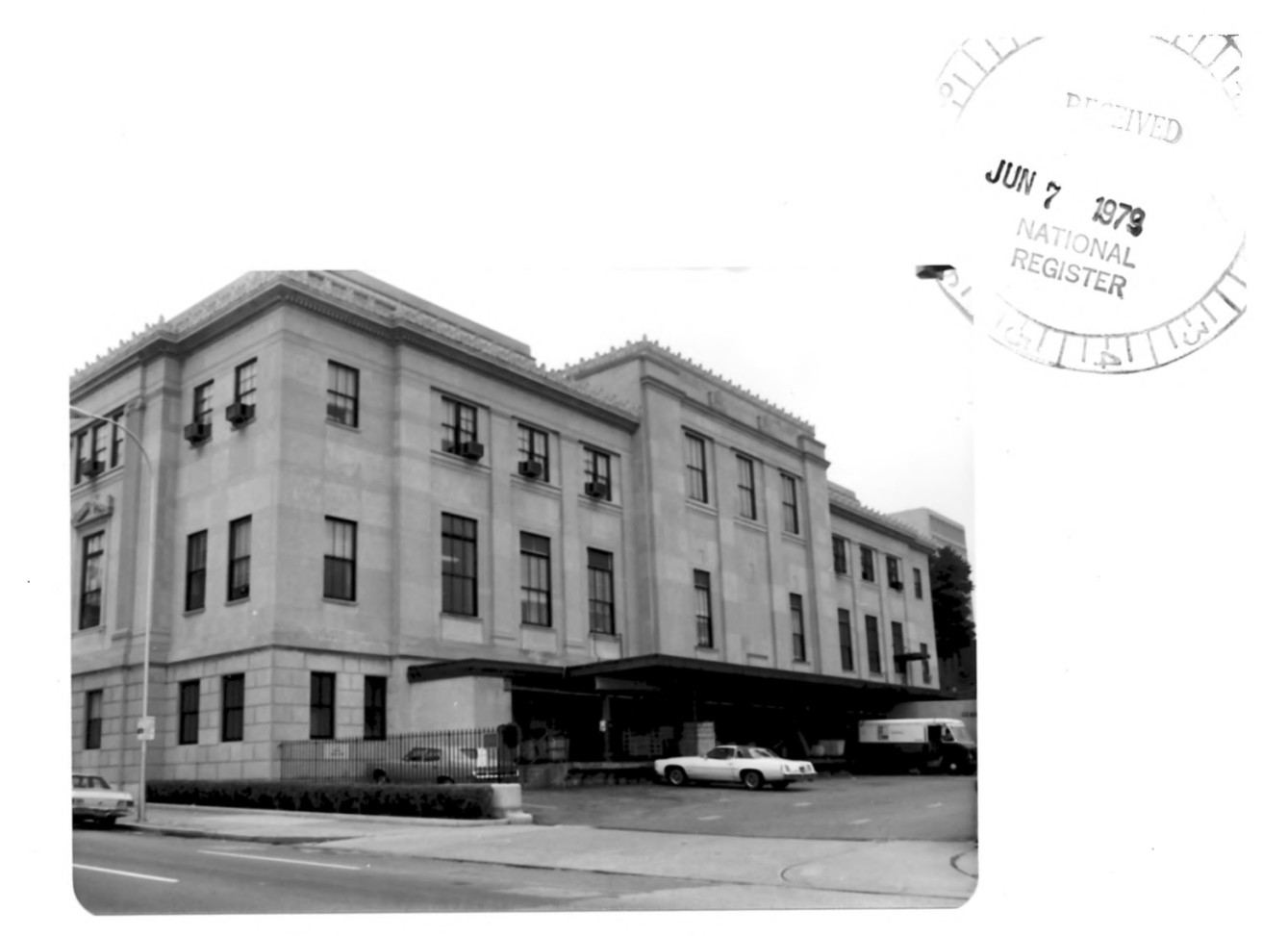
Looking at loading dock at rear of subject property