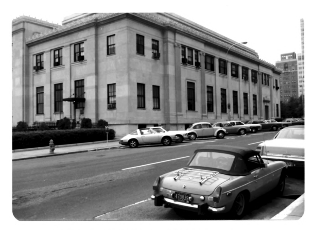
Looking at King Street side of subject property

Looking at Market Street side of subject property from 12th Street