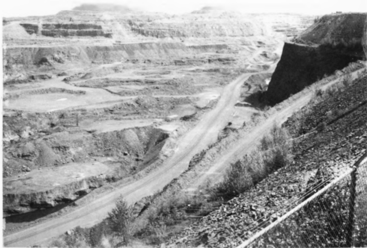
View from observation platform