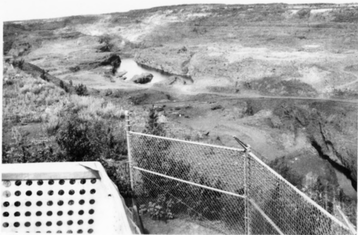
View from observation platform