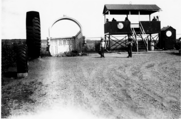
Viewing platform near Hibbing, MN.