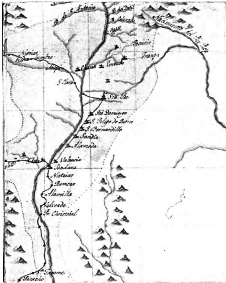
2. Section of a 1779 map showing the Camino Real between Santa Fe and Fra Cristobal.