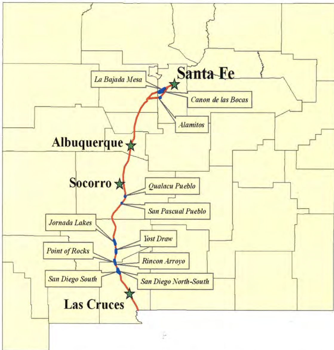
1. Map of the state of New Mexico showing the sections of the Camino Real referenced in the attached National Register nominations.