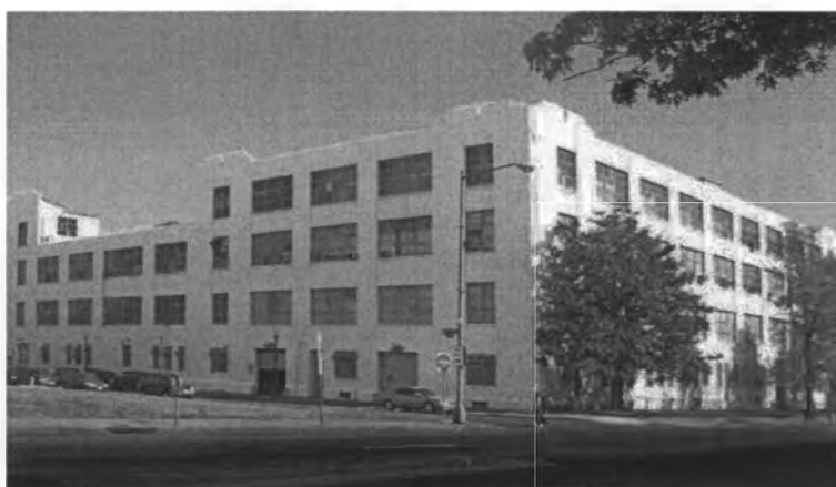
C&P Company Warehouse (1927) 1111 North Capitol Street, NE