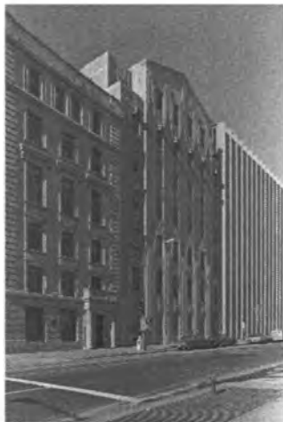
C&P Headquarters Building (1928-29) 726-730 12 th Street, NW