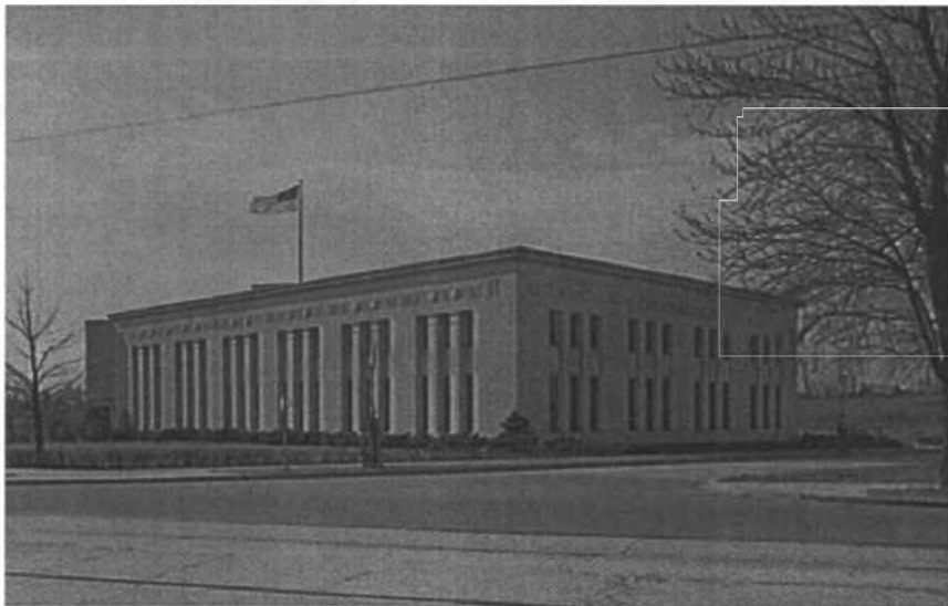
Emerson Exchange (1932) 4268 Wisconsin Avenue, NW