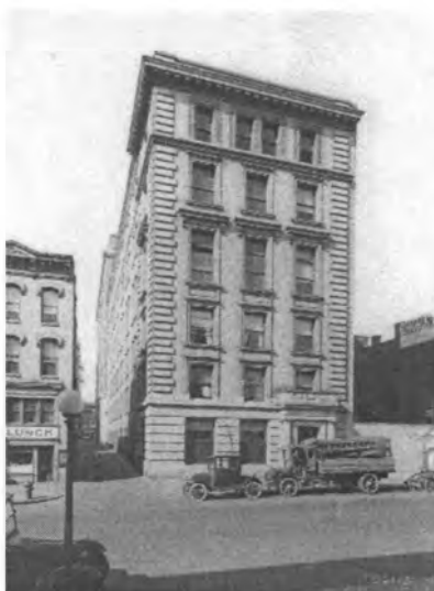
Main Exchange (1903-04) 724 12 th Street, NW