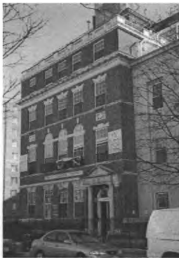
Columbia Exchange (1908) 1420 Columbia Road, NW