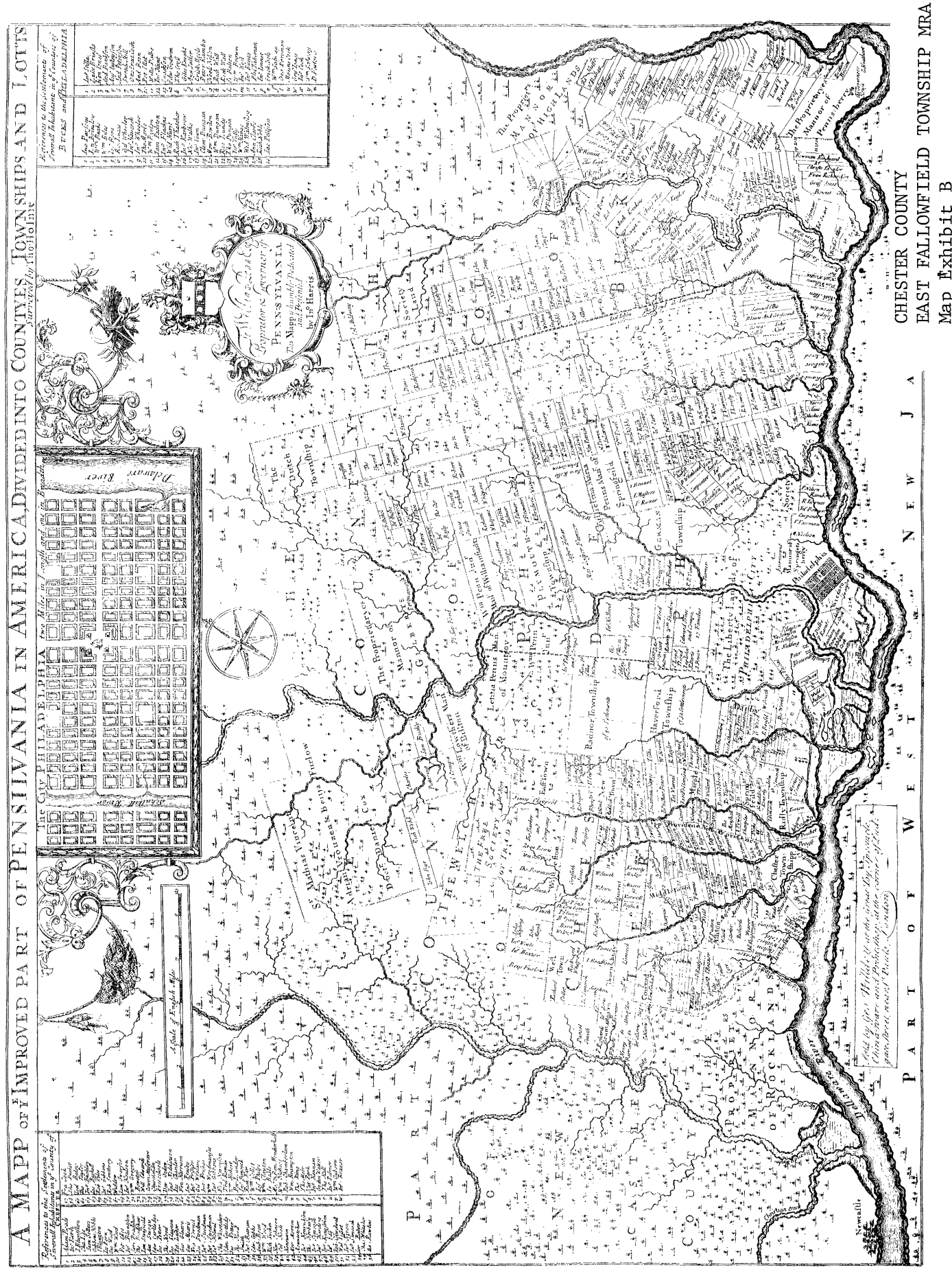
Map Exhibit B Thomas Holmes 1691