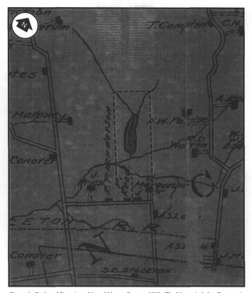
Figure 6. Pugh and Downing. Map of Mercer County. 1903. The Mountain Lakes Preserve is outlined in red. Scale: 1 inch= 1220 feet.