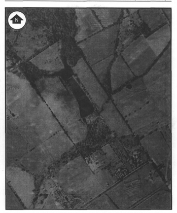
PRINCETON ICE COMPANY/MOUNTAIN LAKES PRESERVE, MERCER COUNTY, NJ