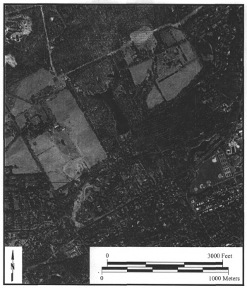
Figure 10. Aerial photograph, 2002.