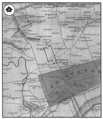
Figure 3. Everts & Stewart. Combination Atlas Map of Mercer County. 1875. The Mountain Lakes Preserve is outlined in red. Scale: 1 inch= 2390 feet.