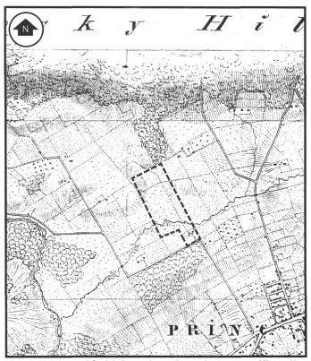
Figure 2. U. S. Coast and Geodetic Survey. Interior Topography: Princeton and Vicinity, New Jersoy, 1840. The future site of the Princeton Ice Company is outlined. Scale: 1 inch= 1660 feet.