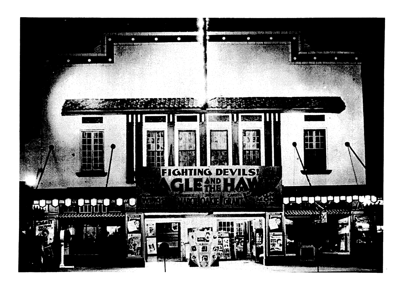
Figure 7-1: Front Facade, 1933, Prior to c. 1946 Modernistic Update

Lyceum Theater Clovis, Curry County, New Mexico