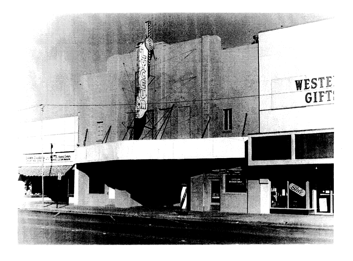
Figure 7-2: Entry, 1982, Prior to Removal of North Commercial Space and Façade Restoration

Lyceum Theater Clovis, Curry County, New Mexico