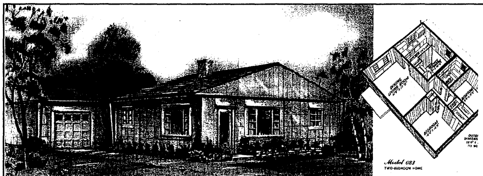
Two-bedroom Newport with Lustron garage, elevation and plan.