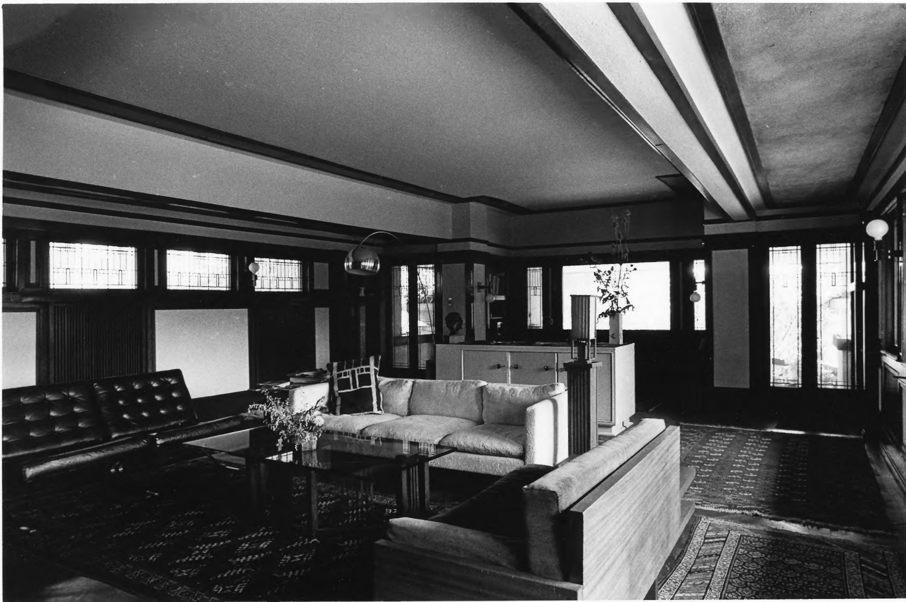
F.F. TOMEK HOUSE Riverside, Illinois Living Room, looking east