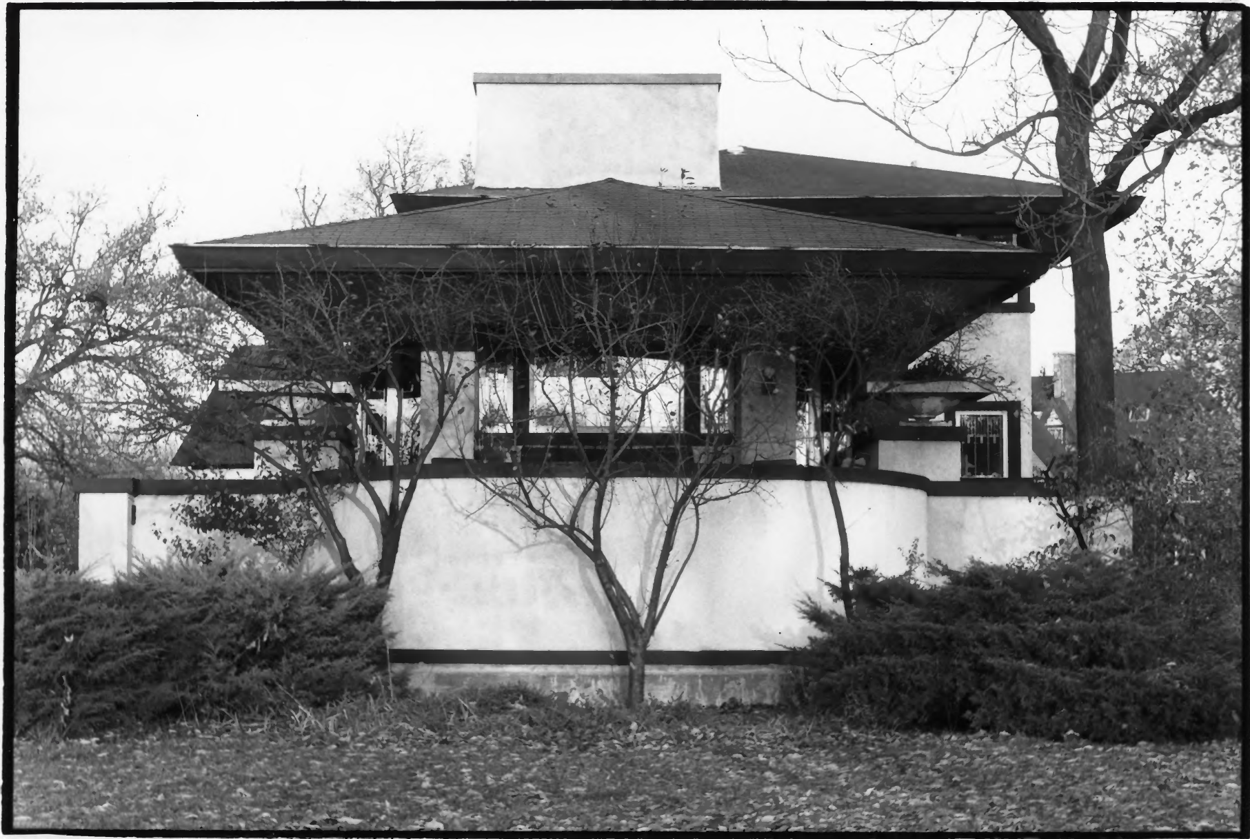
F.F. TOMEK HOUSE Riverside, Illinois East Elevation Facade Photo by Tom Moran, 1992