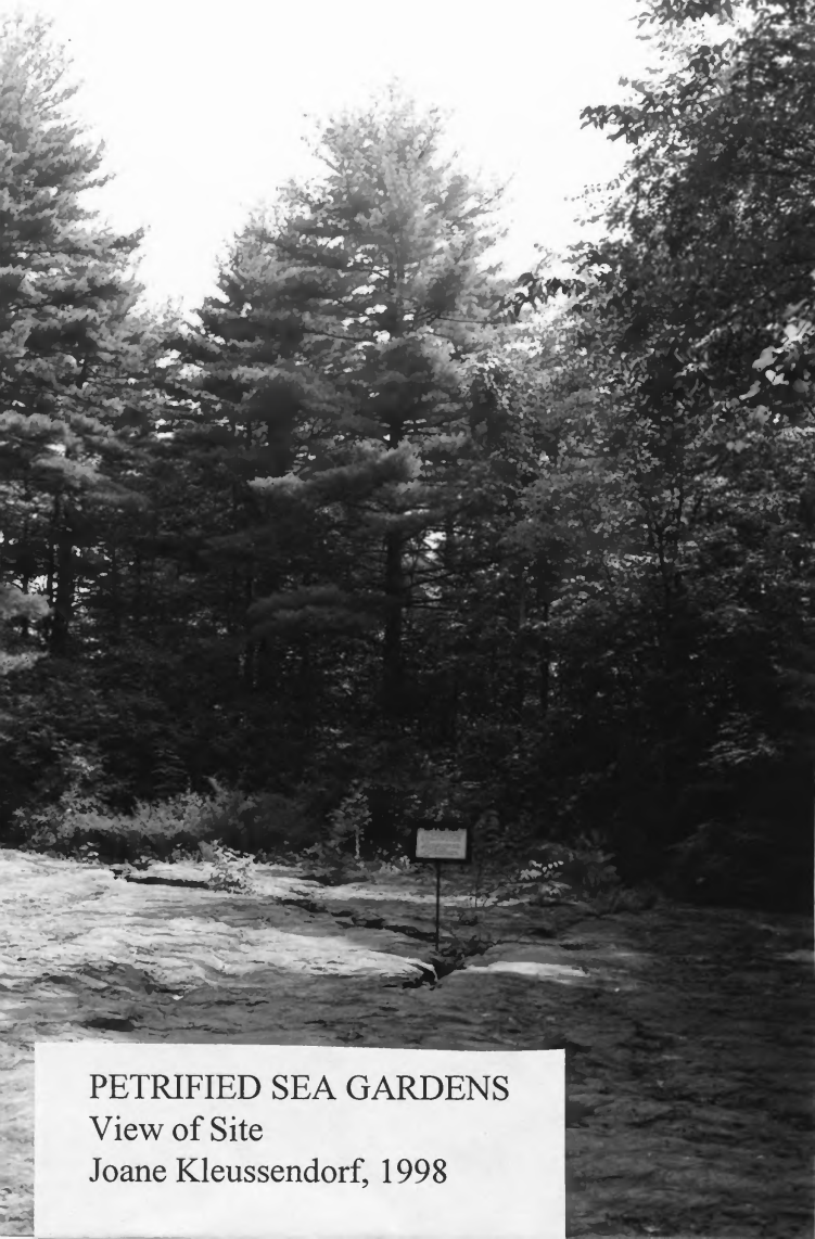
PETRIFIED SEA GARDENS View of Site Joane Kleussendorf, 1998