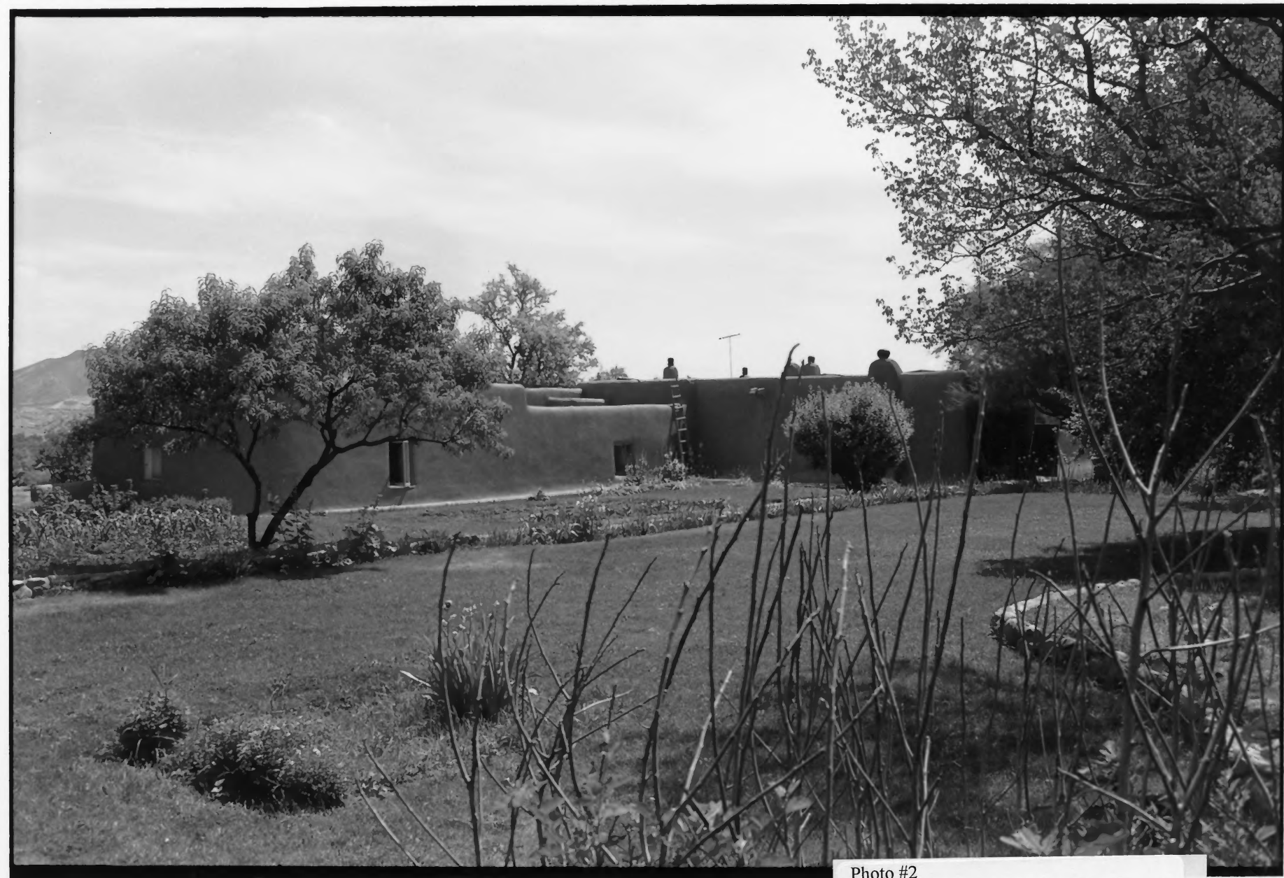
Photo #2 O'Keeffe, Georgia, Home and Studio Abiquiú, New Mexico South and west elevations, looking northeast from garden. HABS, 1996