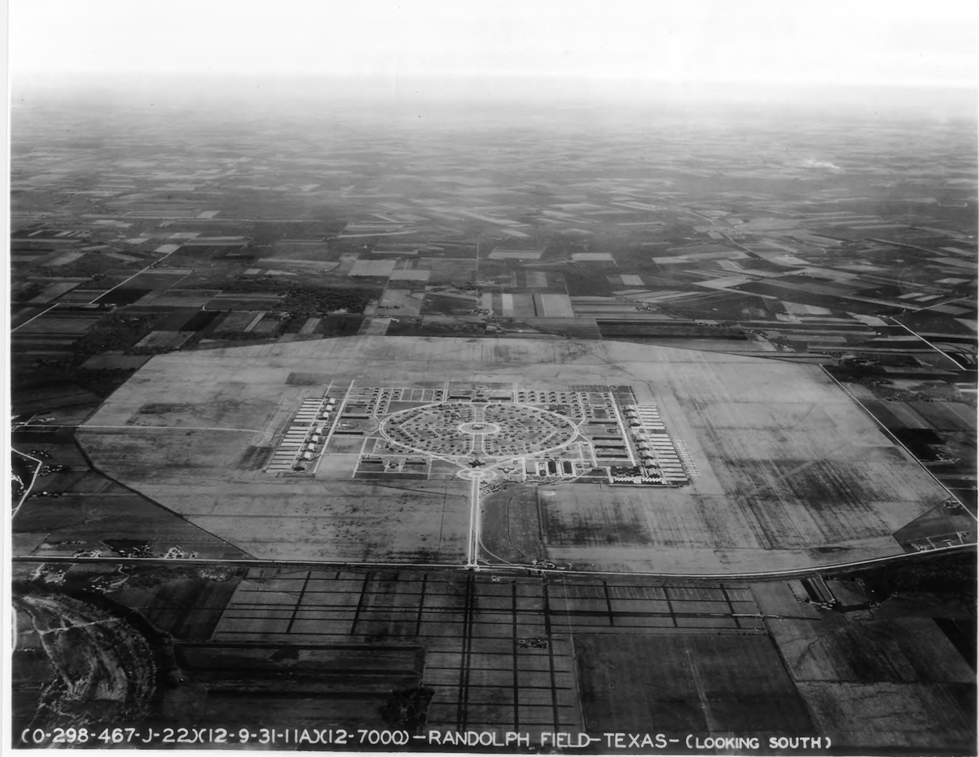
(O-298-467-J-22)(12-9-31-11A)(12-7000) - RANDOLPH FIELD - TEXAS - (LOOKING SOUTH)