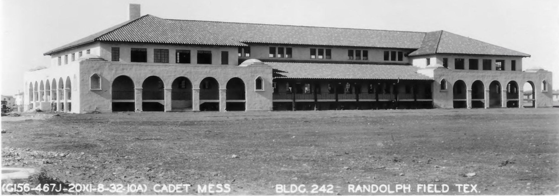
(G156-467J-20)(I-8-32-10A) CADET MESS