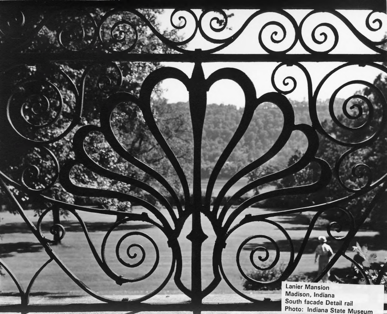
Lanier Mansion Madison, Indiana South facade Detail rail