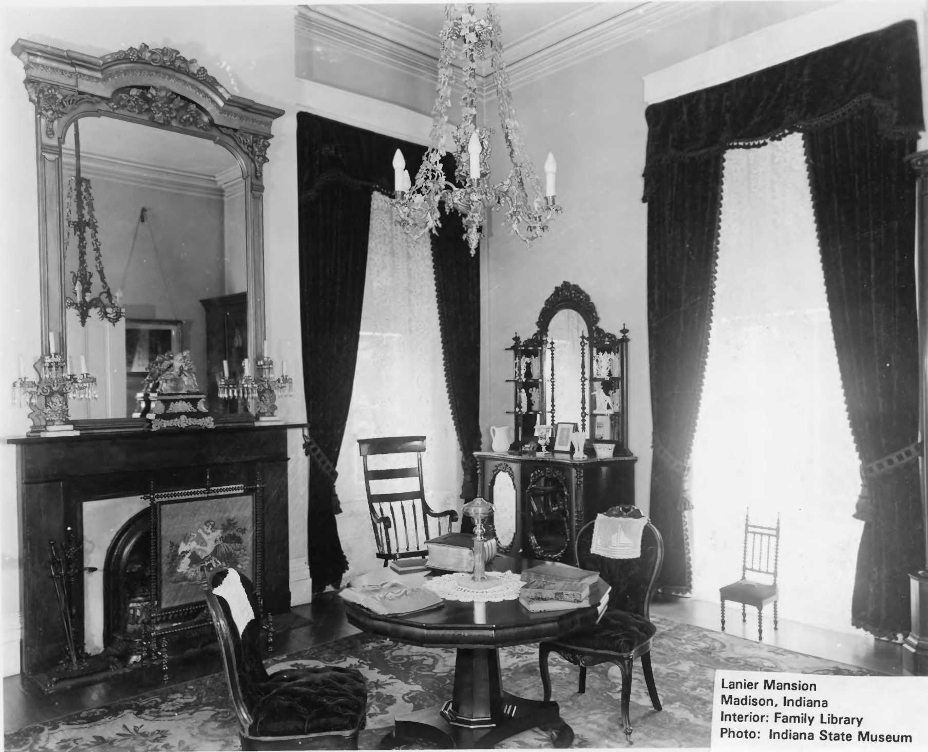
Lanier Mansion Madison, Indiana Interior: Family Library