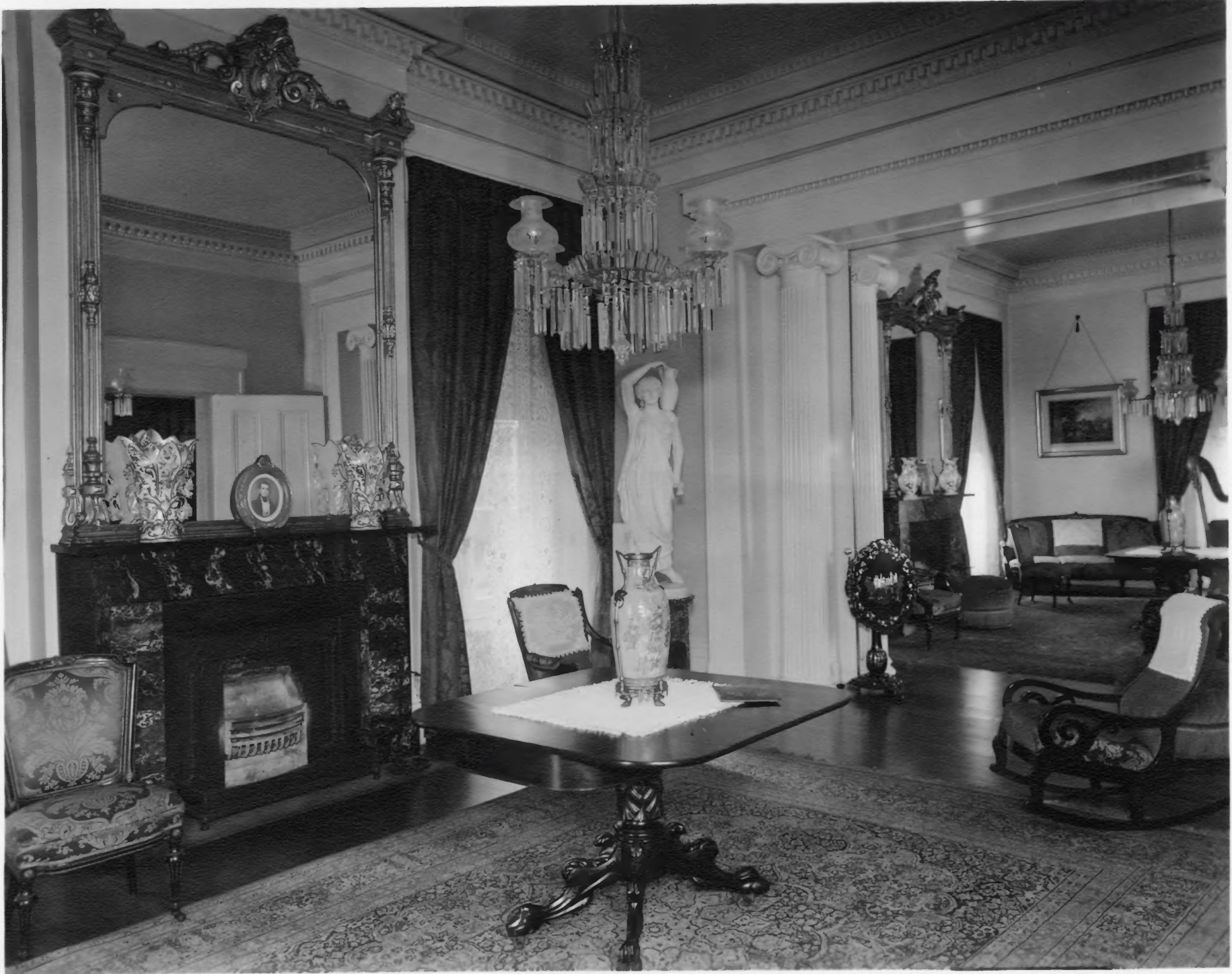
Lanier Mansion Madison, Indiana Double Parlor