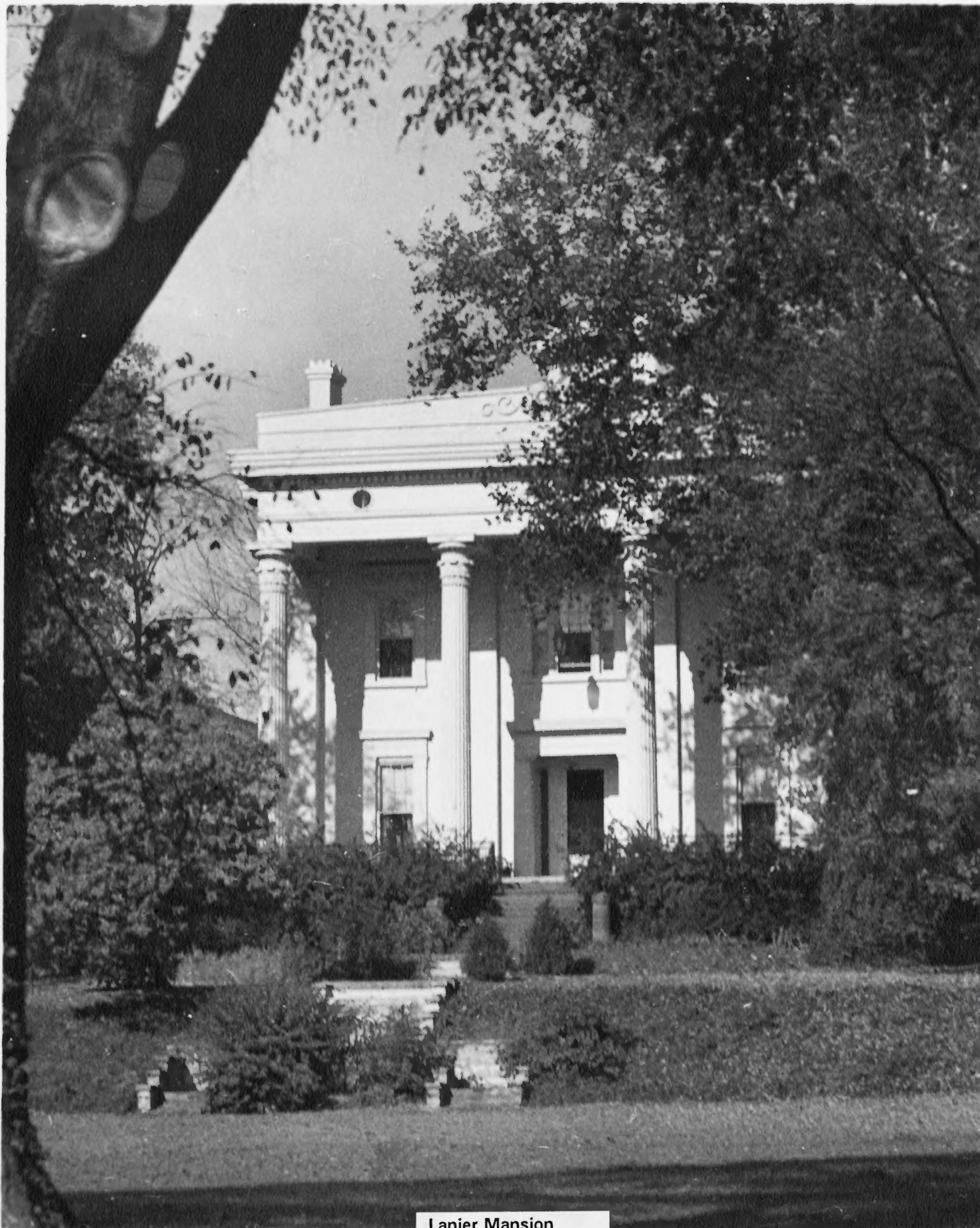
Lanier Mansion Madison, Indiana River front