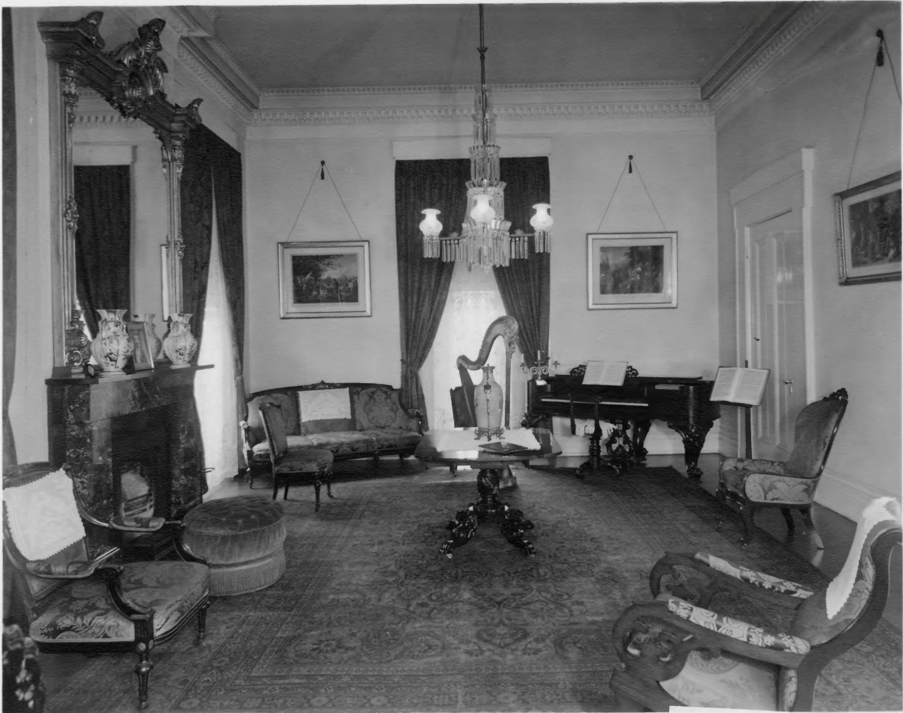
Lanier Mansion Madison, Indiana North Double Parlor