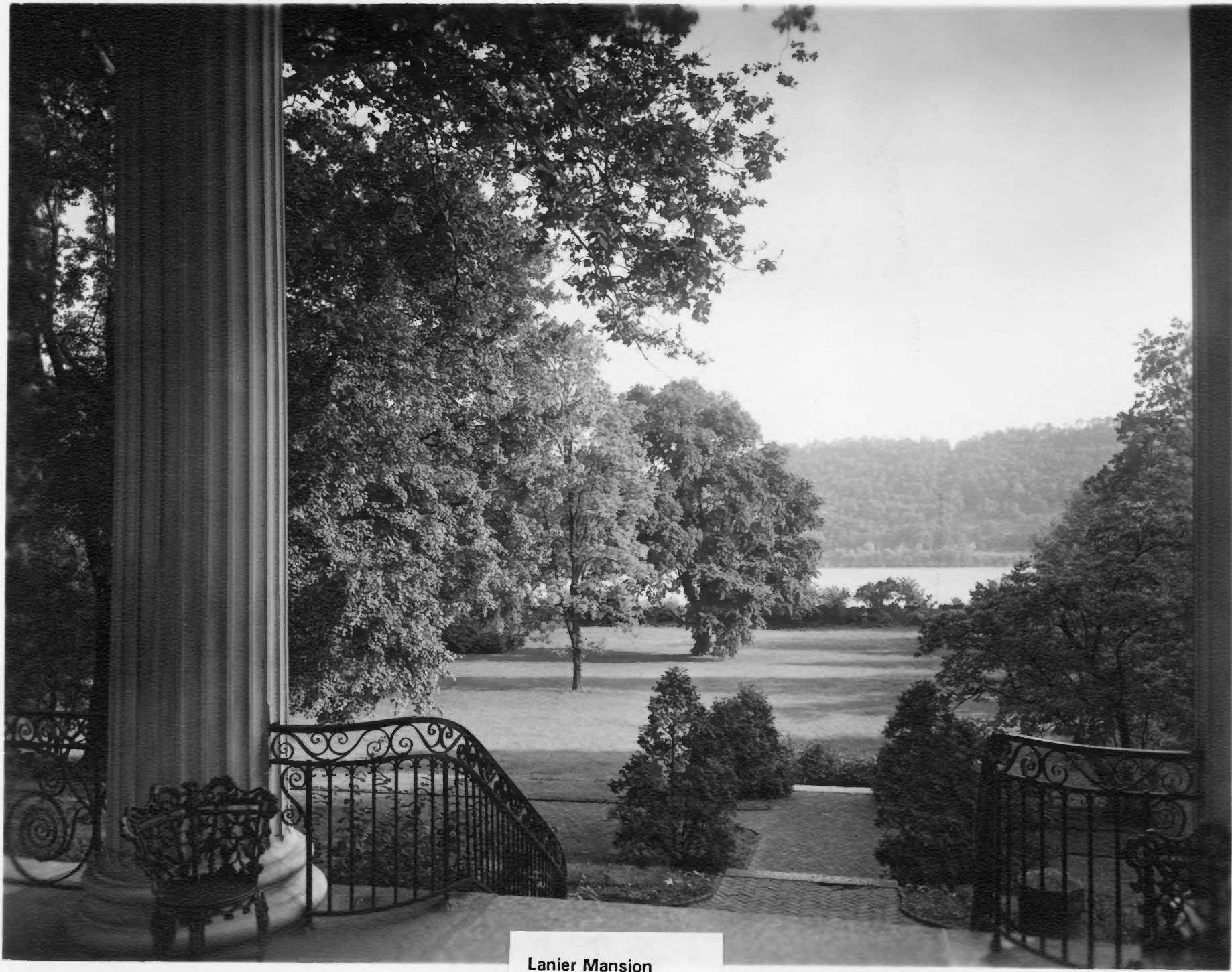
Lanier Mansion Madison, Indiana View of Ohio River