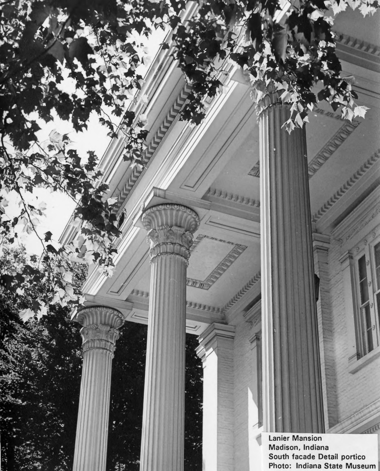
Lanier Mansion Madison, Indiana South facade Detail portico