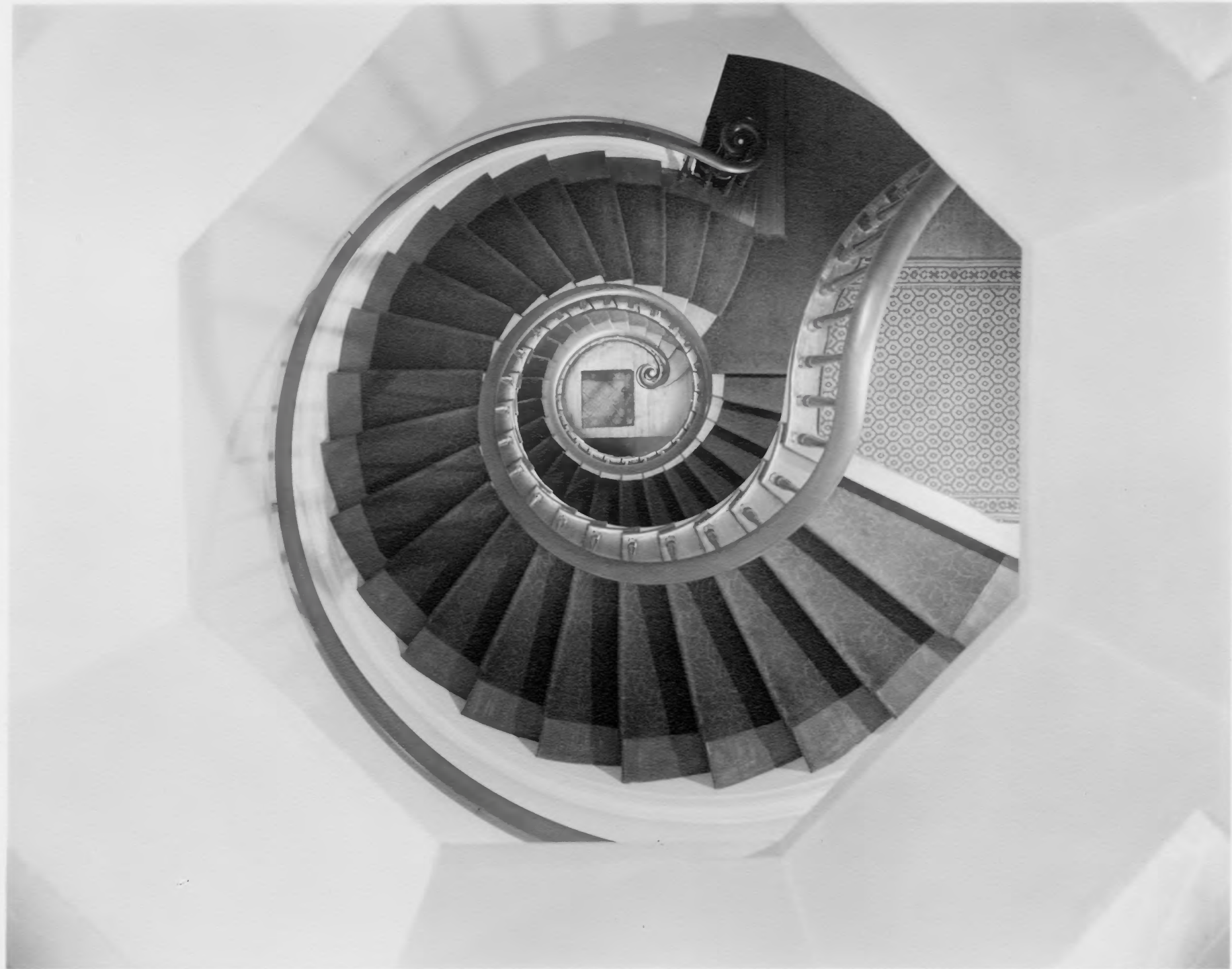
Lanier Mansion Madison, Indiana Circular Stair