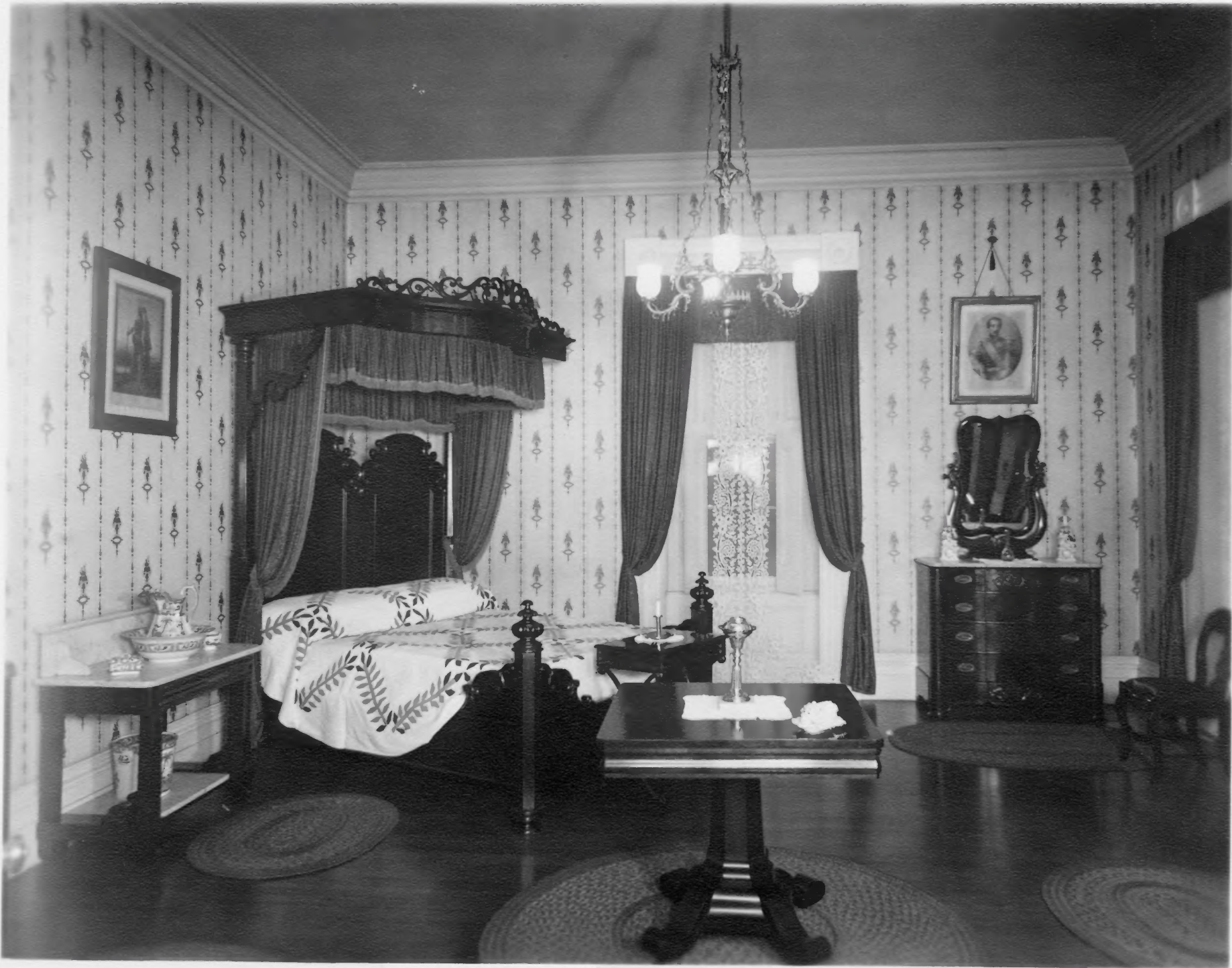
Lanier Mansion Madison, Indiana Southwest Bedroom