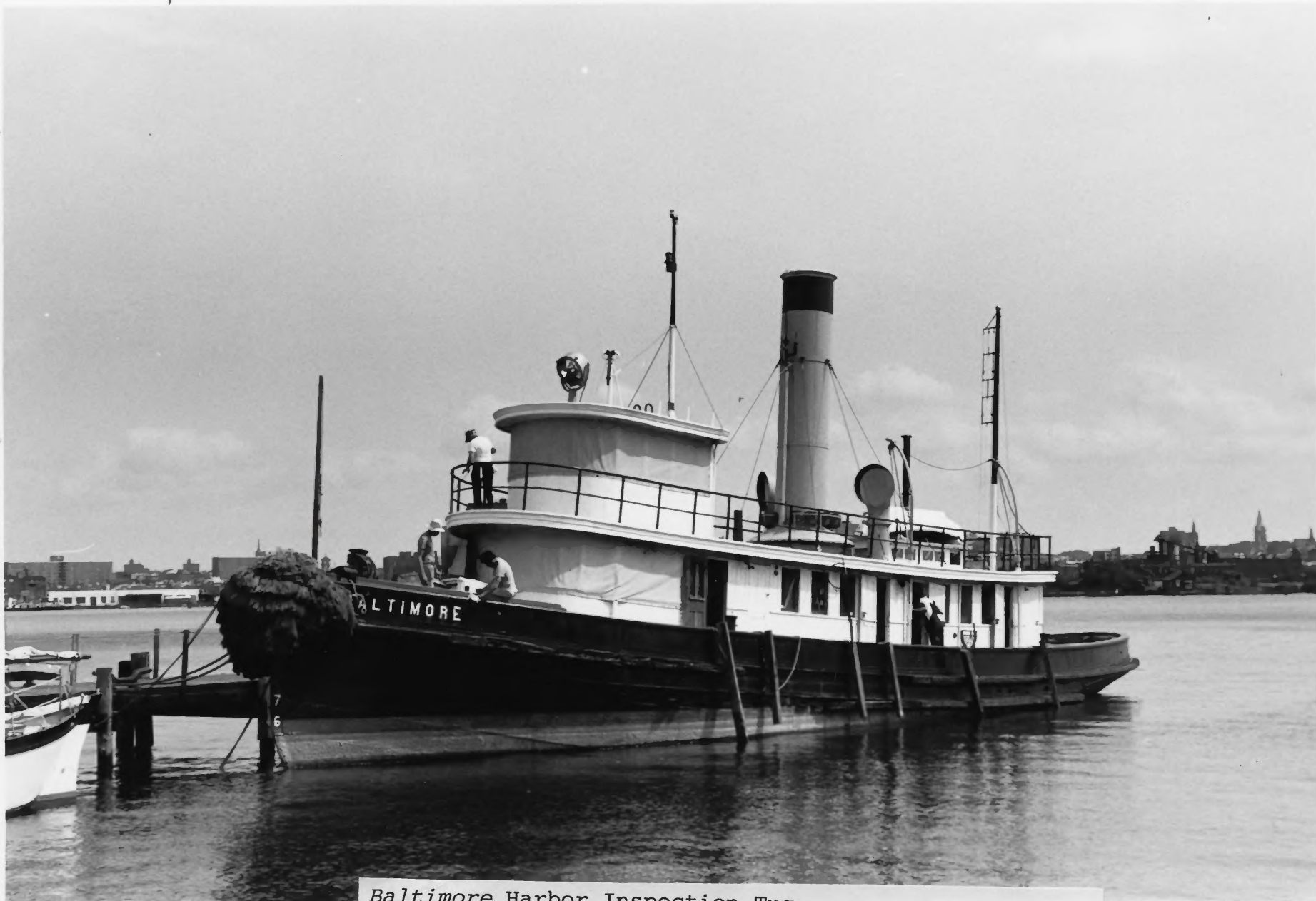
Baltimore Harbor Inspection Tug Baltimore City, Maryland Bow quarter view at museum pier National Park Service Photo by Candace Clifford, 1989 Photo # 2