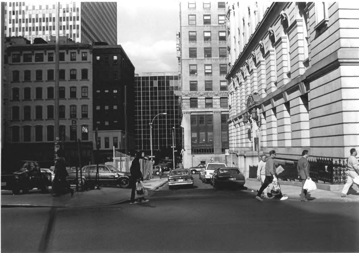
Figure 5. View of Elk Street, from Chambers Street, African Burying Ground National Historic Landmark, New York City.