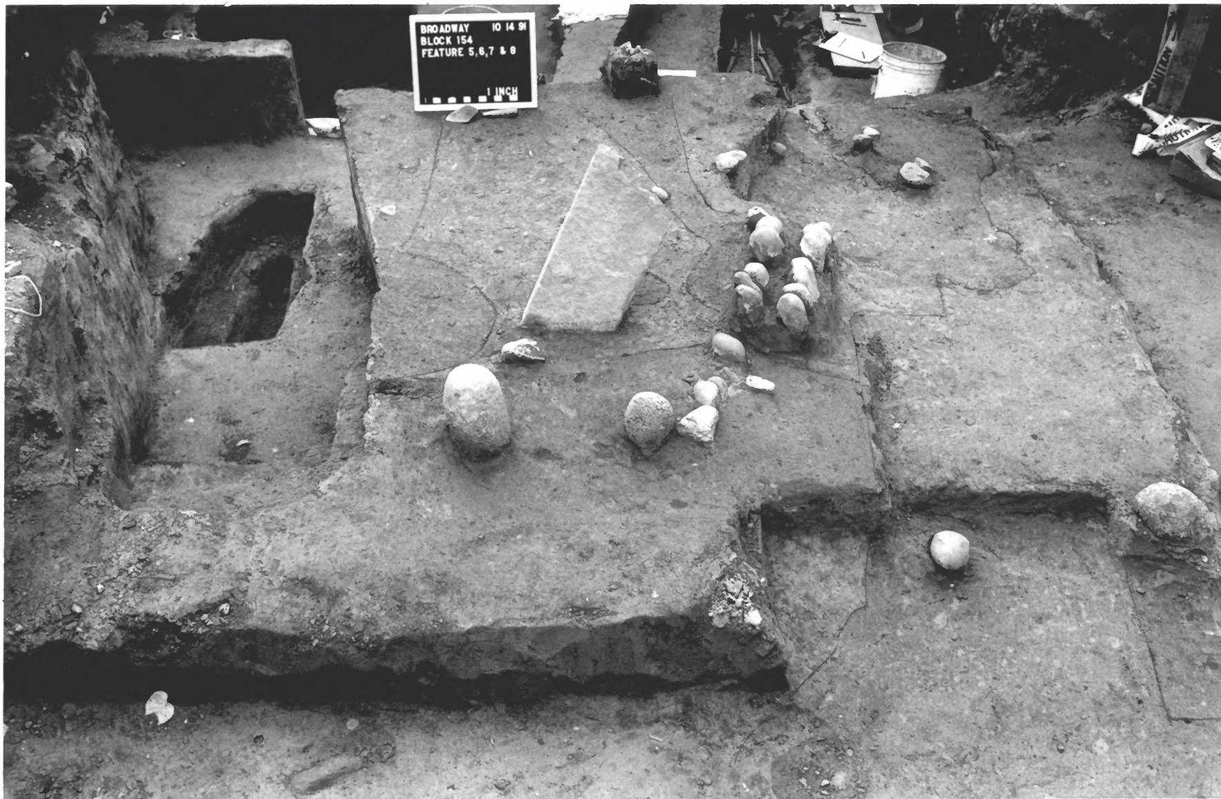
Figure 23. Headstone and cobbles marking graves. African Burying Ground National Historic Landmark, New York City. (Photograph: Dennis Seckler, 1992).