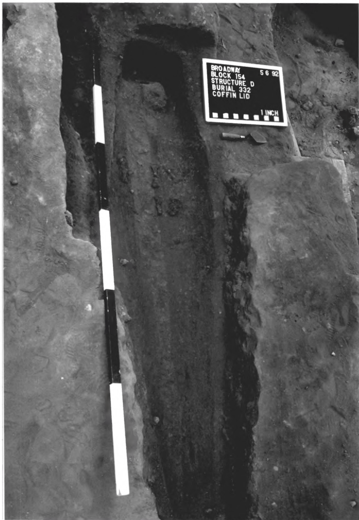
Figure 25. Tack-decorated coffin lid with initials "H W" and date "17[3]8." African Burying Ground National Historic Landmark, New York City.