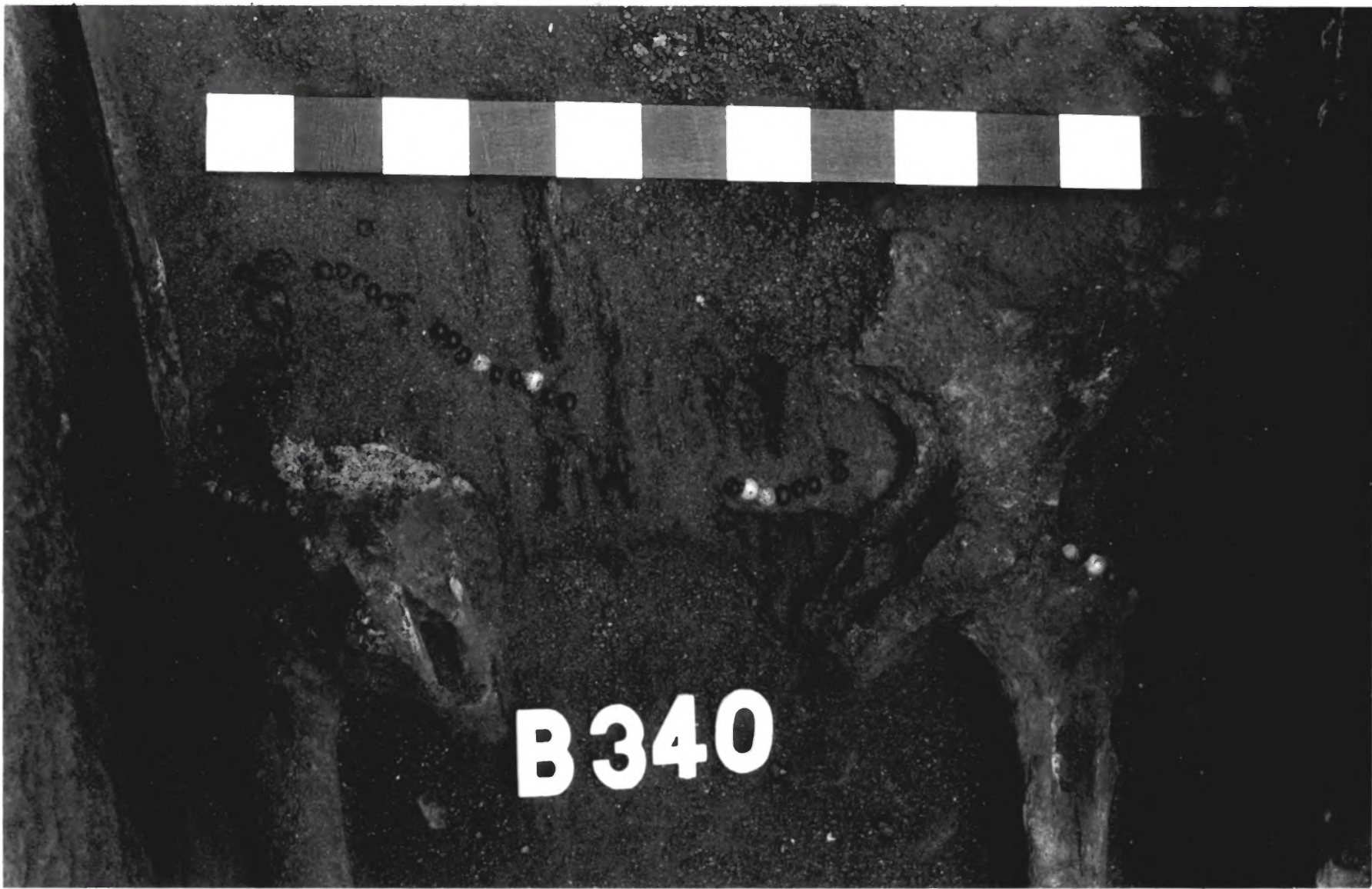
Figure 29. Detail of remains of a woman wearing a girdle of glass beads and cowrie shells. African Burying Ground National Historic Landmark, New York City.