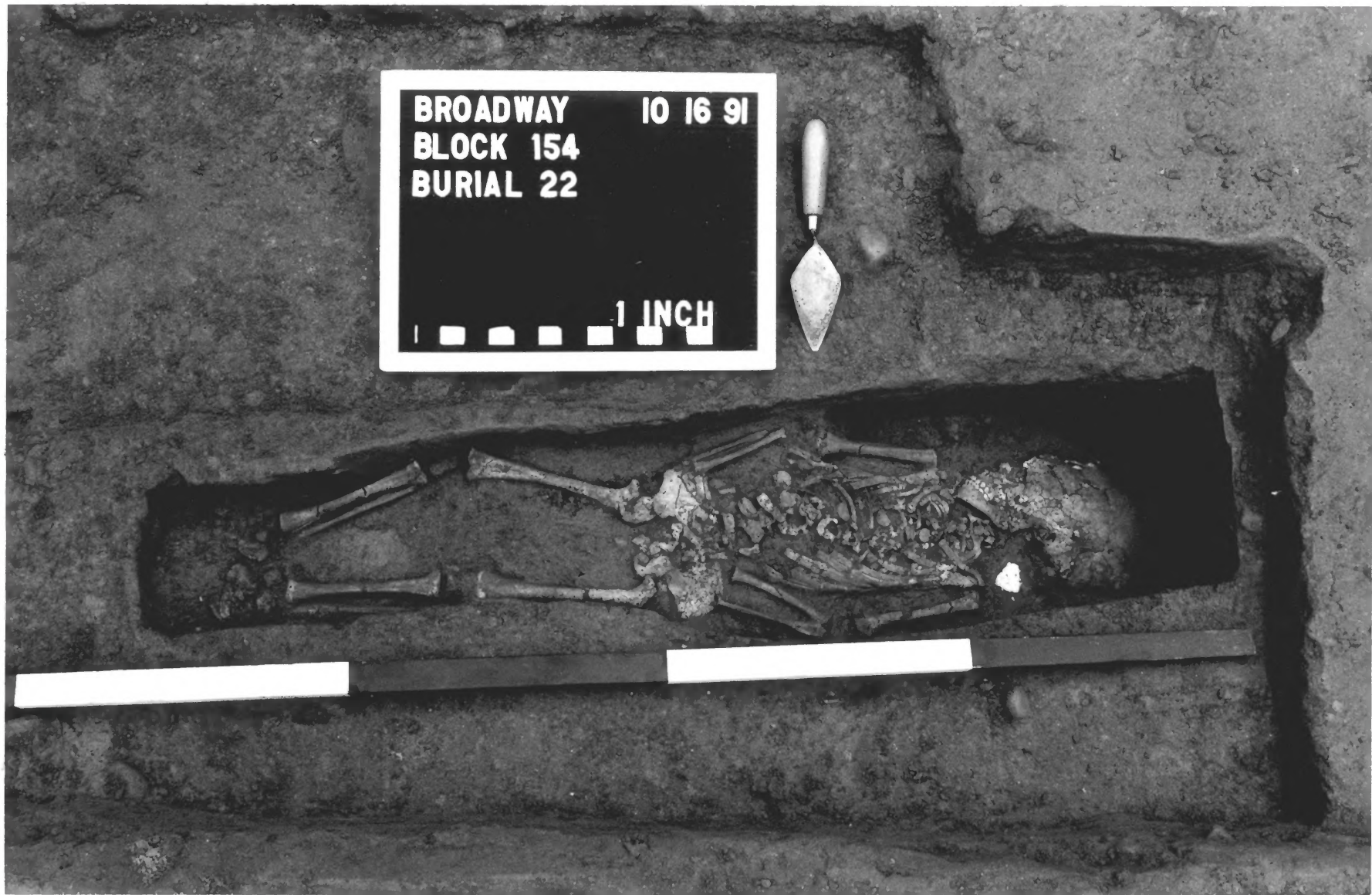
Figure 26. Remains of young child. African Burying Ground National Historic Landmark, New York City..