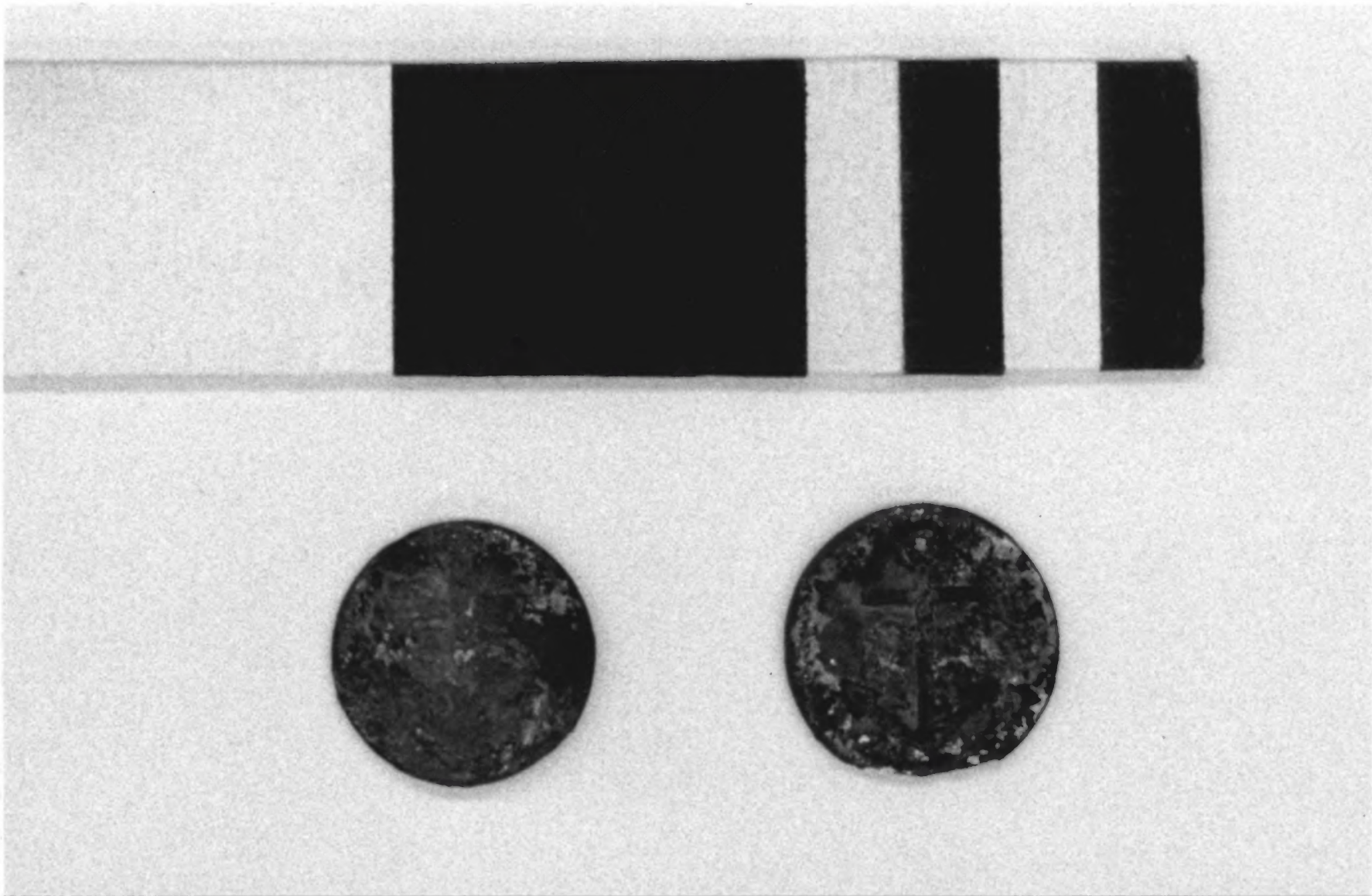
Figure 28. Gilt buttons with molded anchor design. African Burying Ground National Historic Landmark, New York City.