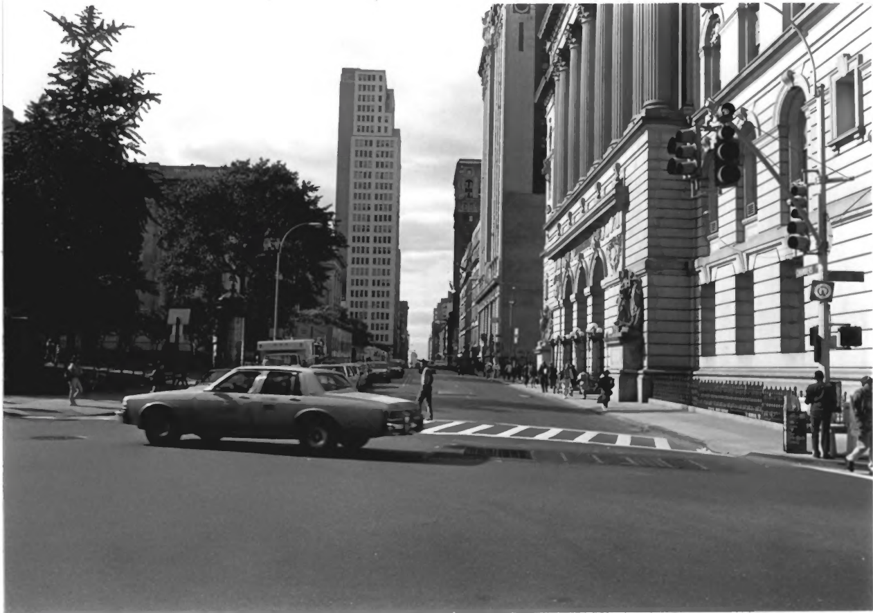
Figure 4. View of Chambers Street, southern boundary of the African Burying Ground National Historic Landmark, New York City.