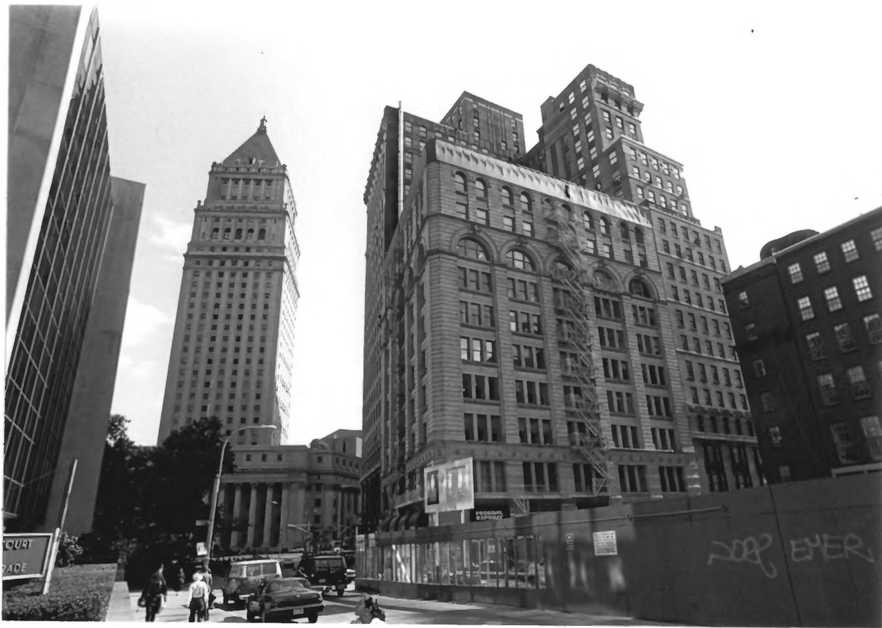
Figure 7. View of northeast portion of the African Burying Ground National Historic Landmark from Duane Street. Pavilion site in foreground. New York City.