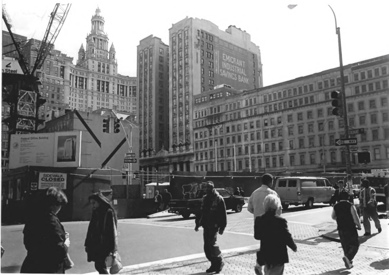
Figure 6. View of African Burying Ground National Historic Landmark from corner of Broadway and Duane Streets. Federal building excavation in foreground. New York City.