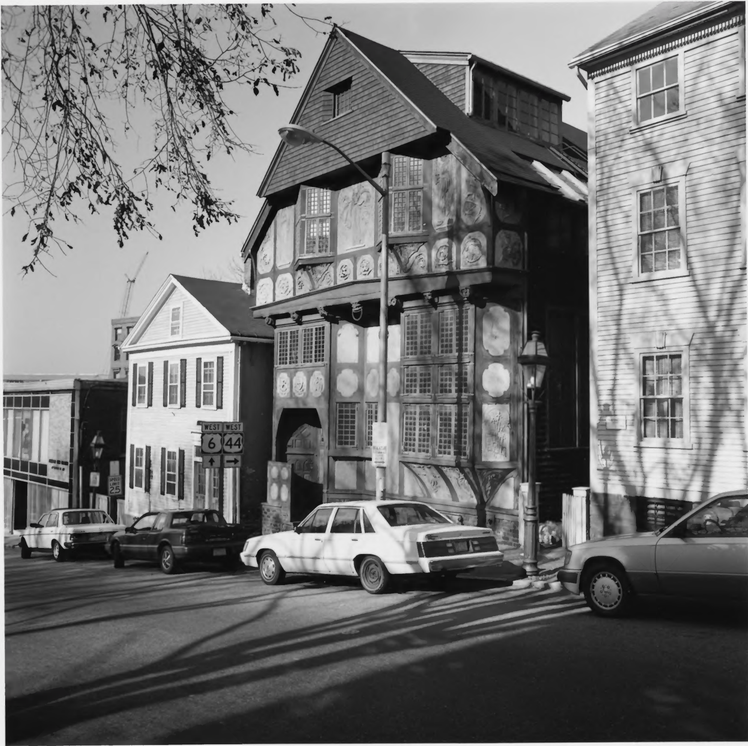
FLEUR-DE-LYS STUDIOS Providence, Rhode Island Front facade on Thomas Street Photo by B. Clarkson Schoettle, 11/91