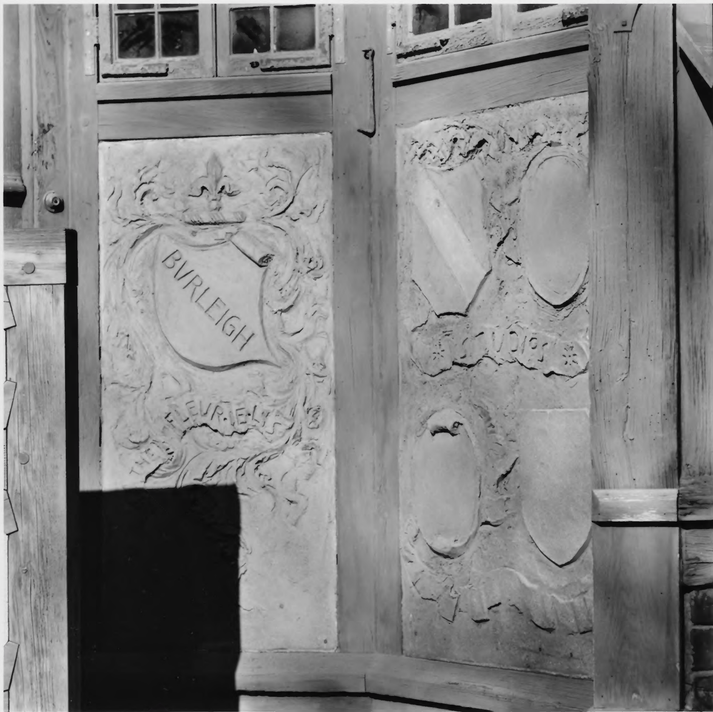
FLEUR-DE-LYS STUDIOS Providence, Rhode Island Detail of stucco work and windows at entrance Photo by B. Clarkson Schoettle, 11/91