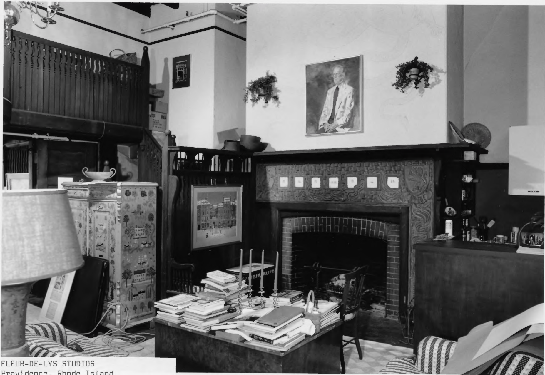
FLEUR-DE-LYS STUDIOS Providence, Rhode Island North studio, first story