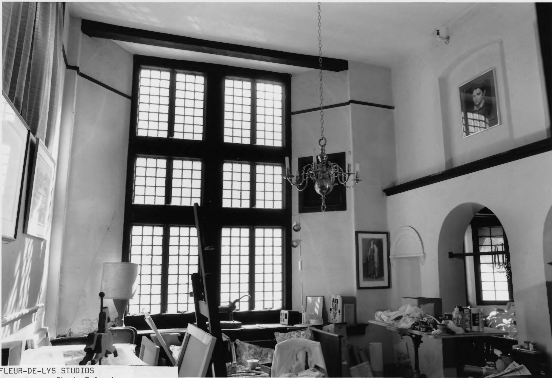
FLEUR-DE-LYS STUDIOS Providence, Rhode Island South studio, first story Photo by B. Clarkson Schoettle, 11/91