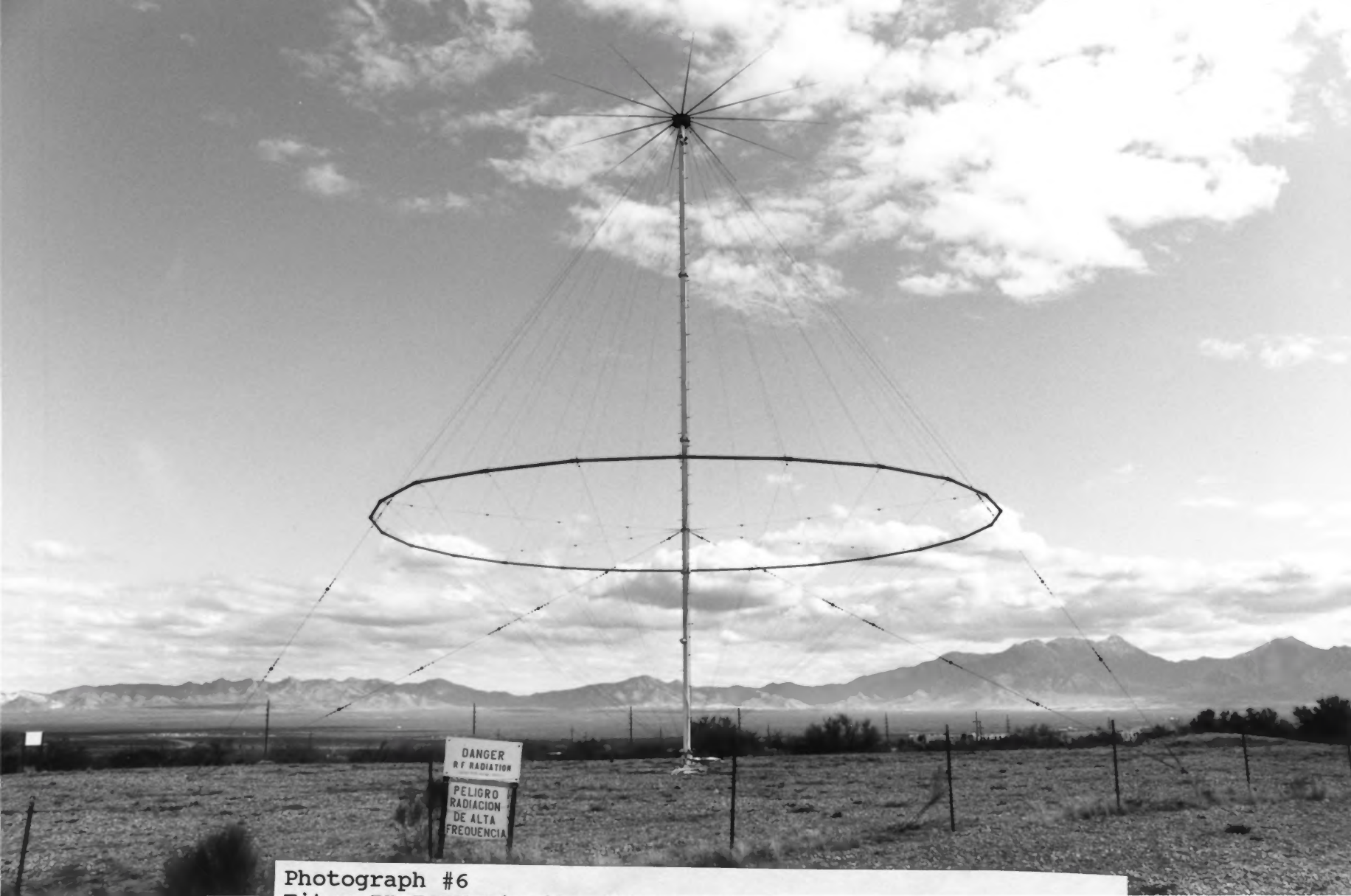
Photograph #6 Titan II ICBM Missile Site 8 (571-7) Green Valley, Pima Co., Arizona High-frequency discage antenna (non-contiguous contributing resource) located 200' southeast of main entrance.