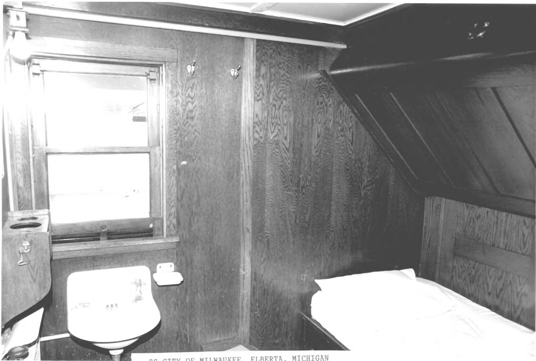
SS CITY OF MILWAUKEE, ELBERTA, MICHIGAN Owner: ASSOC.PRES.OF SS CITY OF MILWAUKEE TYPICAL STATEROOM. Photo #8 by BILL HERD, 1990 Courtesy of OWNER