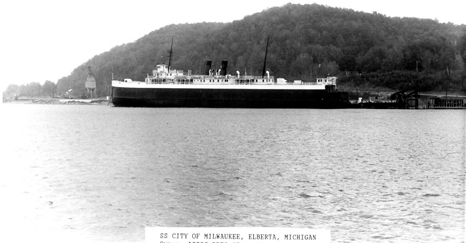
SS CITY OF MILWAUKEE, ELBERTA, MICHIGAN Owner: ASSOC.PRES.OF SS CITY OF MILWAUKEE CITY OF MILWAUKEE TODAY, PORT PROFILE VIEW OF THE VESSEL. Photo #2 by BILL HERD, 1990 Courtesy of OWNER