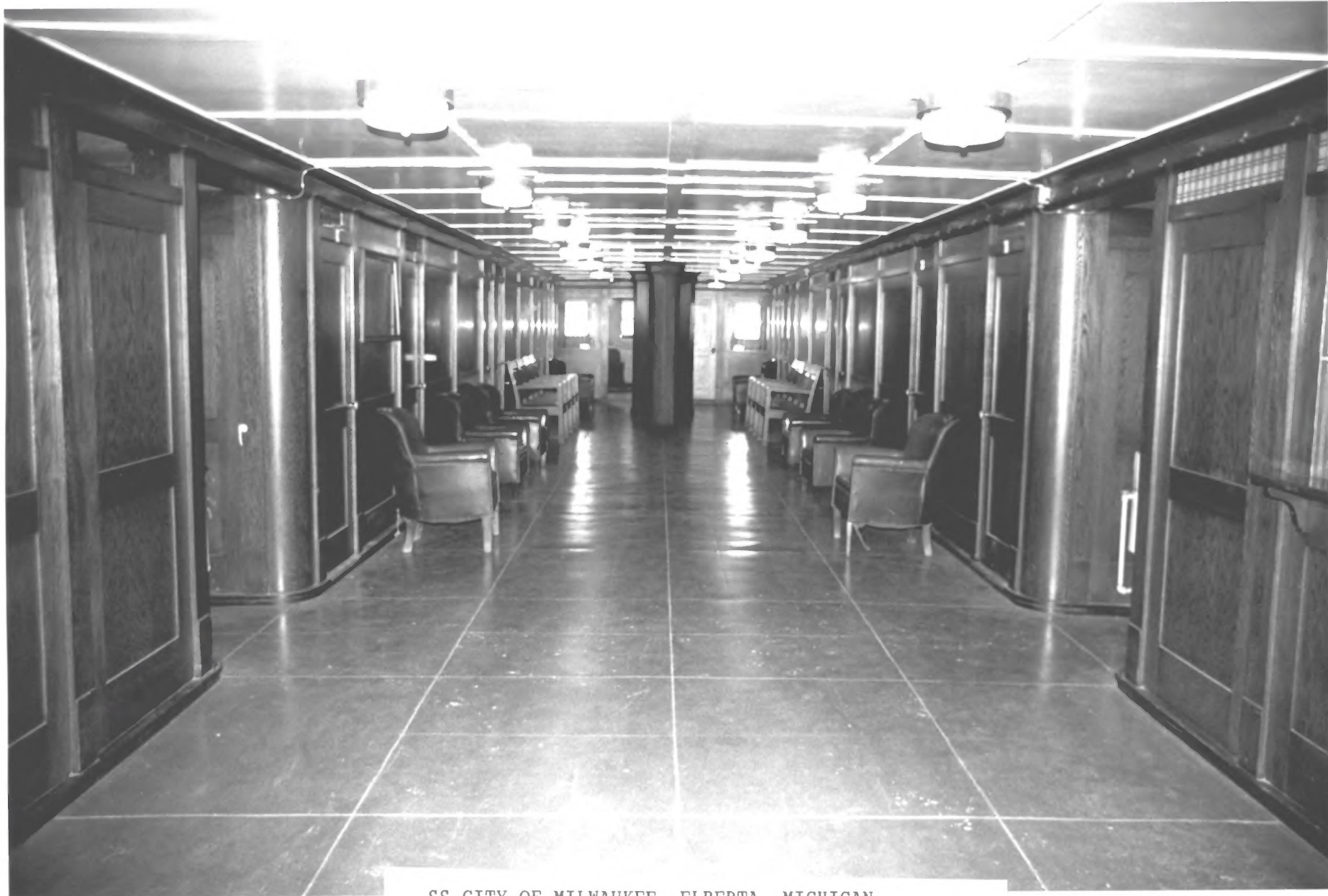
SS CITY OF MILWAUKEE, ELBERTA, MICHIGAN Owner: ASSOC.PRES.OF SS CITY OF MILWAUKEE THE SALOON; DOORS LEAD INTO STATEROOMS. Photo #9 by BILL HERD, 1990 Courtesy of OWNER