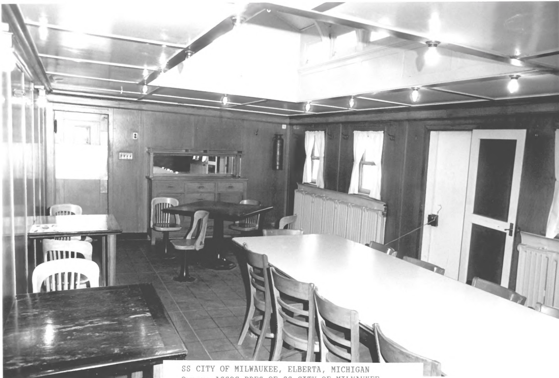
SS CITY OF MILWAUKEE, ELBERTA, MICHIGAN Owner: ASSOC.PRES.OF SS CITY OF MILWAUKEE ENGINEER'S MESS. NOTE THE UNMODIFIED 1930S APPEARANCE OF THE VESSEL. Photo #10 by BILL HERD, 1990 Courtesy of OWNER