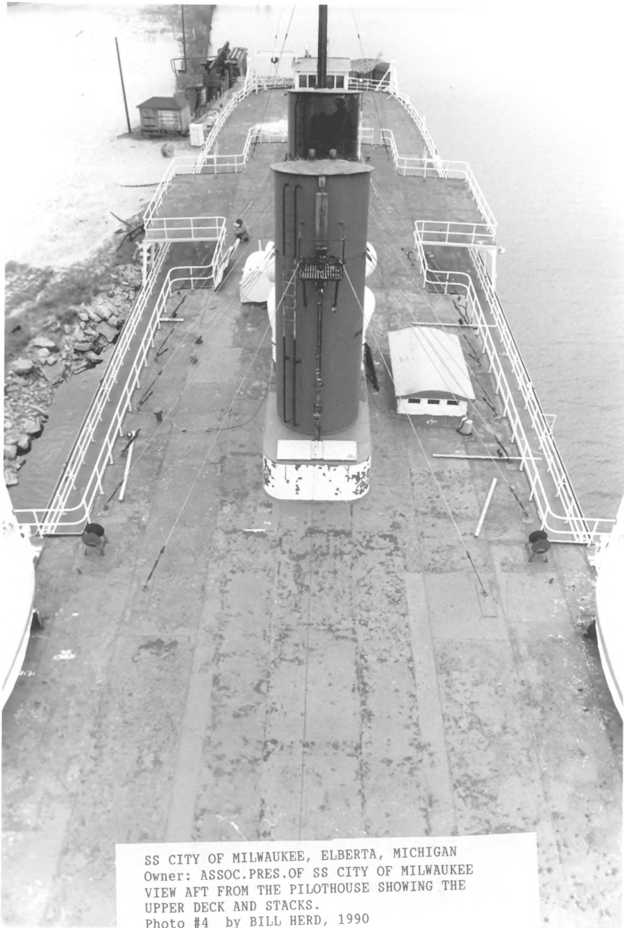
SS CITY OF MILWAUKEE, ELBERTA, MICHIGAN Owner: ASSOC.PRES.OF SS CITY OF MILWAUKEE VIEW AFT FROM THE PILOTHOUSE SHOWING THE UPPER DECK AND STACKS. Photo #4 by BILL HERD, 1990 Courtesy of OWNER