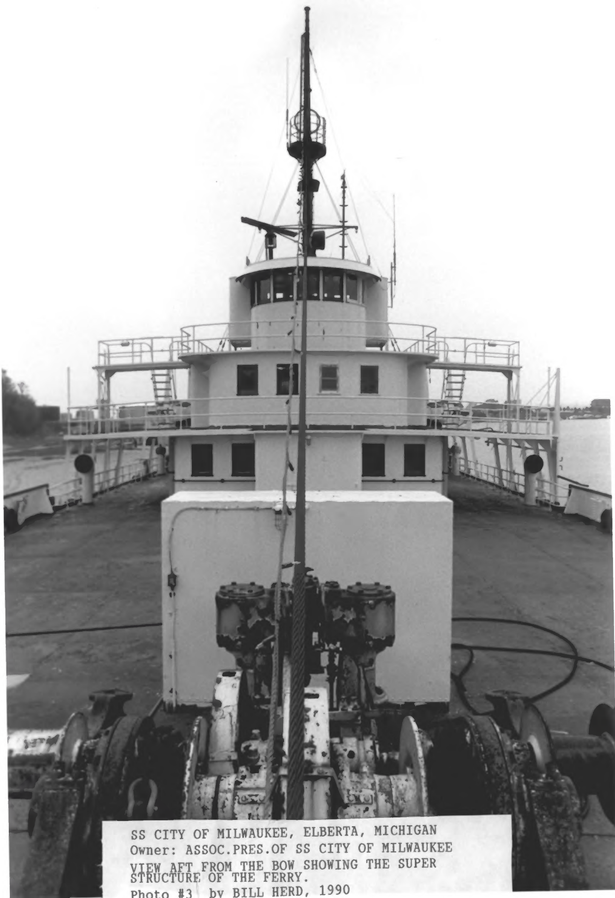
SS CITY OF MILWAUKEE, ELBERTA, MICHIGAN Owner: ASSOC. PRES. OF SS CITY OF MILWAUKEE VIEW AFT FROM THE BOW SHOWING THE SUPER STRUCTURE OF THE FERRY. Photo #3 by BILL HERD, 1990 Courtesy of OWNER