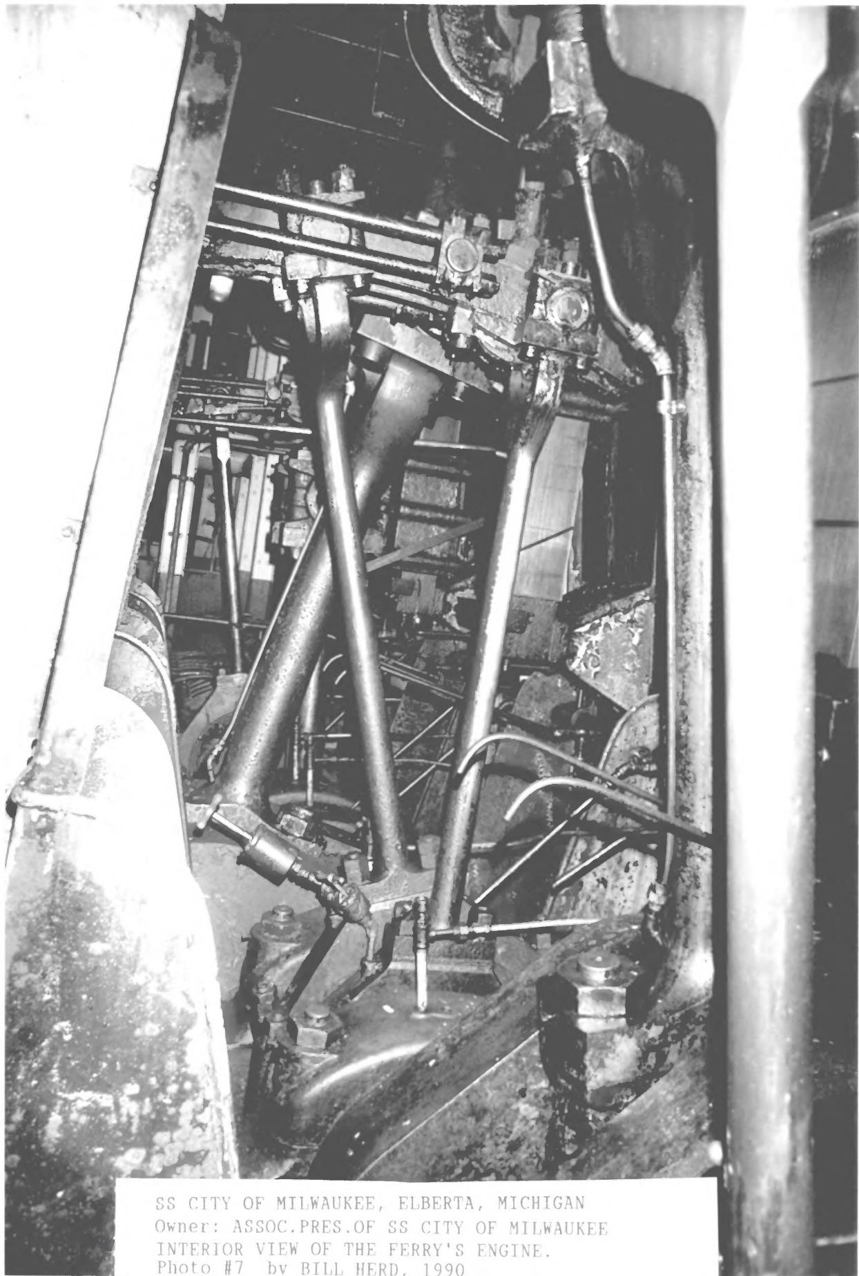
SS CITY OF MILWAUKEE, ELBERTA, MICHIGAN Owner: ASSOC.PRES.OF SS CITY OF MILWAUKEE INTERIOR VIEW OF THE FERRY'S ENGINE. Photo #7 by BILL HERD, 1990 Courtesy of OWNER