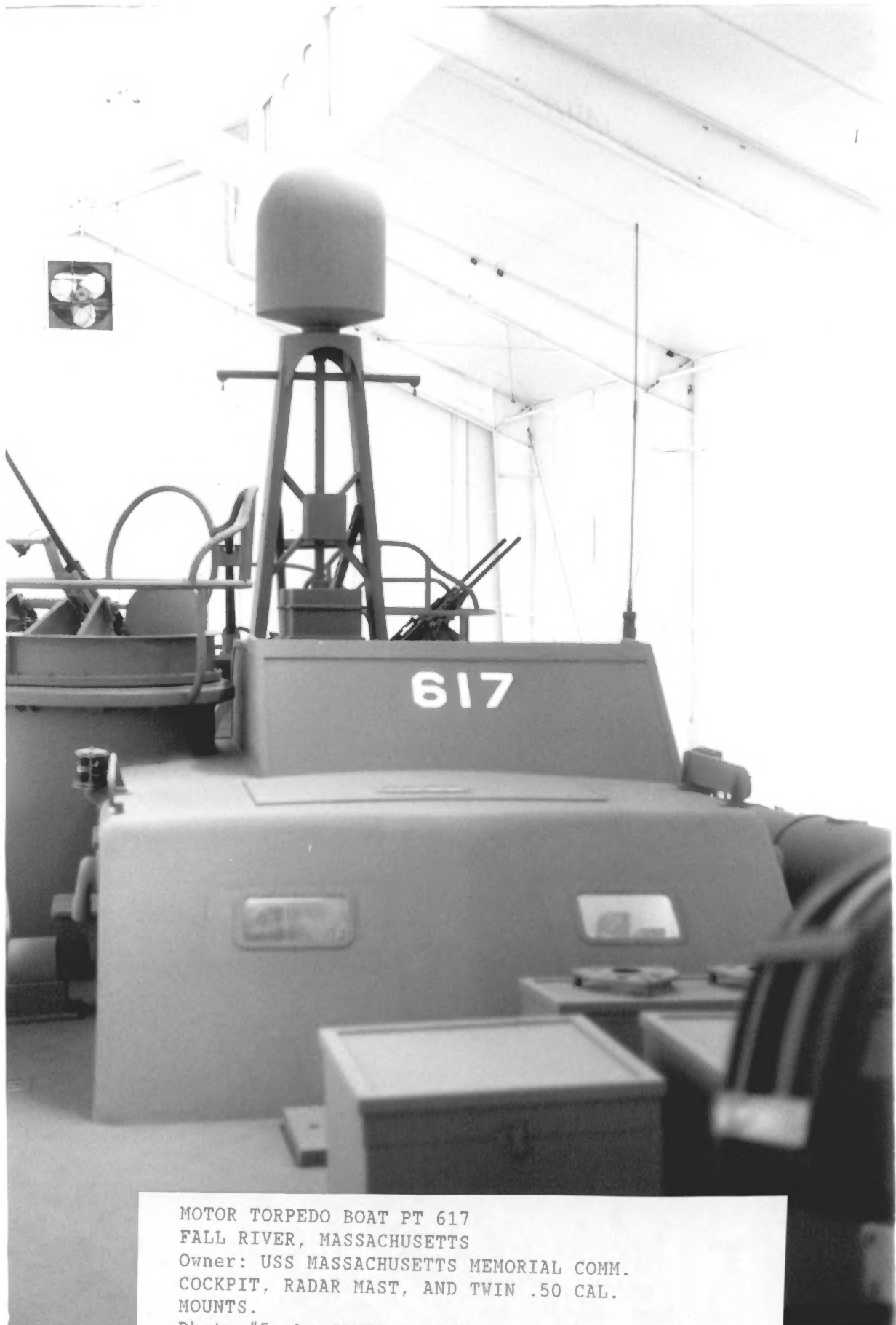
MOTOR TORPEDO BOAT PT 617 FALL RIVER, MASSACHUSETTS Owner: USS MASSACHUSETTS MEMORIAL COMM. COCKPIT, RADAR MAST, AND TWIN .50 CAL. MOUNTS. Photo #5 by JAMES P. DELGADO, 1989 Courtesy of: NATIONAL PARK SERVICE