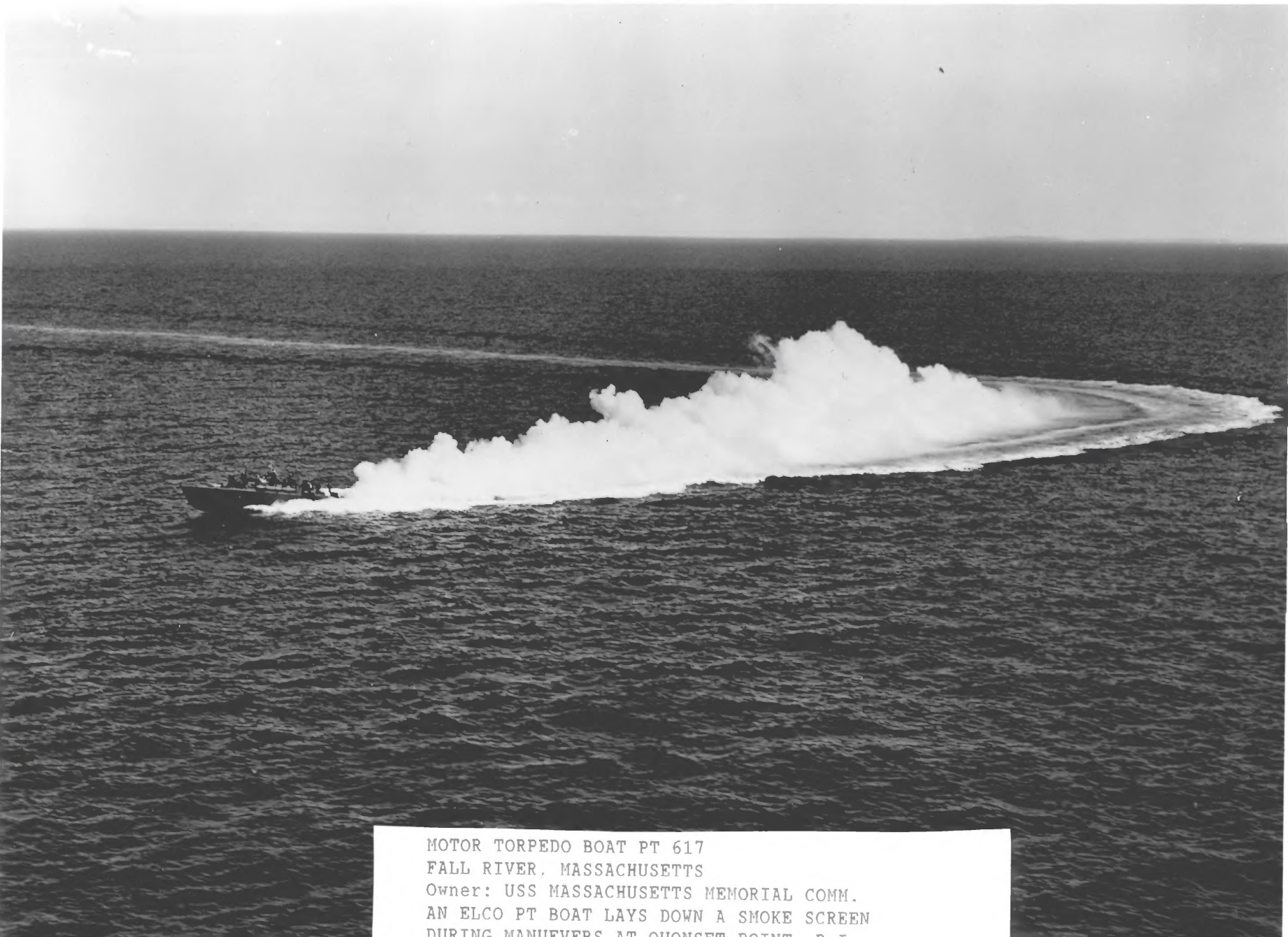
MOTOR TORPEDO BOAT PT 617 FALL RIVER, MASSACHUSETTS Owner: USS MASSACHUSETTS MEMORIAL COMM. AN ELCO PT BOAT LAYS DOWN A SMOKE SCREEN DURING MANUEVERS AT QUONSET POINT, R.I. Photo #2 by OFFICIAL US NAVY PHOTOGRAPH. 194 Courtesy of: PT BOATS, INC.