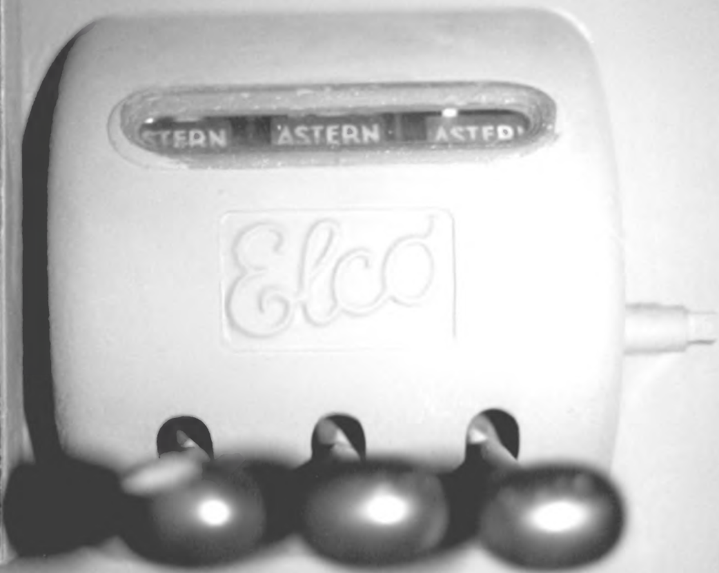
MOTOR TORPEDO BOAT PT 617 FALL RIVER, MASSACHUSETTS Owner: USS MASSACHUSETTS MEMORIAL COMM. ELCO THROTTLES IN THE COCKPIT OF PT 617. Photo #6 by JAMES P. DELGADO, 1989 Courtesy of: NATIONAL PARK SERVICE