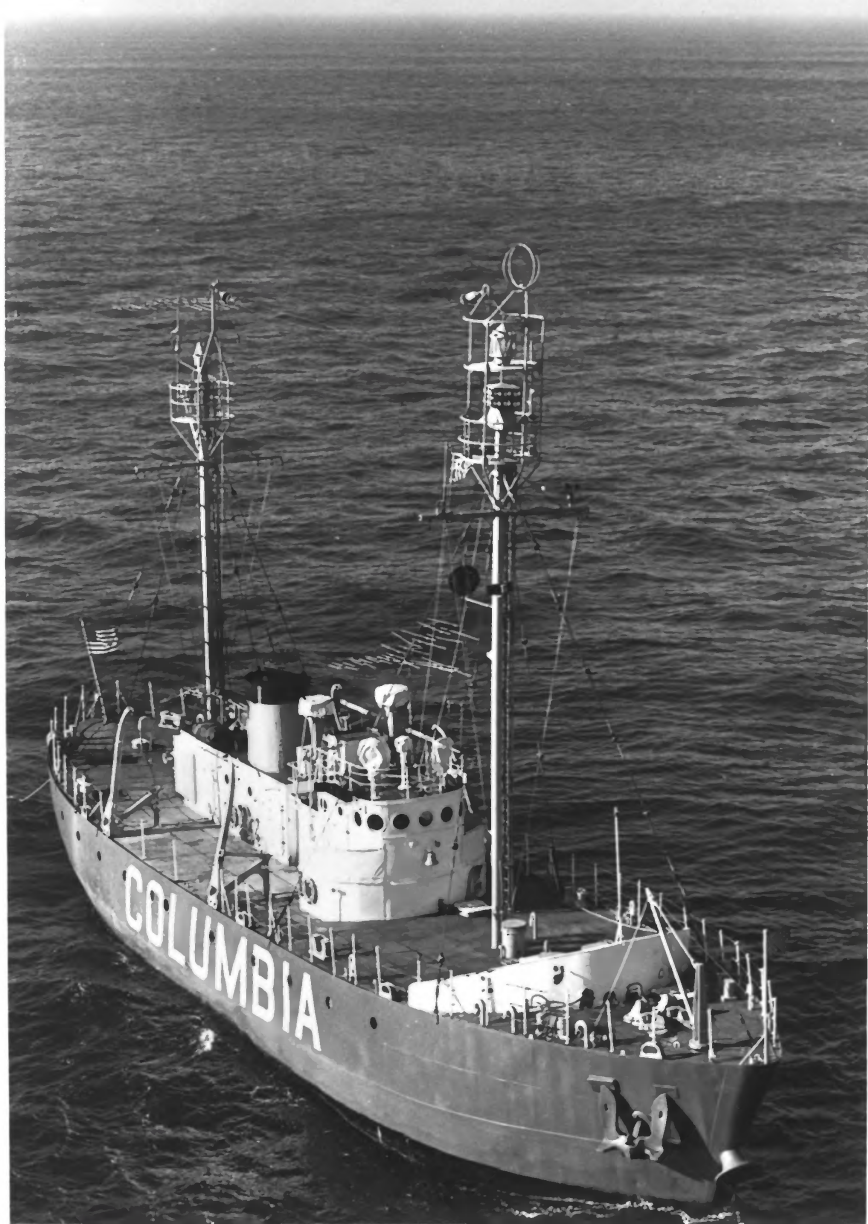
LIGHTSHIP WAL-604, COLUMBIA ASTORIA, OREGON Owner: COLUMBIA RIVER MARITIME MUSEUM LIGHTSHIP WAL-604 ON STATION OFF THE COLUMBIA RIVER BAR. Photo #1 by UNKNOWN, 1960S Courtesy of: U.S. COAST GUARD, 13TH DISTRICT