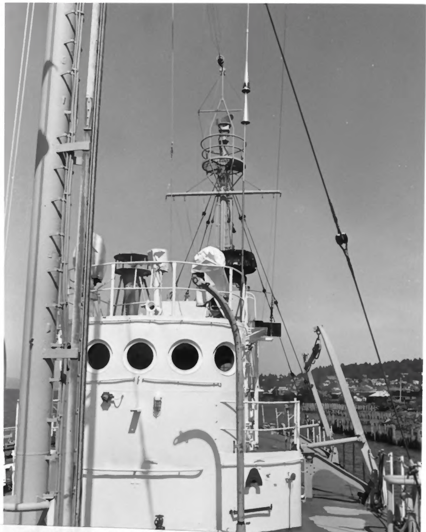
LIGHTSHIP WAL-604, COLUMBIA ASTORIA, OREGON

Owner: COLUMBIA RIVER MARITIME MUSEUM VIEW AFT FROM THE BOW; NOTE THE PILOT- HOUSE AND F2T FOG SIGNAL.