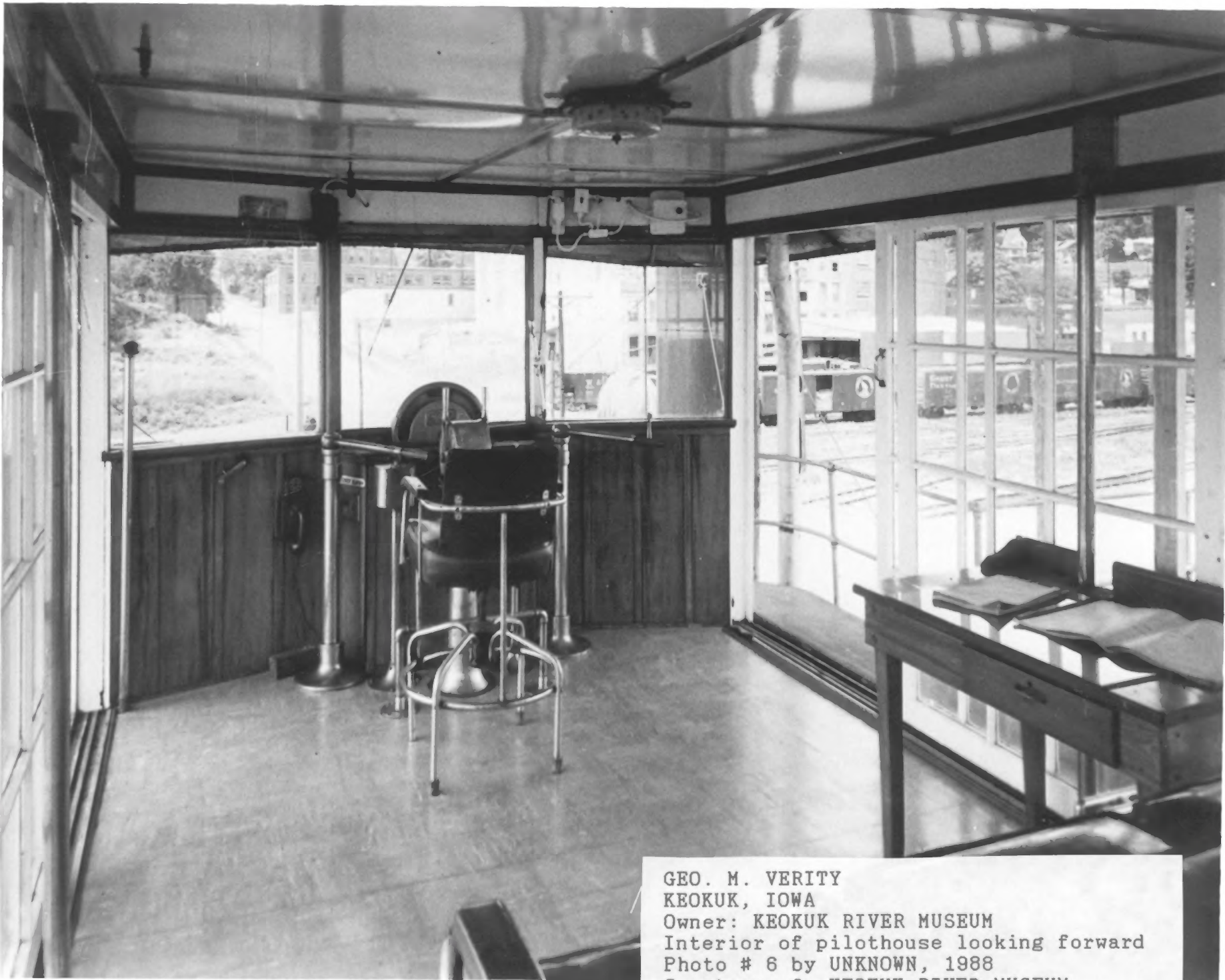
GEO. M. VERITY KEOKUK, IOWA Owner: KEOKUK RIVER MUSEUM Interior of pilothouse looking forward Photo # 6 by UNKNOWN, 1988 Courtesy of: KEOKUK RIVER MUSEUM