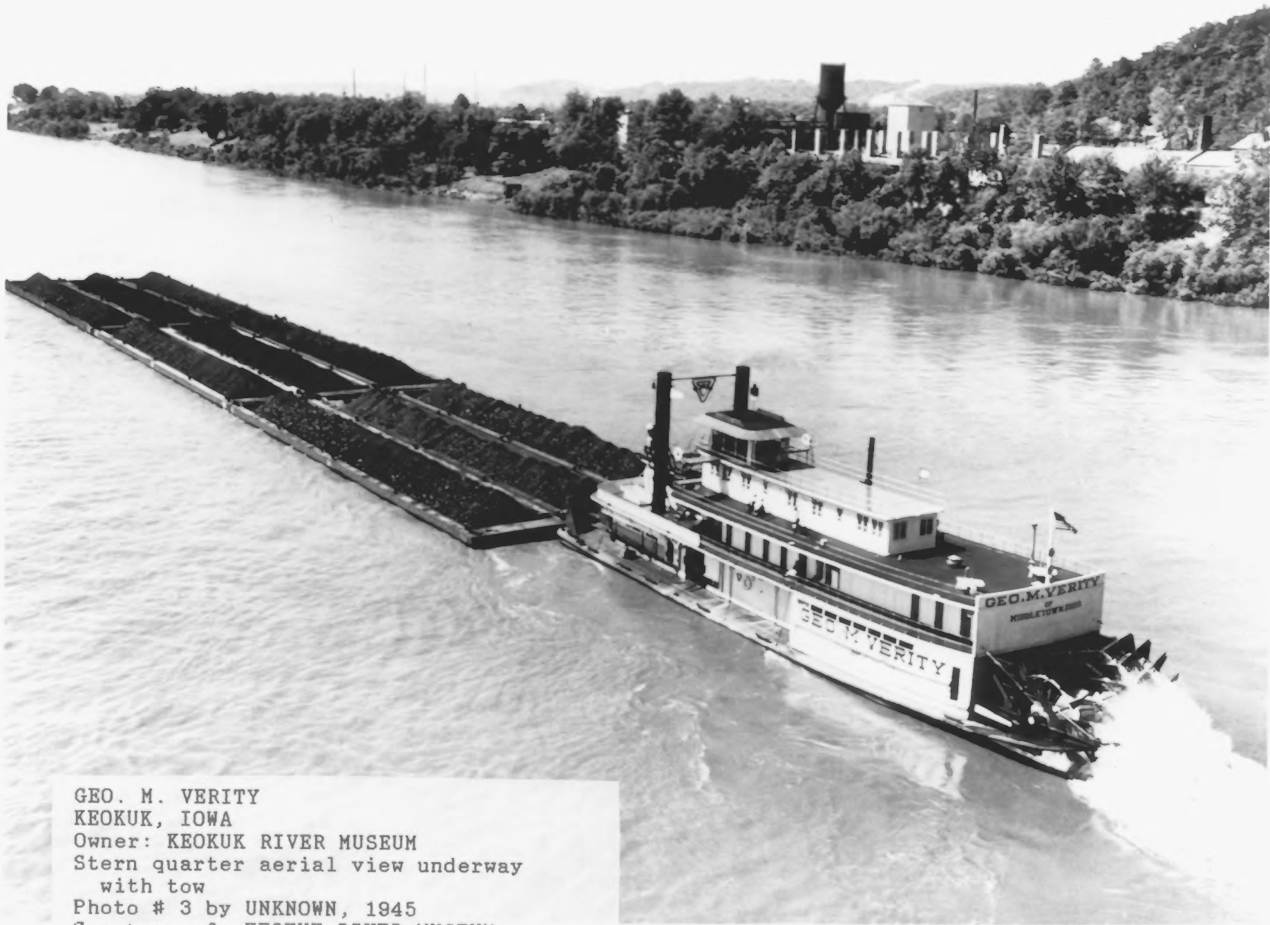
GEO. M. VERITY KEOKUK, IOWA Owner: KEOKUK RIVER MUSEUM Stern quarter aerial view underway with tow Photo # 3 by UNKNOWN, 1945 Courtesy of: KEOKUK RIVER MUSEUM