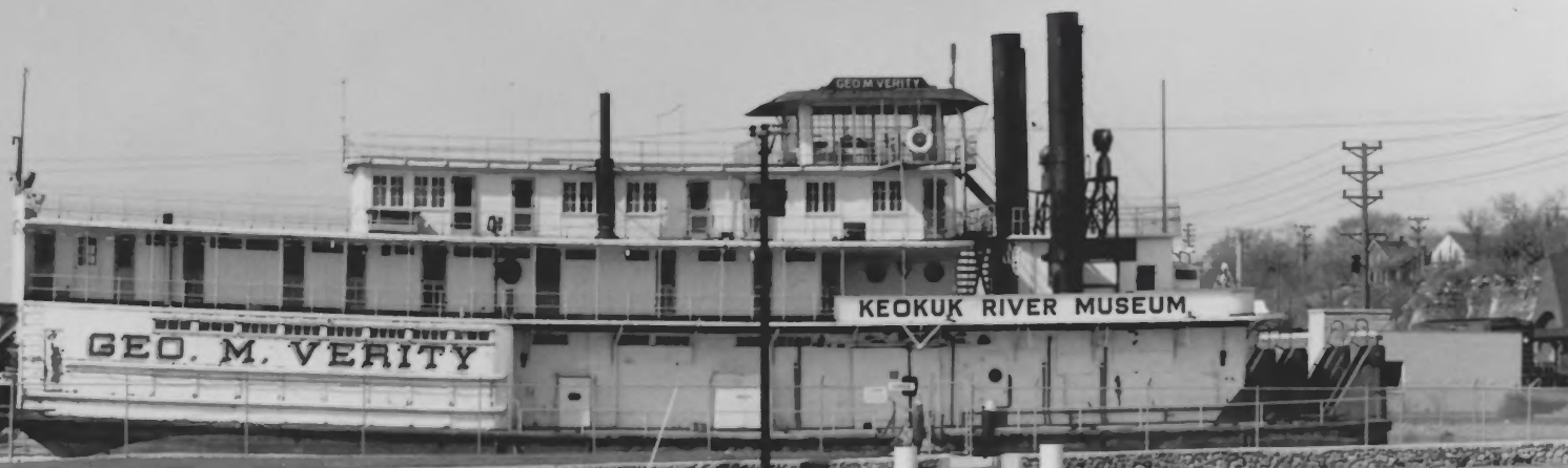
GEO. M. VERITY KEOKUK, IOWA Owner: KEOKUK RIVER MUSEUM Broadside view, in dry berth Photo # 4 by UNKNOWN, 1988 Courtesy of: KEOKUK RIVER MUSEUM