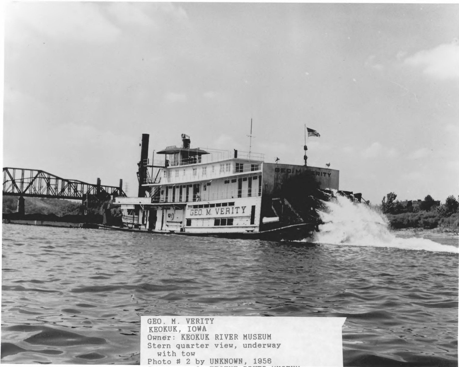
GEO. M. VERITY KEOKUK, IOWA Owner: KEOKUK RIVER MUSEUM Stern quarter view, underway with tow Photo # 2 by UNKNOWN, 1956 Courtesy of: KEOKUK RIVER MUSEUM