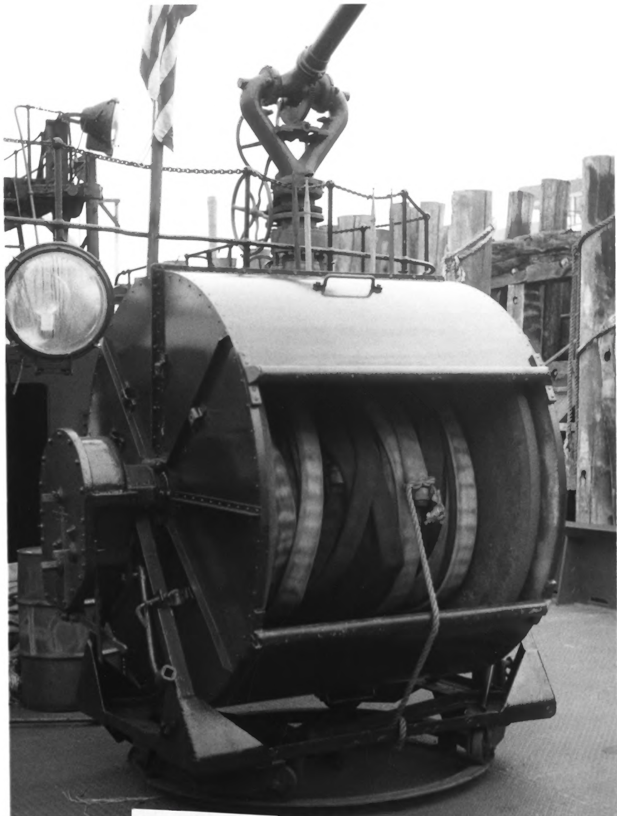
FIREBOAT FIRE FIGHTER NEW YORK, NEW YORK Owner: FIRE DEPARTMENT OF NEW YORK PROTECTED HOSE REEL MOUNTED ON BARBETTE AT FANTAIL.