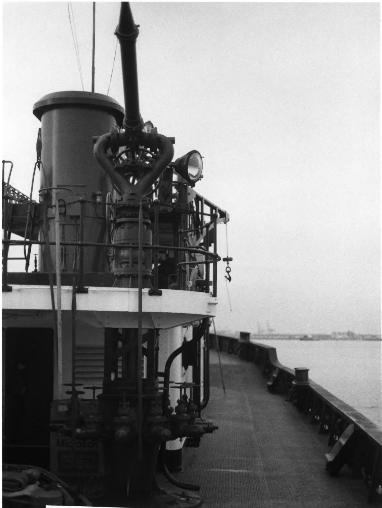
FIREBOAT FIRE FIGHTER NEW YORK, NEW YORK Owner: FIRE DEPARTMENT OF NEW YORK VIEW FORWARD, STARBOARD BEAM. NOTE THE MANIFOLD CONNECTION TO THE MONITOR. Photo #5 by JAMES P. DELGADO, 1988 Courtesy of: NATIONAL PARK SERVICE