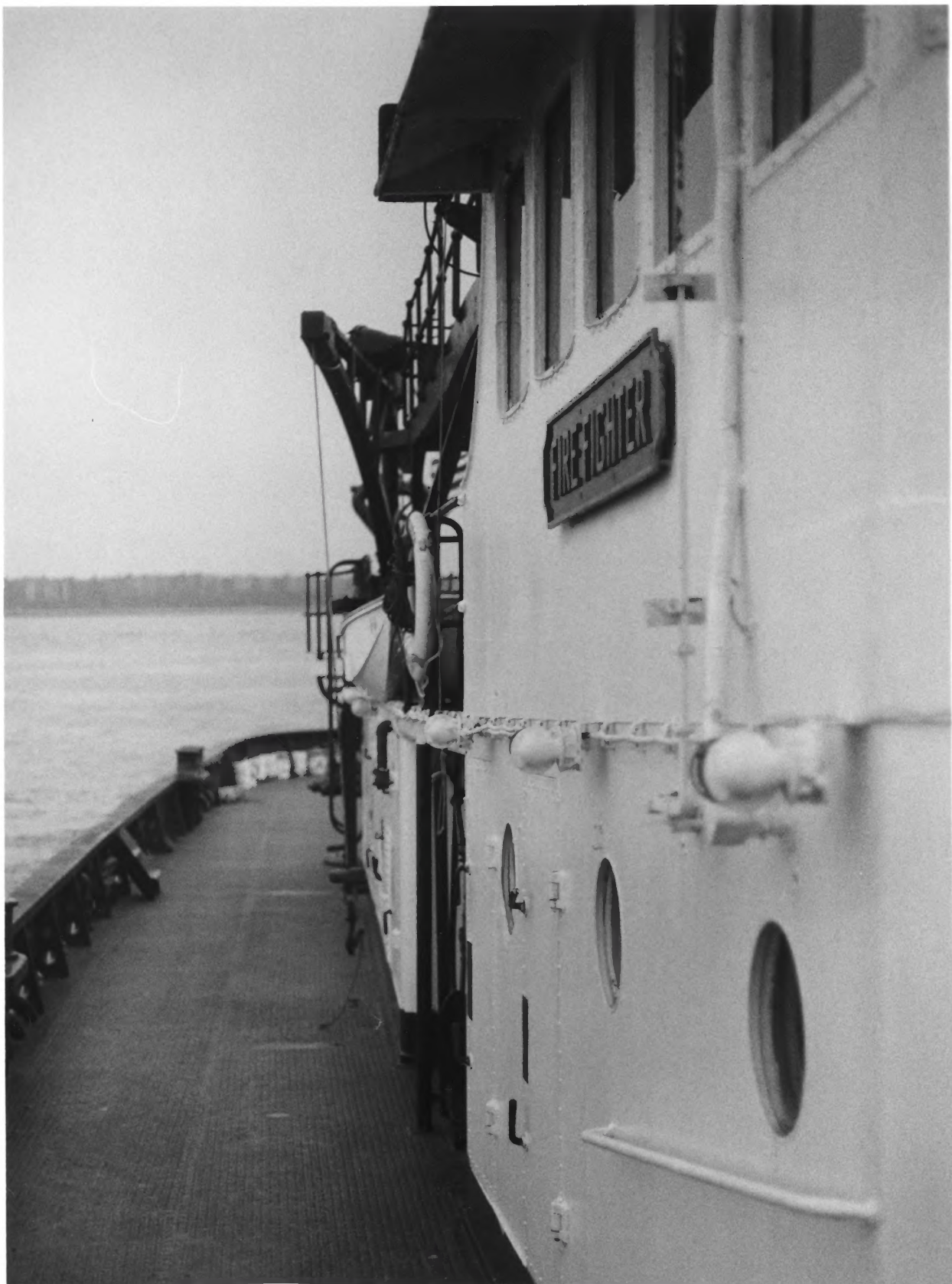
FIREBOAT FIRE FIGHTER NEW YORK, NEW YORK Owner: FIRE DEPARTMENT OF NEW YORK VIEW AFT ON MAIN DECK, STARBOARD BEAM. Photo #4 by JAMES P. DELGADO, 1988 Courtesy of: NATIONAL PARK SERVICE