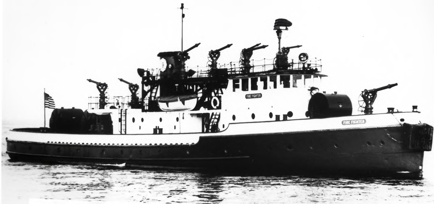
FIREBOAT FIRE FIGHTER NEW YORK, NEW YORK Owner: FIRE DEPARTMENT OF NEW YORK FIRE FIGHTER TODAY. NOTE ABSENCE OF THE TURRET TOWER. Photo #3 by JIM MURRAY, 1988 Courtesy of: PAUL DITZEL