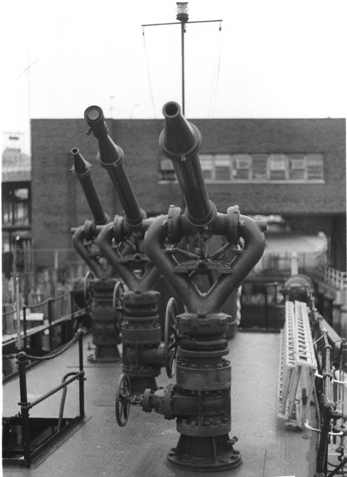
FIREBOAT FIRE FIGHTER NEW YORK, NEW YORK Owner: FIRE DEPARTMENT OF NEW YORK MONITORS ON THE PIPE DECK, LOOKING AFT. Photo #6 by JAMES P. DELGADO, 1988 Courtesy of: NATIONAL PARK SERVICE