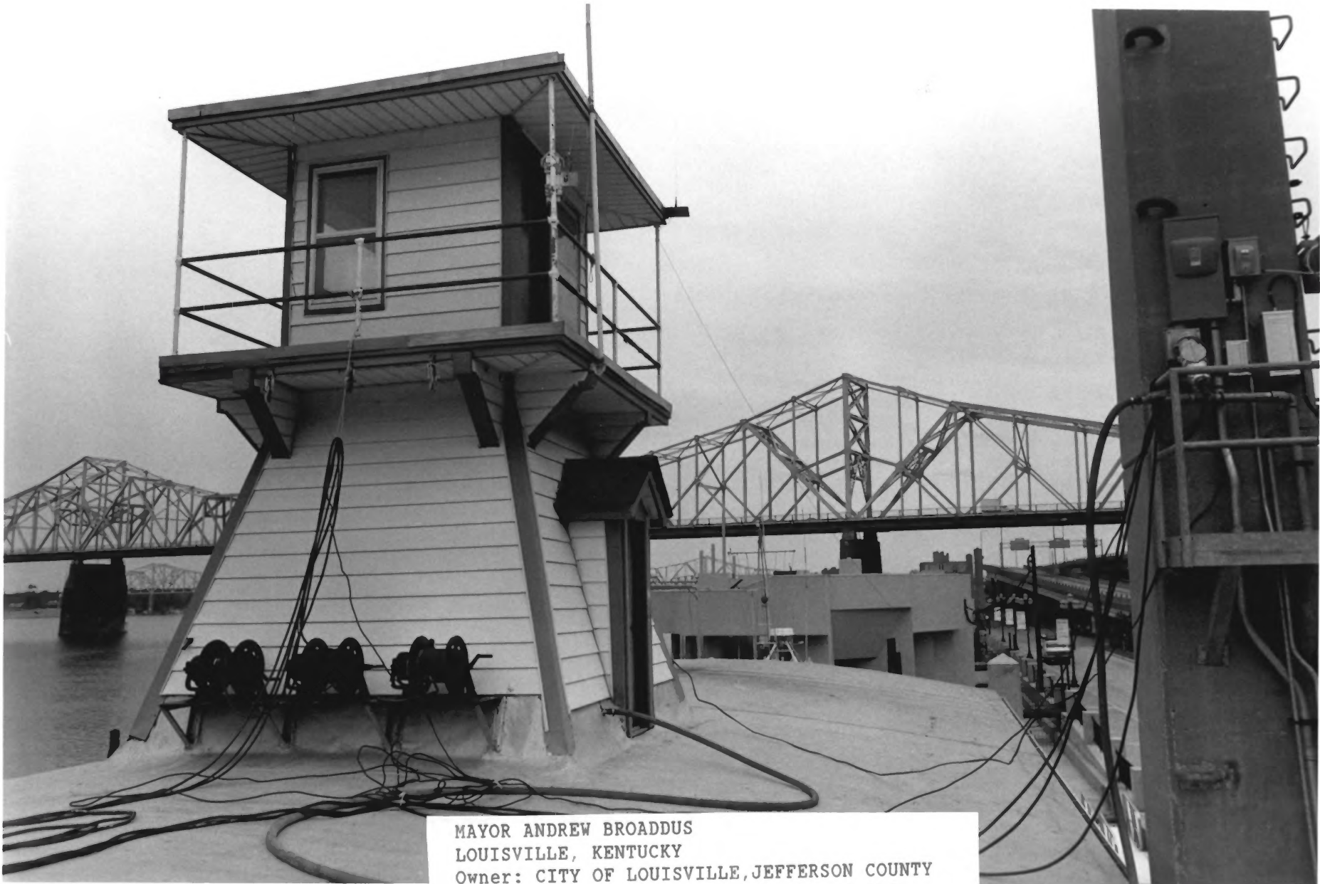
MAYOR ANDREW BROADDUS LOUISVILLE, KENTUCKY Owner: CITY OF LOUISVILLE, JEFFERSON COUNTY LOOKOUT TOWER, VIEW UPSTREAM, REELS ARE FOR SHORE POWER AND PHONE HOOKUPS Photo #7 by KEVIN J. FOSTER, SEPT. 14, 1971 Courtesy of: NATIONAL PARK SERVICE