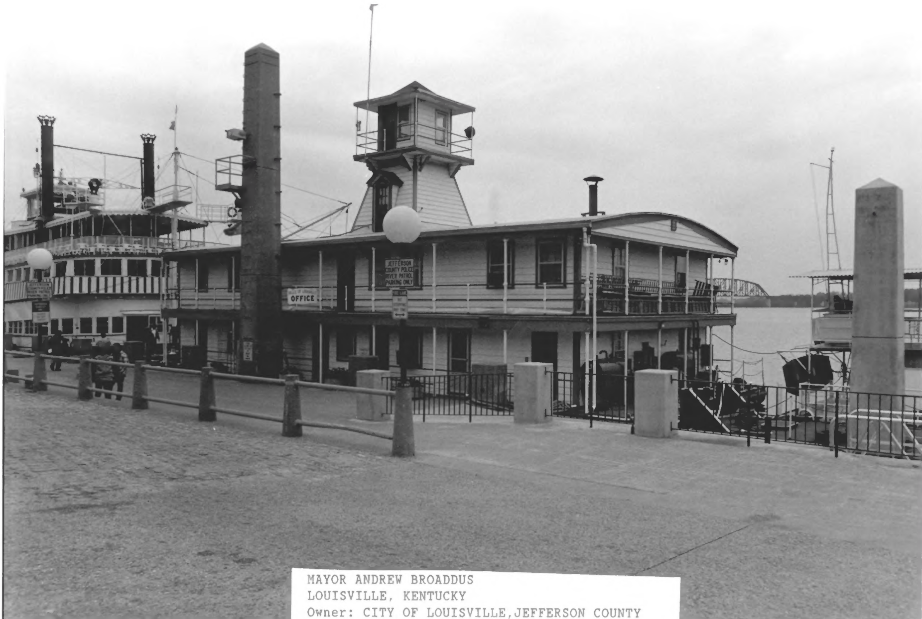
MAYOR ANDREW BROADDUS LOUISVILLE, KENTUCKY Owner: CITY OF LOUISVILLE, JEFFERSON COUNTY BOW QUARTER VIEW FROM SHORE BELLE OF LOUISVILLE ASTERN Photo #5 by KEVIN J. FOSTER, SEPT. 14.1971 Courtesy of: NATIONAL PARK SERVICE