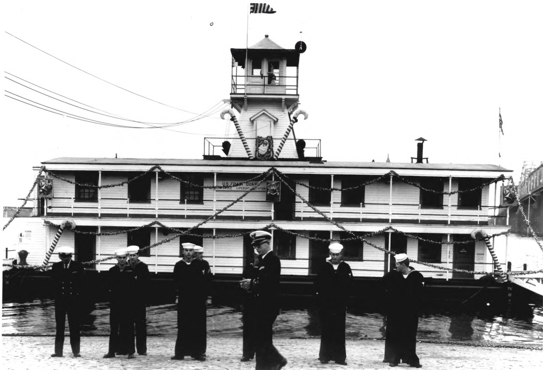
MAYOR ANDREW BROADDUS LOUISVILLE, KENTUCKY Owner: CITY OF LOUISVILLE, JEFFERSON COUNTY INSPECTION WITH HOLIDAY DECORATIONS Photo #1 by UNKNOWN, DECEMBER 7, 1941 Courtesy of: U.S. COAST GUARD HISTORY RECORDS