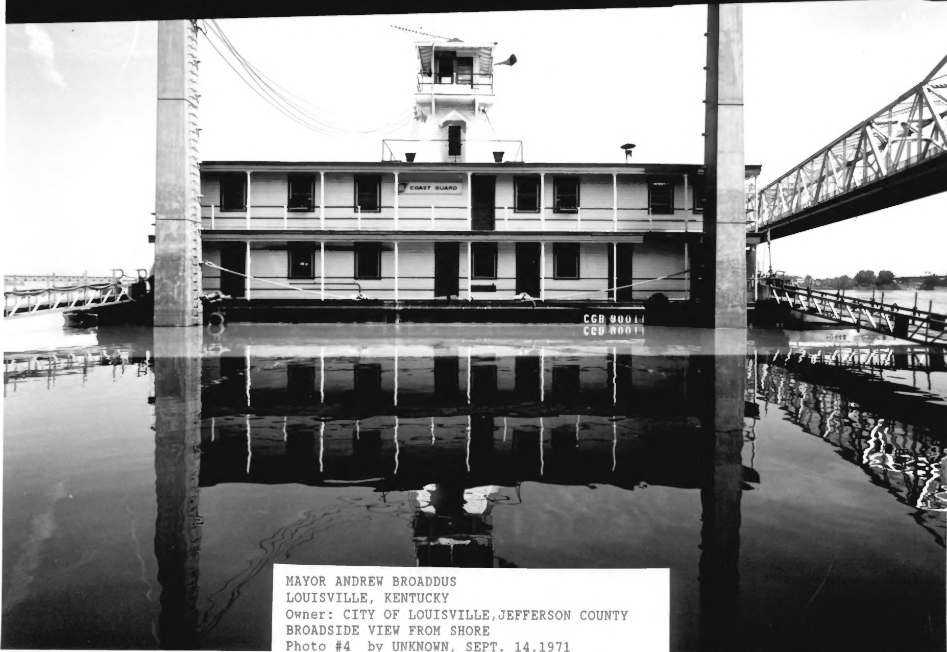
MAYOR ANDREW BROADDUS LOUISVILLE, KENTUCKY Owner: CITY OF LOUISVILLE, JEFFERSON COUNTY BROADSIDE VIEW FROM SHORE Photo #4 by UNKNOWN, SEPT. 14, 1971 Courtesy of: U.S. COAST GUARD HISTORY RECORDS