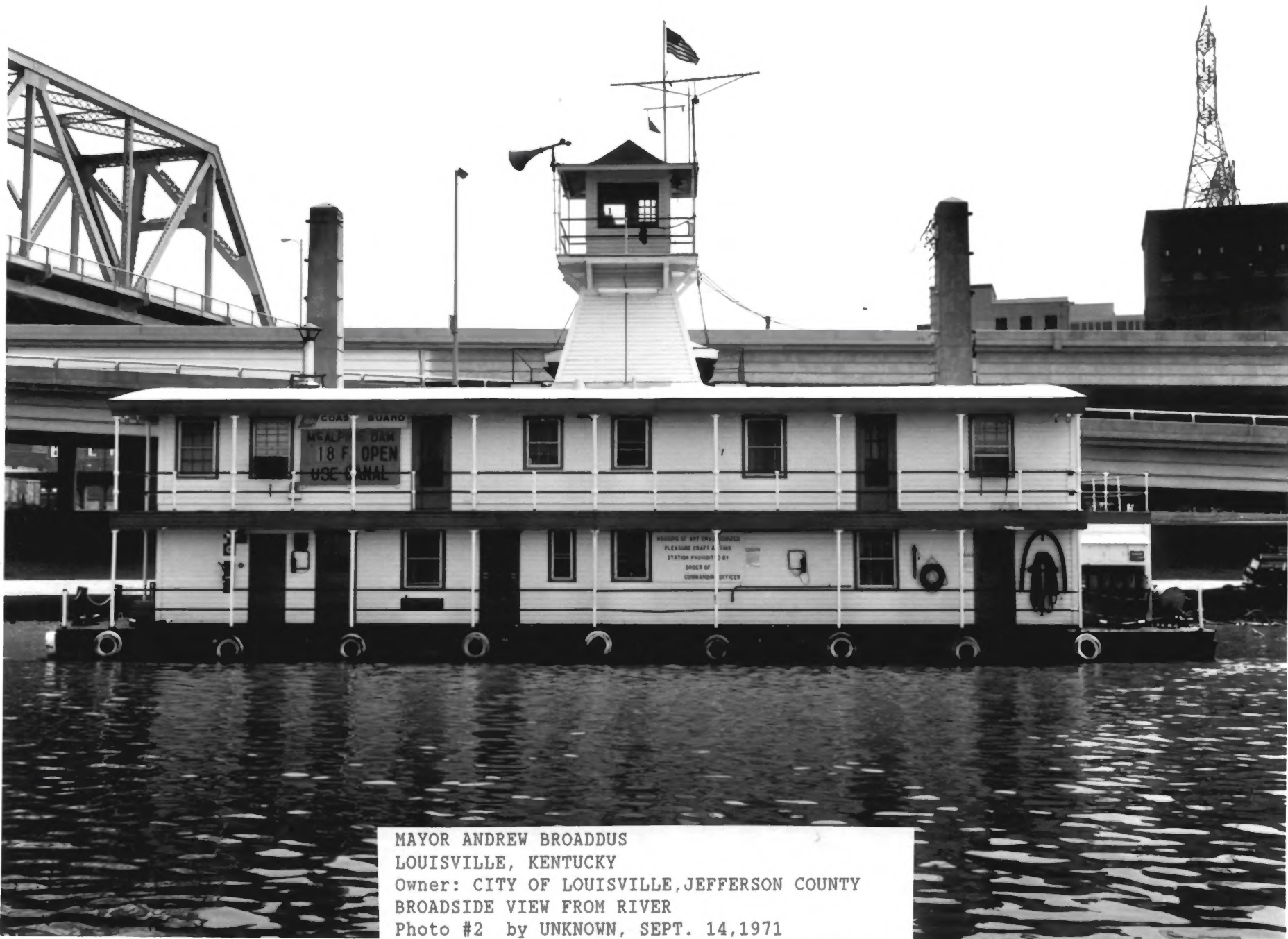
MAYOR ANDREW BROADDUS LOUISVILLE, KENTUCKY Owner: CITY OF LOUISVILLE, JEFFERSON COUNTY BROADSIDE VIEW FROM RIVER Photo #2 by UNKNOWN, SEPT. 14, 1971 Courtesy of: U.S. COAST GUARD HISTORY RECORDS