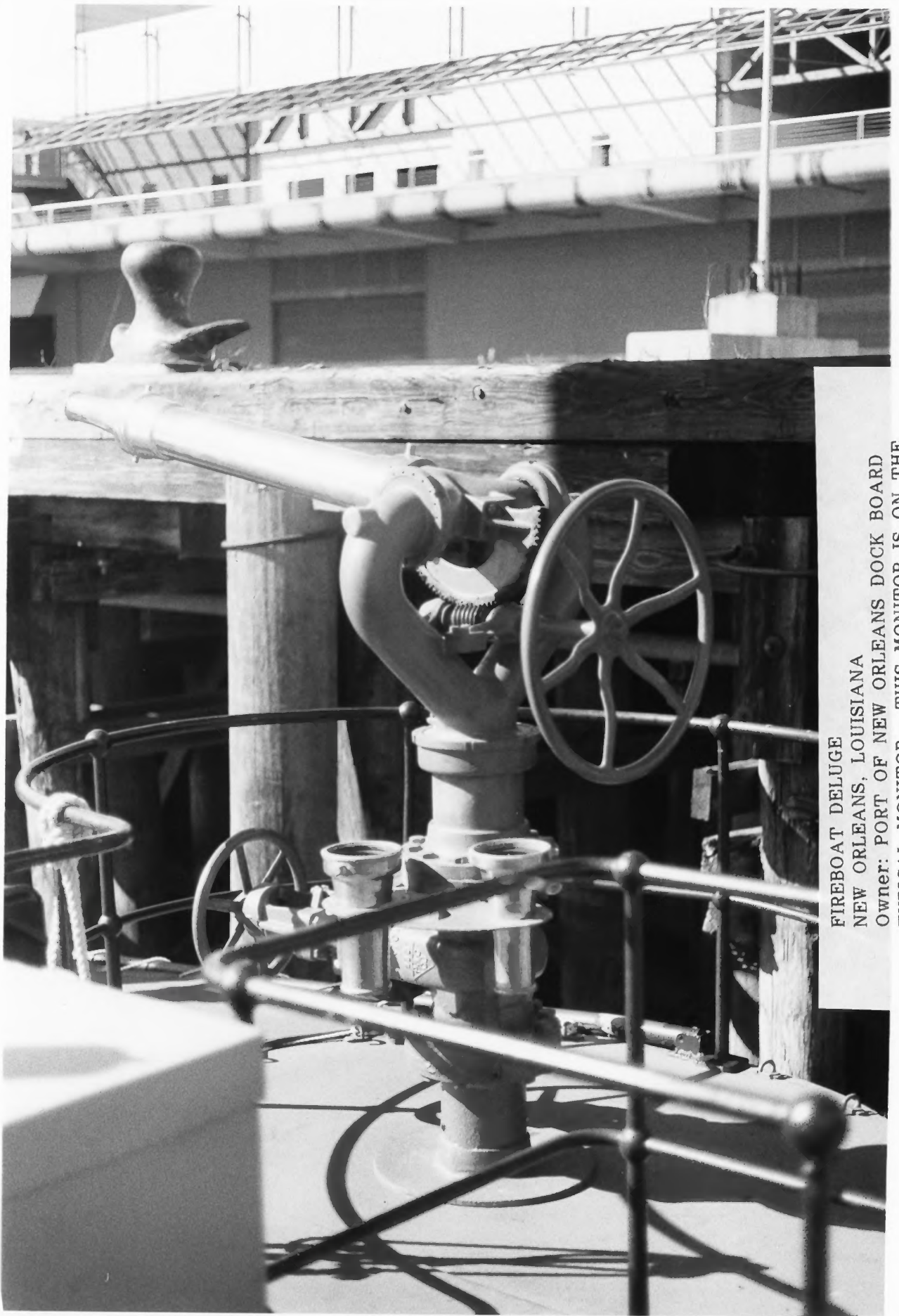
FIREBOAT DELUGE NEW ORLEANS, LOUISIANA Owner: PORT OF NEW ORLEANS DOCK BOARD TYPICAL MONITOR. THIS MONITOR IS ON THE BOAT DECK AFT ON THE PORT BEAM. Photo #5 by JAMES P. DELGADO, 1988 Courtesy of: NATIONAL PARK SERVICE