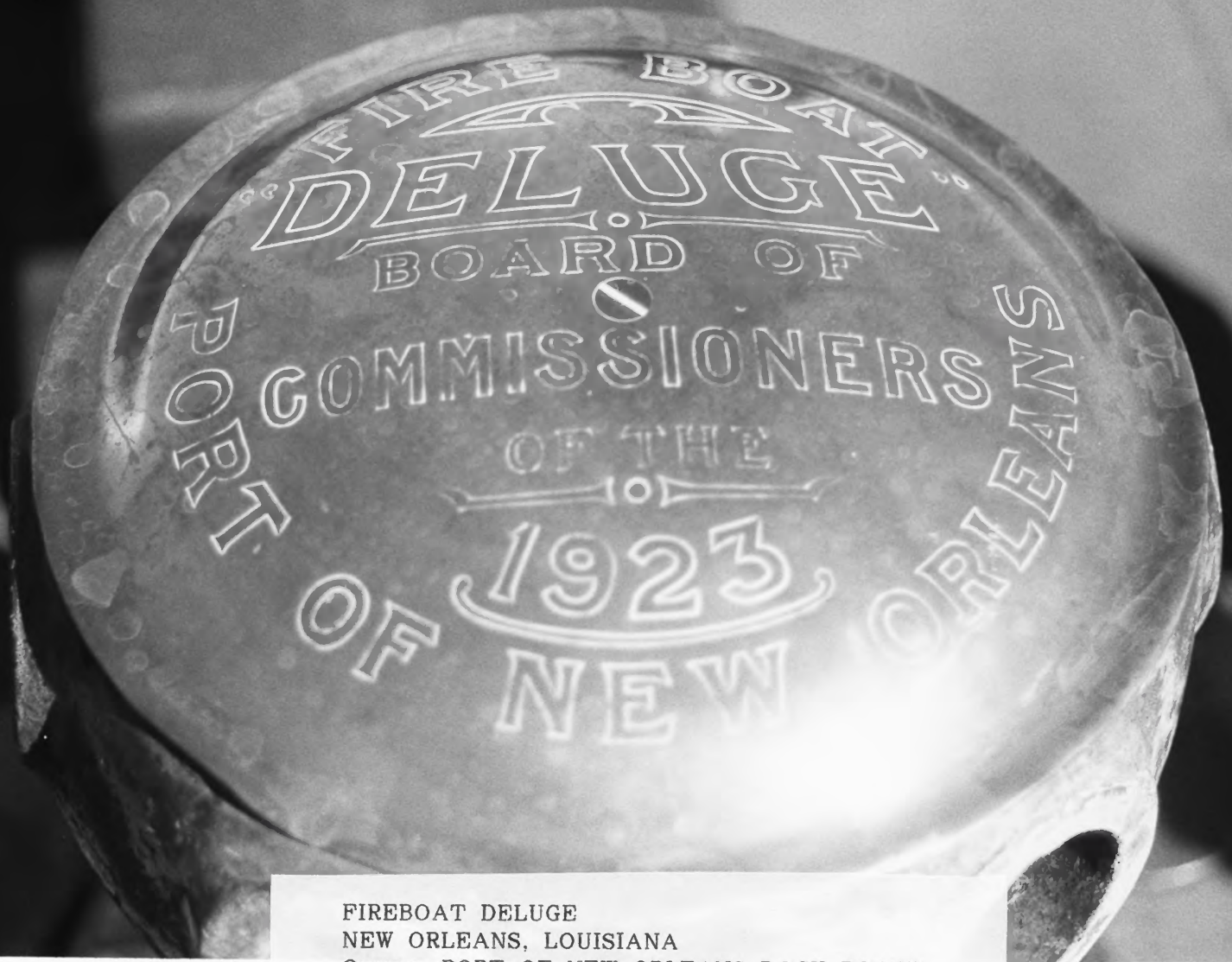
FIREBOAT DELUGE NEW ORLEANS, LOUISIANA Owner: PORT OF NEW ORLEANS DOCK BOARD CAPSTAN PLATE SHOWING INSCRIPTION. Photo #4 by JAMES P. DELGADO, 1988 Courtesy of: NATIONAL PARK SERVICE