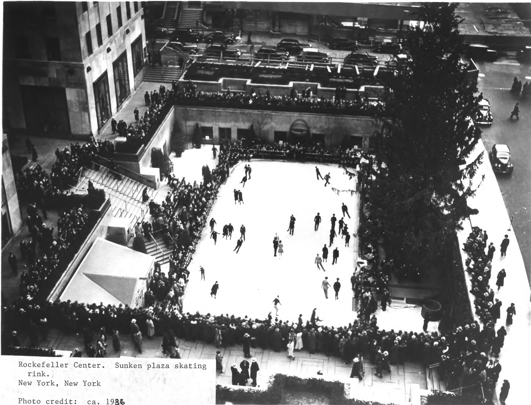
Rockefeller Center. Sunken plaza skating rink.] New York, New York