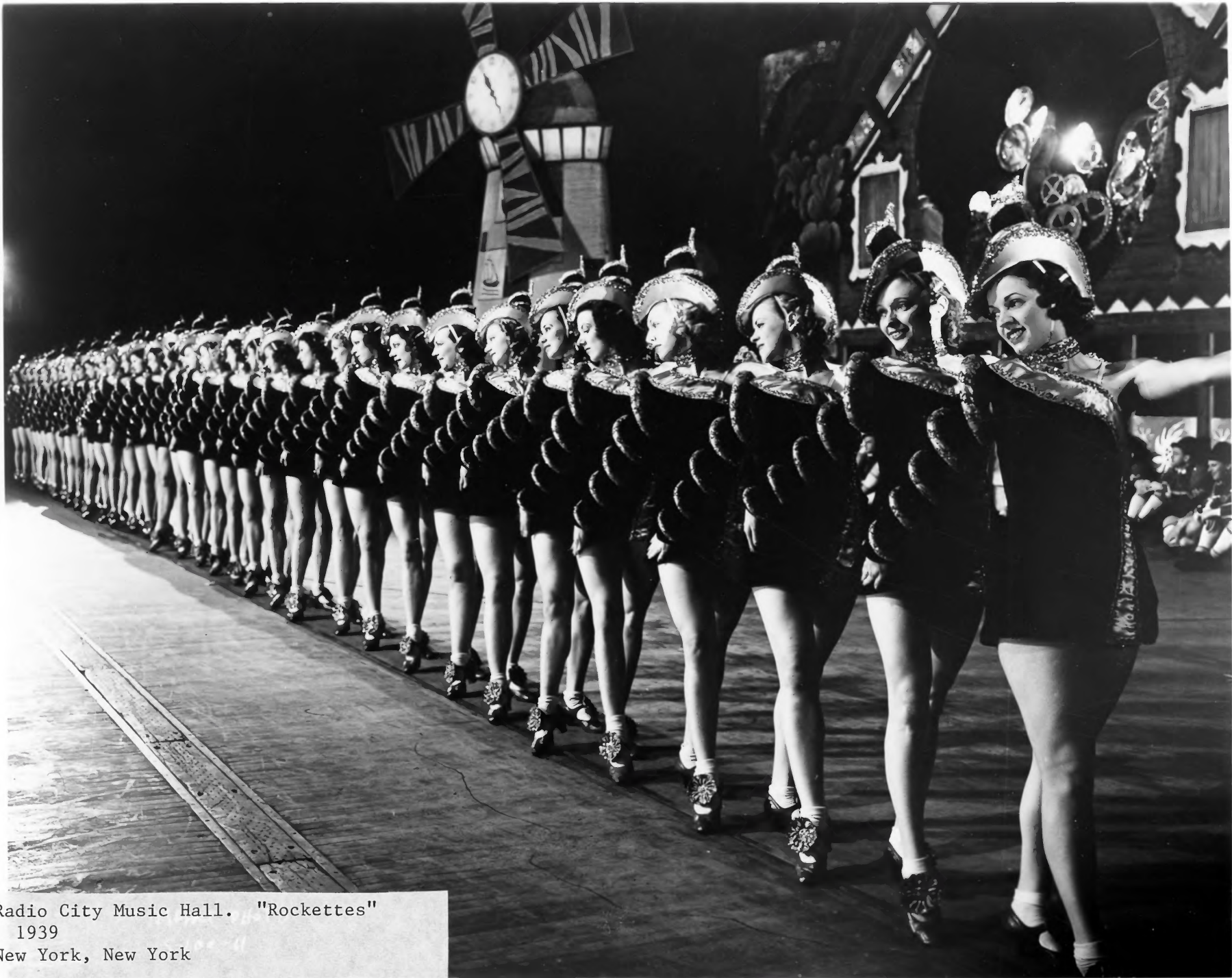
Radio City Music Hall. "Rockettes" 1939 New York, New York