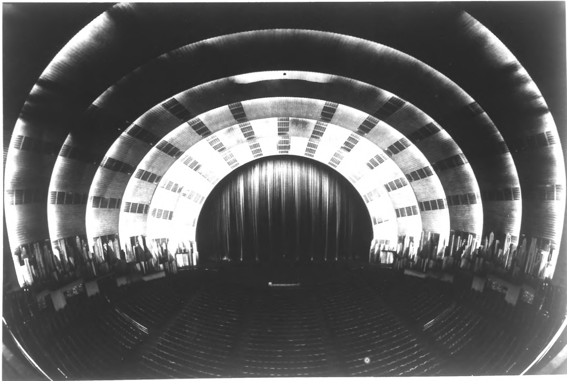
Radio City Music Hall. Interior New York, New York