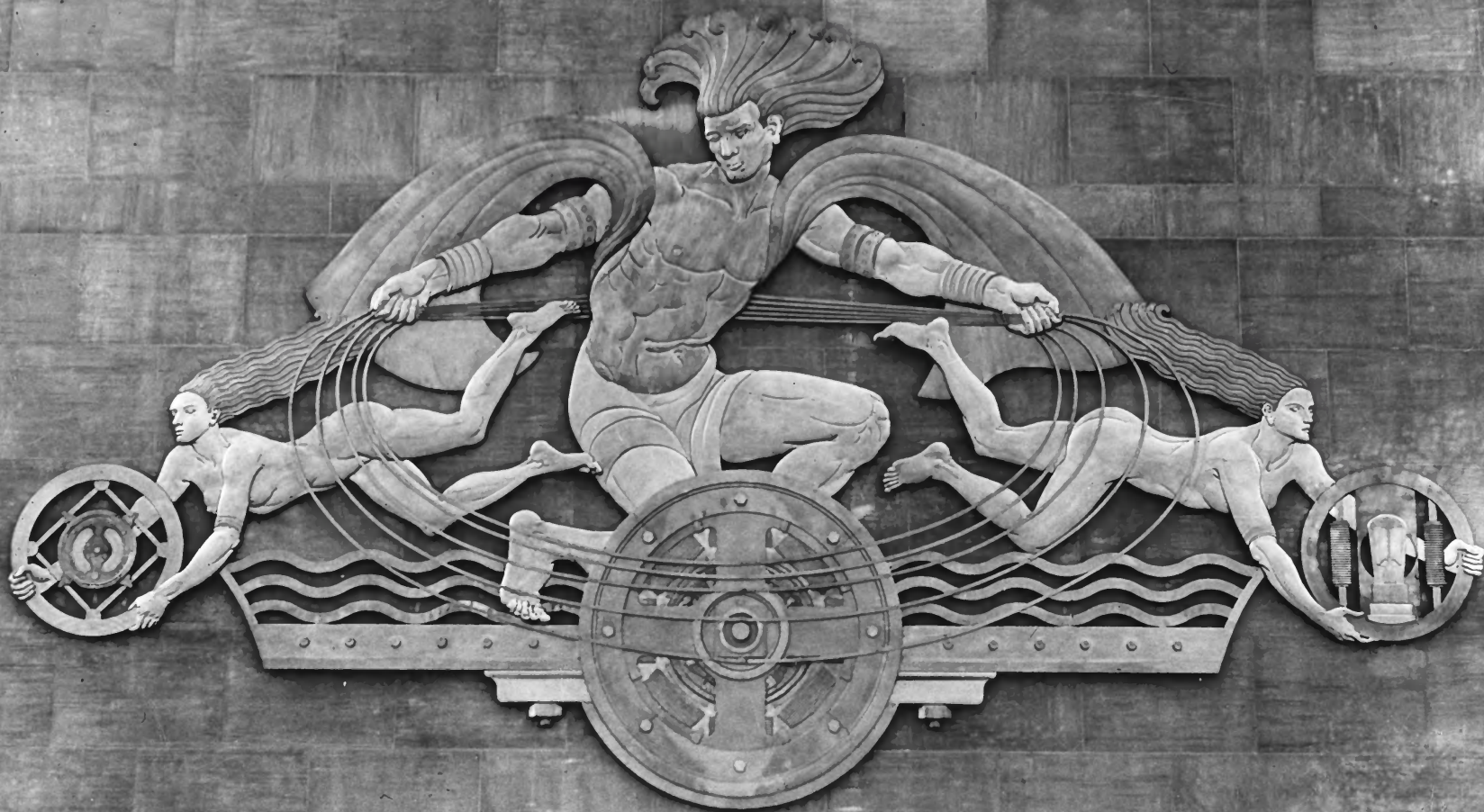
Rockefeller Center. "Spirit of Energy sending out Radio and Television." New York, New York