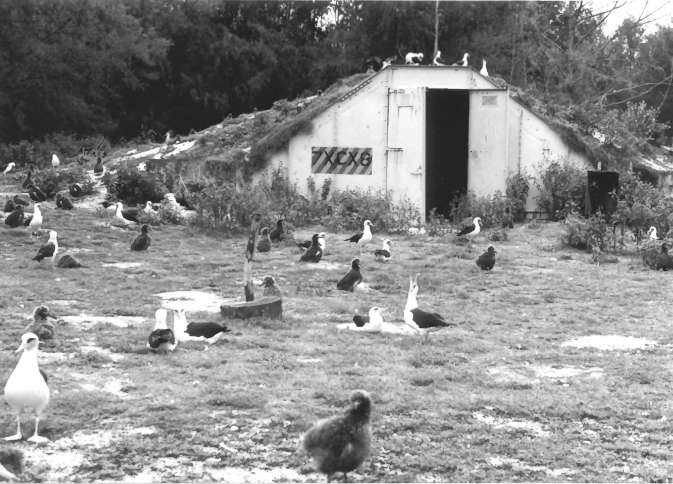
One of several surviving ammunition magazines that serviced the gun batteries during the Battle of Midway, June 1942.