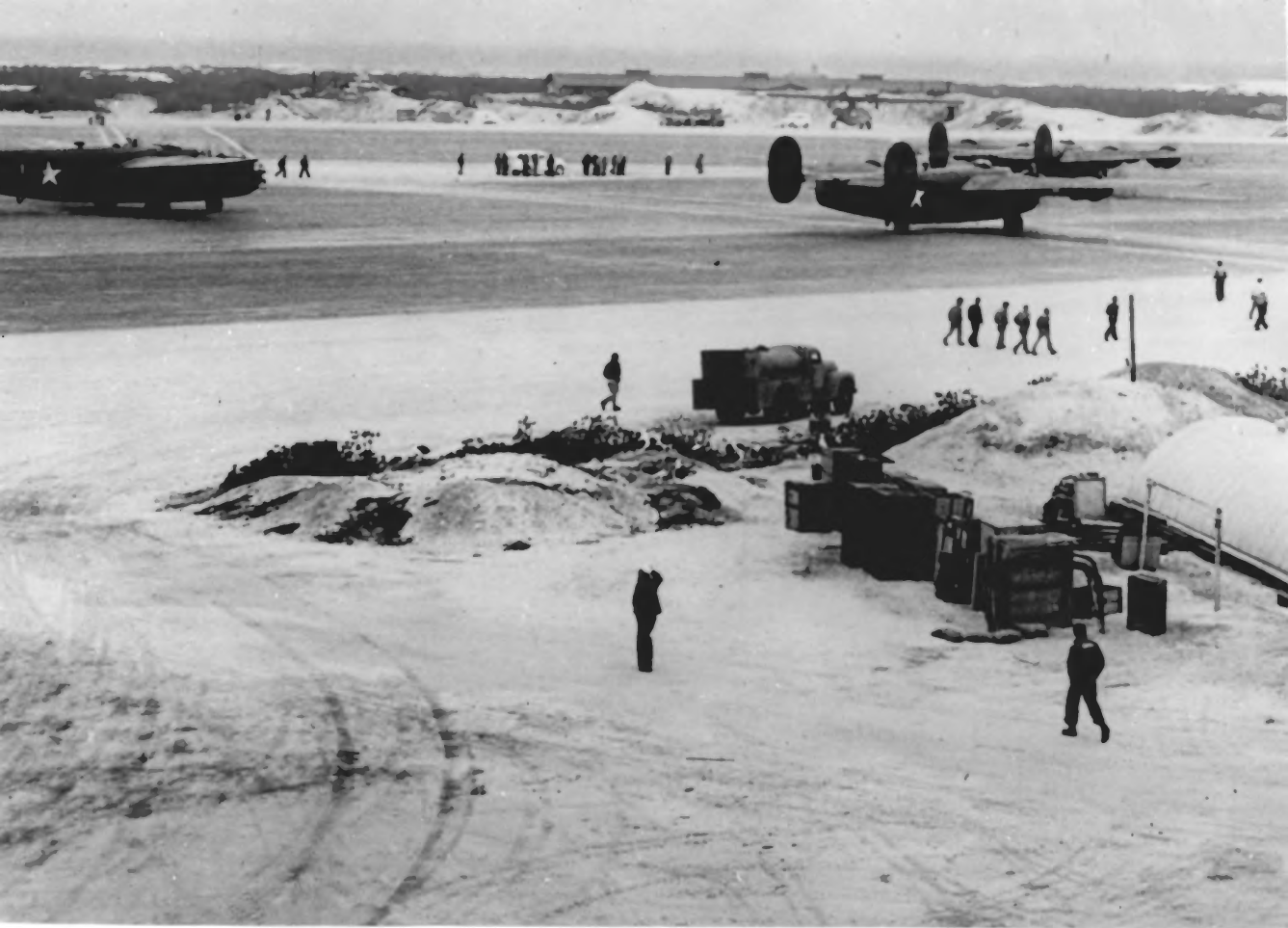
B-24 bombers on Midway preparing for a raid on Japanese-held Wake Island. December 1942.