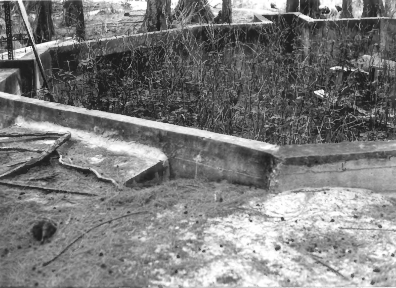
Battery D, 3-inch gun emplacement, Sand Island, Midway. This battery was installed just before the Japanese attack, June 1942. Battle of Midway.