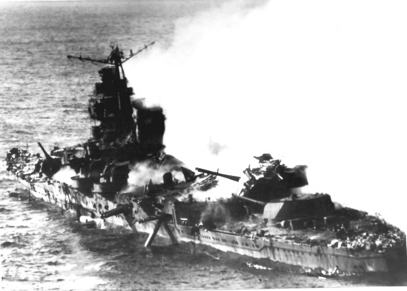
Japanese cruiser Mikuma which sank June 6, 1942, Battle of Midway. An American dive bomber crashed on the after gun turret.