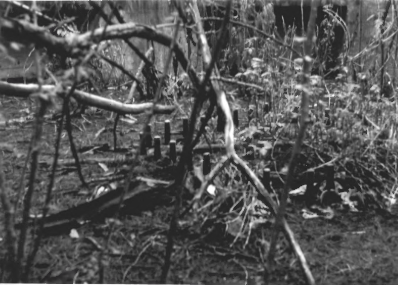
Bolts for the carriage of a 3-inch naval gun, Sand Island, Midway.