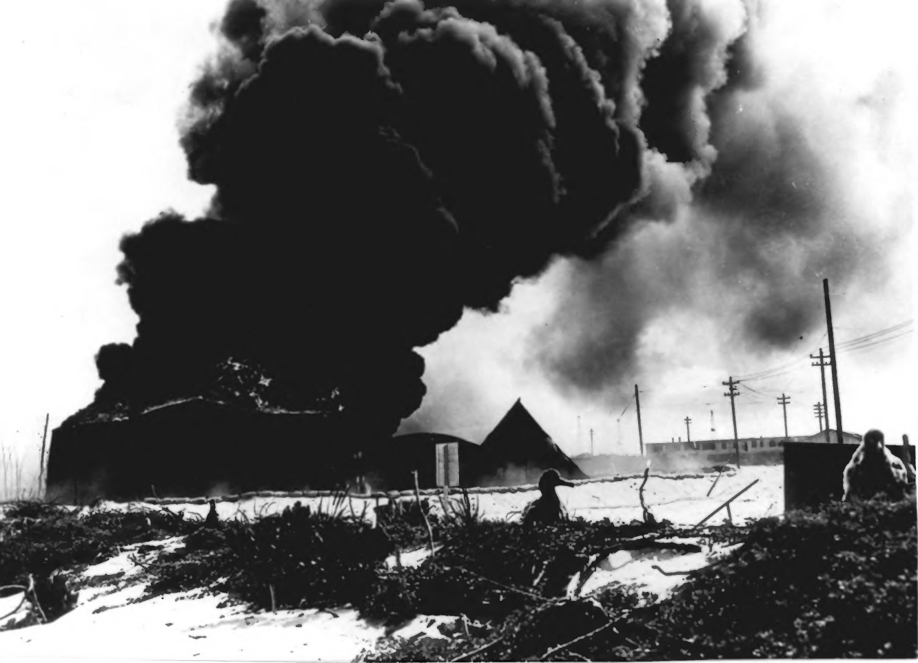
Japanese planes destroyed the seaplane hangar, Sand Island. Battle of Midway, June 1942.