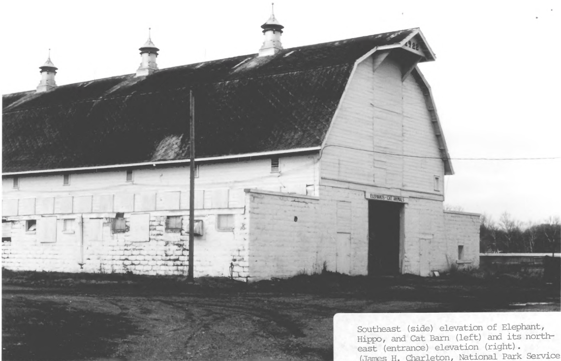
Southeast (side) elevation of Elephant, Hippo, and Cat Barn (left) and its north-east (entrance) elevation (right).