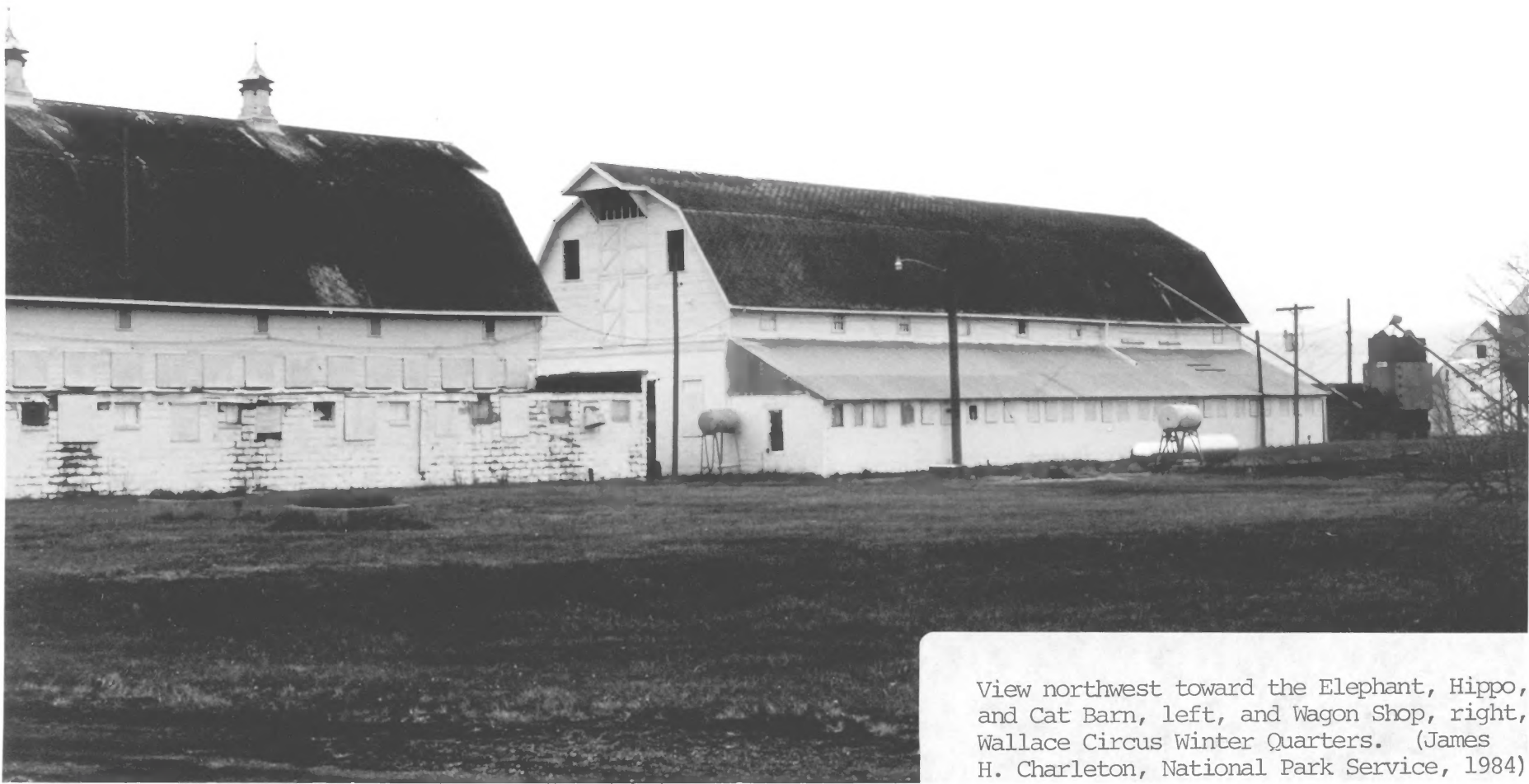
View northwest toward the Elephant, Hippo, and Cat Barn, left, and Wagon Shop, right, Wallace Circus Winter Quarters.