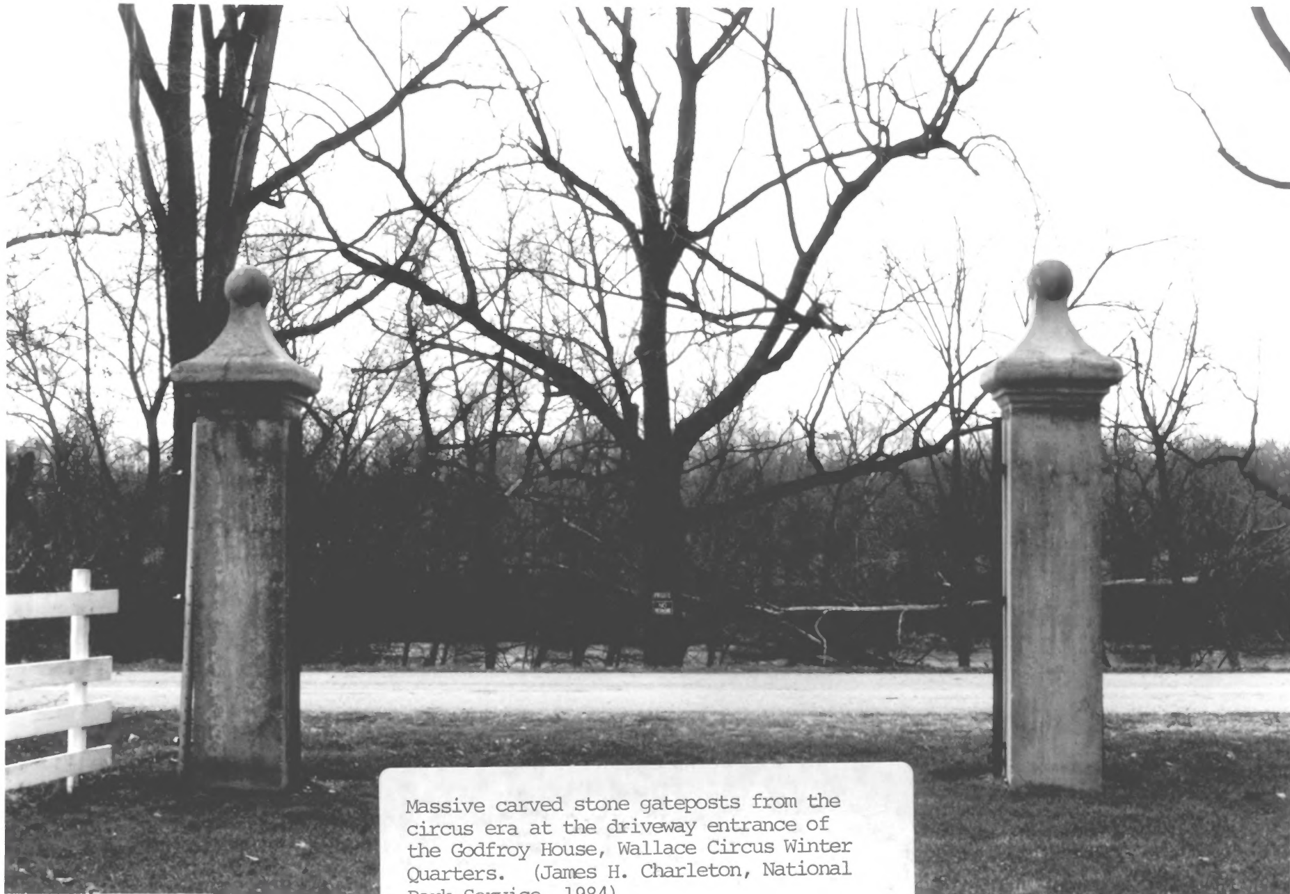
Massive carved stone gateposts from the circus era at the driveway entrance of the Godfroy House, Wallace Circus Winter Quarters.