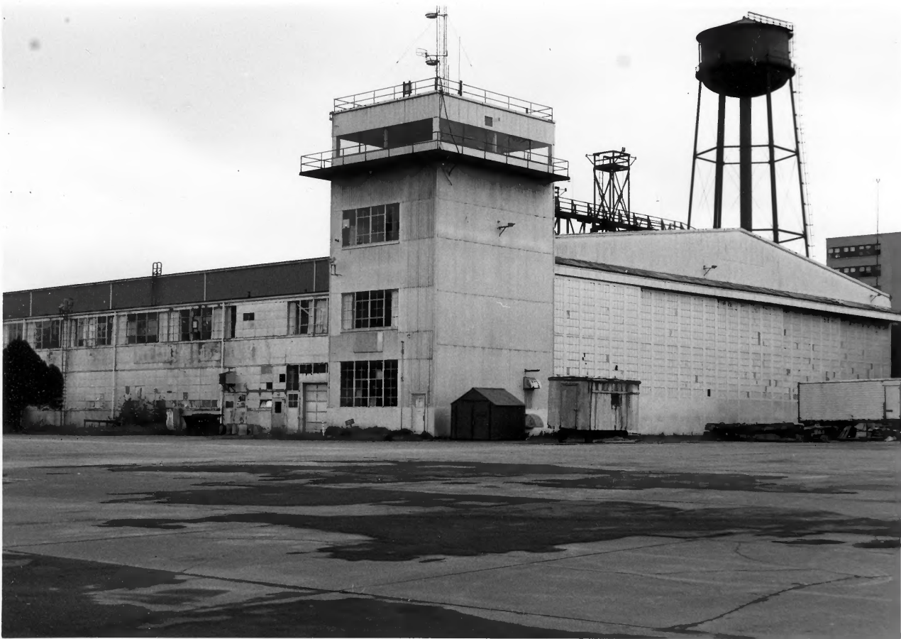
1. Sitka Naval Air Station. One of two hangars and control tower. The paved area in front was both aircraft parking and a short runway fitted out like an aircraft carrier's flight deck.