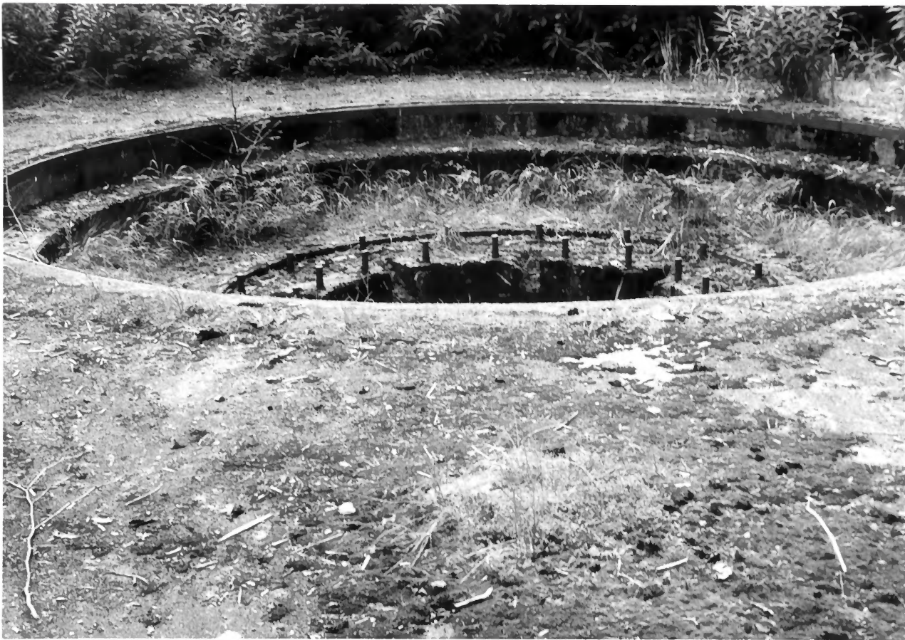
6. One of two 6-inch gun emplacements at Fort Rousseau, Makhnati Island. This was the only fixed 6-inch battery completed at Sitka.