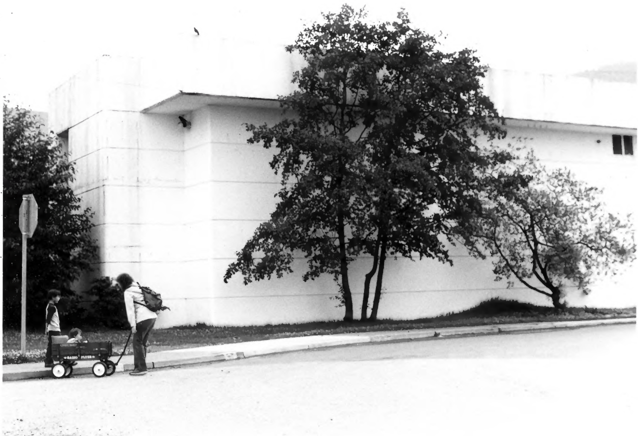
3. Sitka Naval Air Station. Bombproof power plant, similar to ones at naval bases at Kodiak and Dutch Harbor.