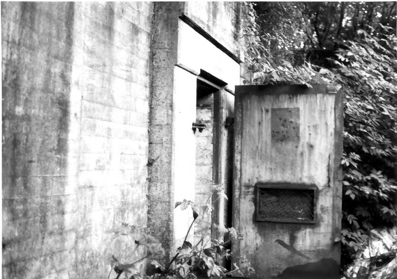
4. One of three reserve ammunition magazines on Virublennoi Island on the Causeway, Harbor Defenses, Sitka.