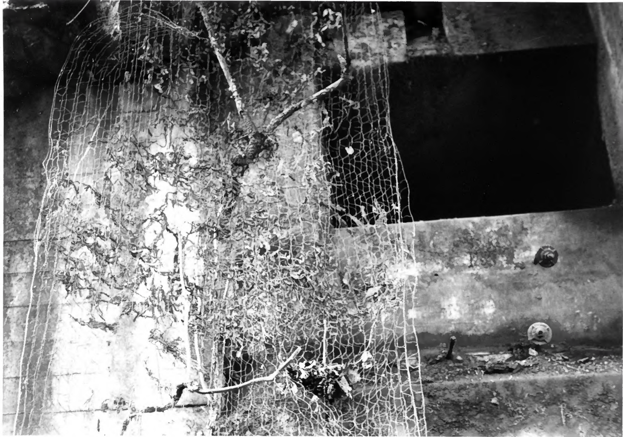
7. Second-floor opening of a large, igloo-type magazine on Makhnati Island. Note the chicken wire and fragments of burlap that camouflaged the face of the magazine.