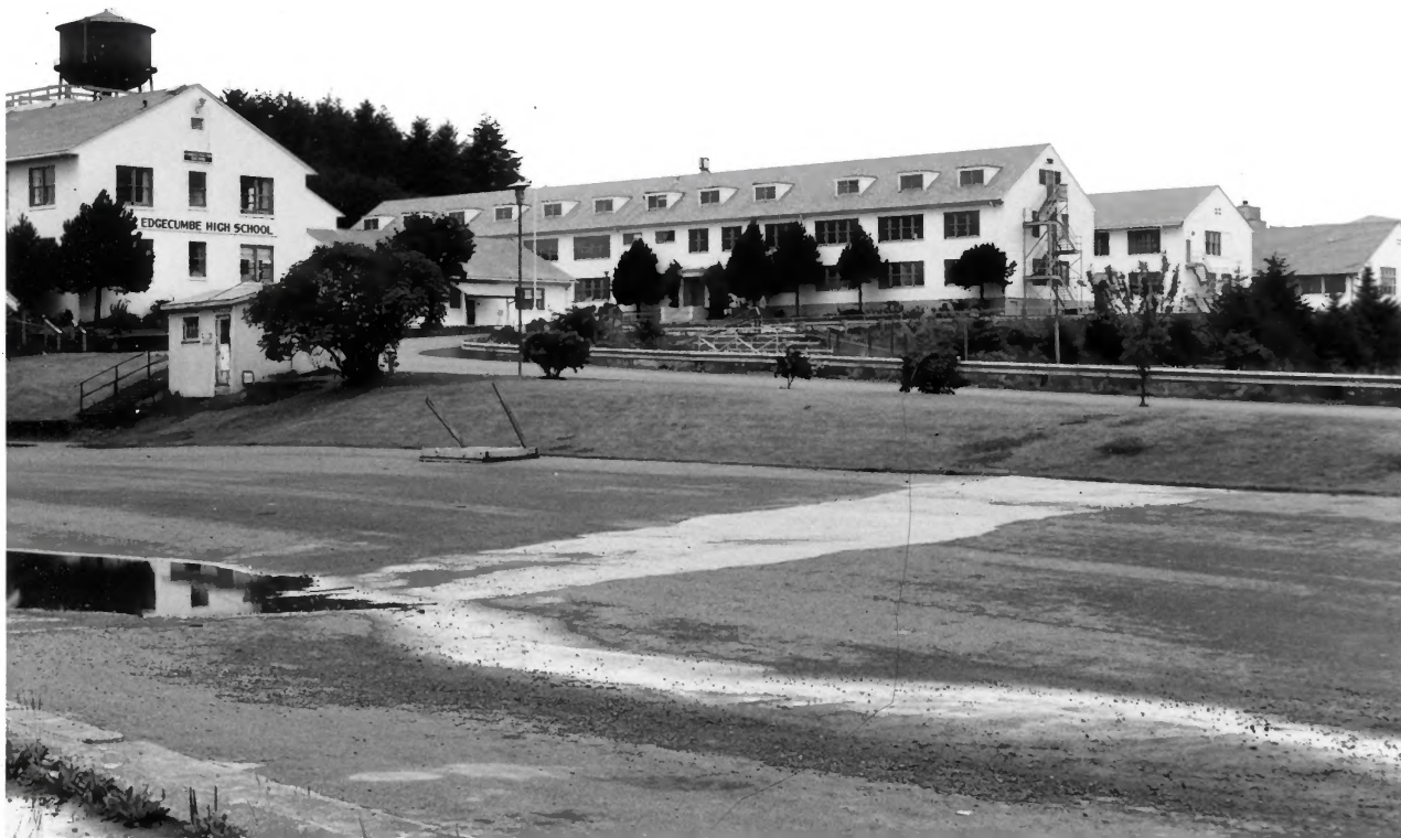
2. Sitka Naval Air Station. On left is the administration building. The building with the dormer windows and the structure behind it served as comfortable barracks. On the right a portion of the mess hall may be seen.