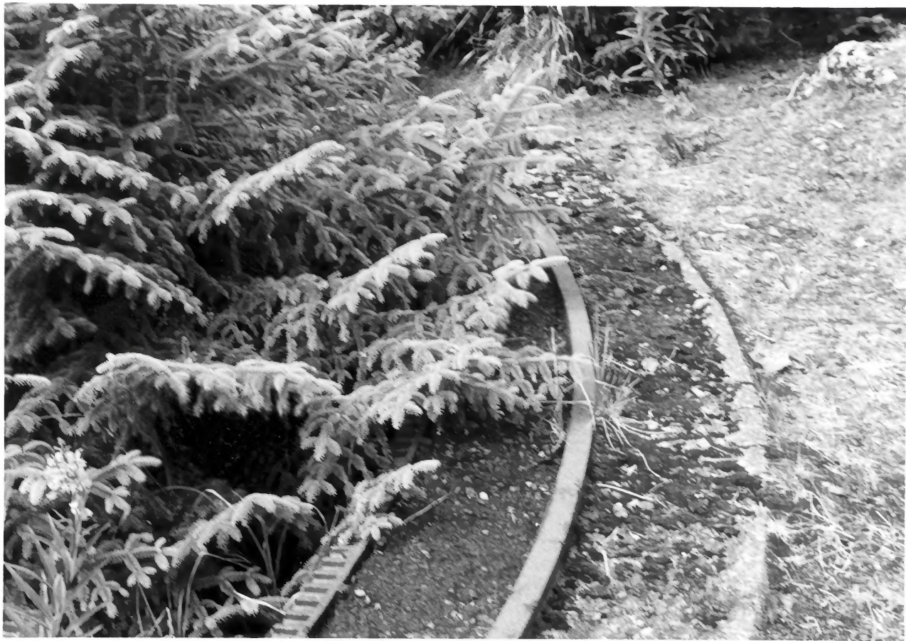
5. Emplacement for a 155 mm gun on Makhnati Island, Harbor Defenses, Sitka. It is on the south flank of the 6-inch gun battery.