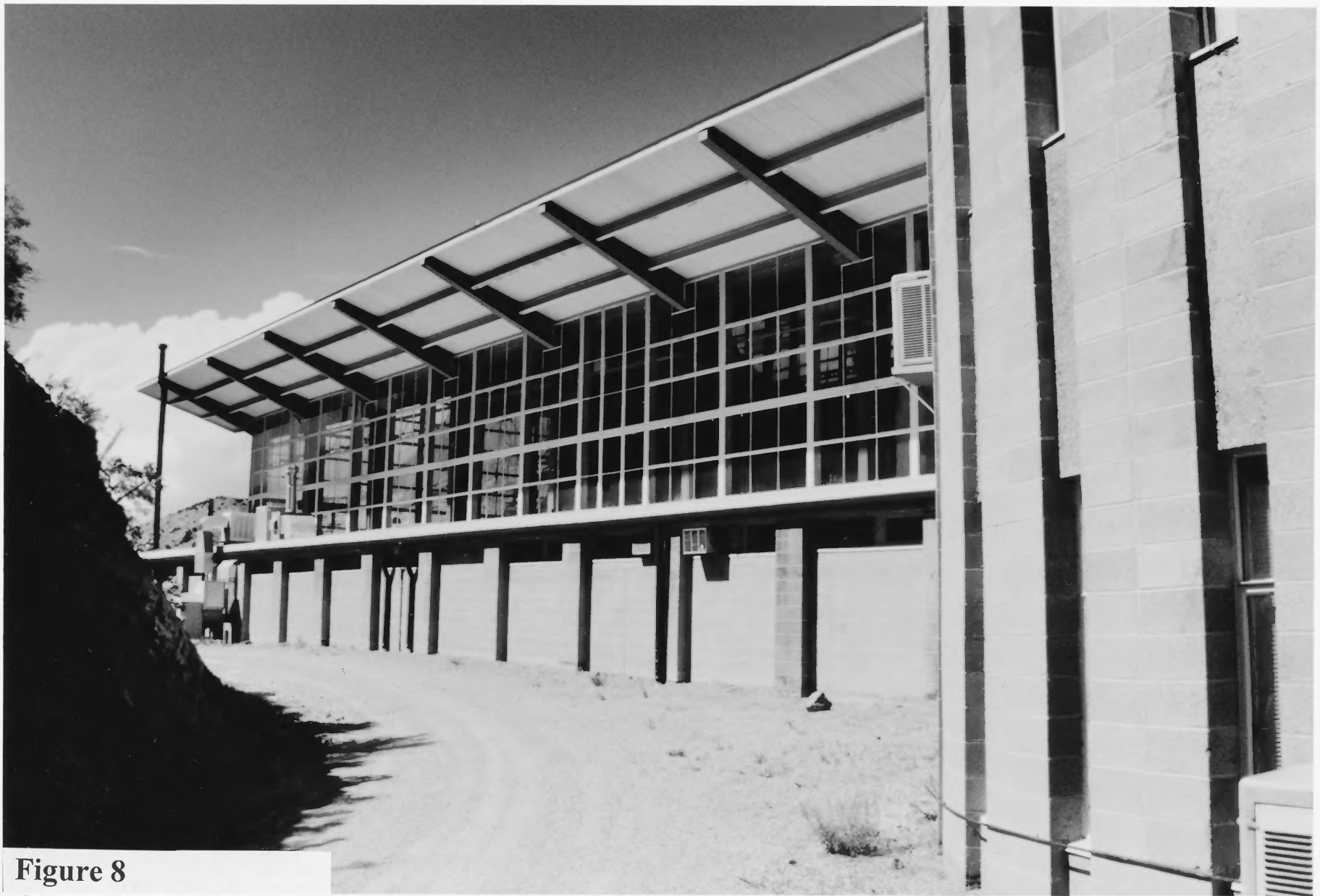
Figure 8 Quarry Visitor Center Uintah County, Utah Exterior detail, 1999