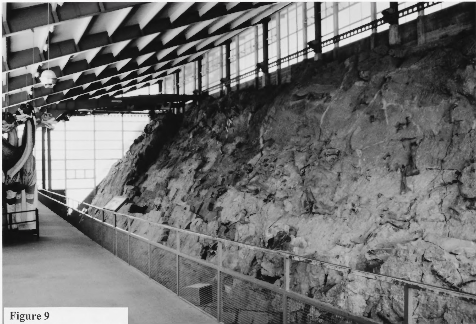
Figure 9 Quarry Visitor Center Uintah County, Utah Interior detail, 1999