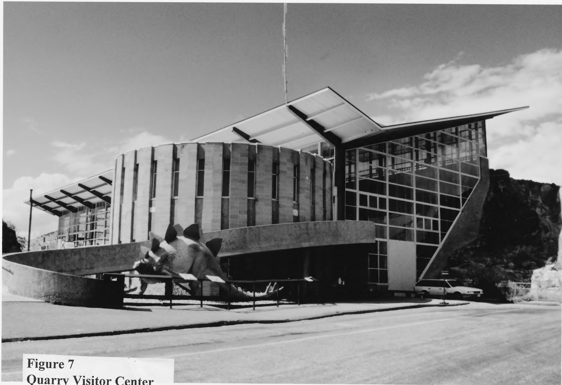
Figure 7 Quarry Visitor Center Uintah County, Utah Exterior, 1999