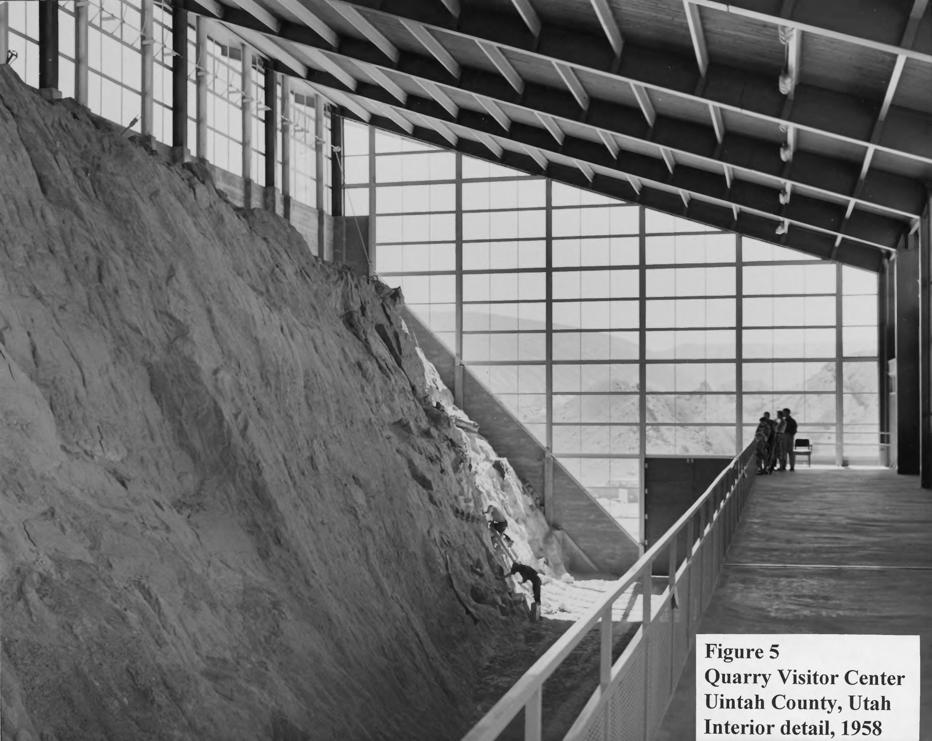
Figure 5 Quarry Visitor Center Uintah County, Utah Interior detail, 1958