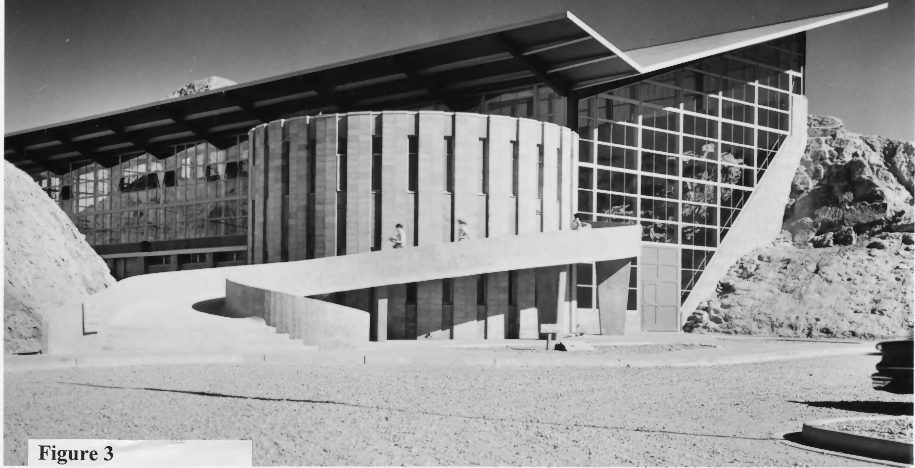
Figure 3 Quarry Visitor Center Uintah County, Utah Exterior, 1958