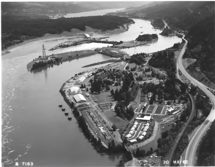
Bonneville Lock and Dam, OR