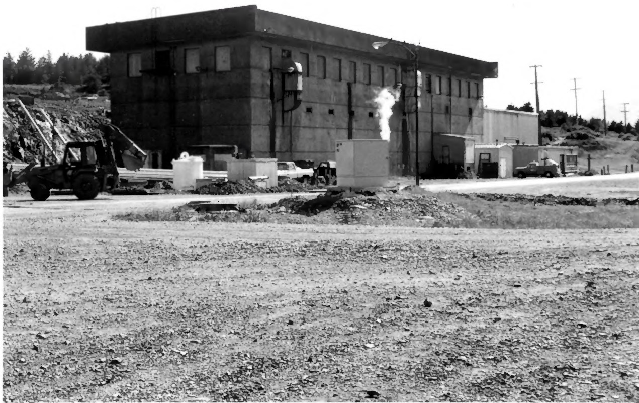
4. Bombproof power plant at Kodiak Naval Air Station.