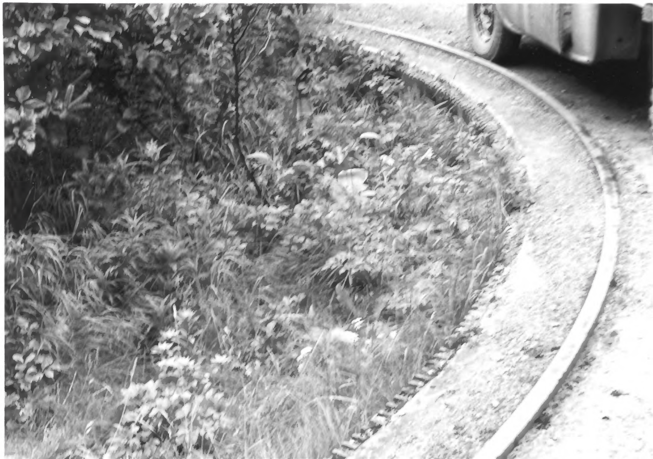
6. Panama mount for a 155mm gun, one of four at a battery on Buskin Hill, Fort Greely, Kodiak. These guns protected the naval base.