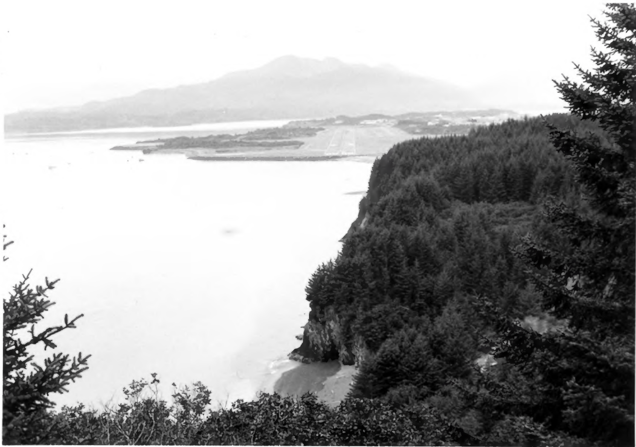
1. Airfield at Kodiak, used by both naval and army planes. Looking from Buskin Hill toward the naval operating base.