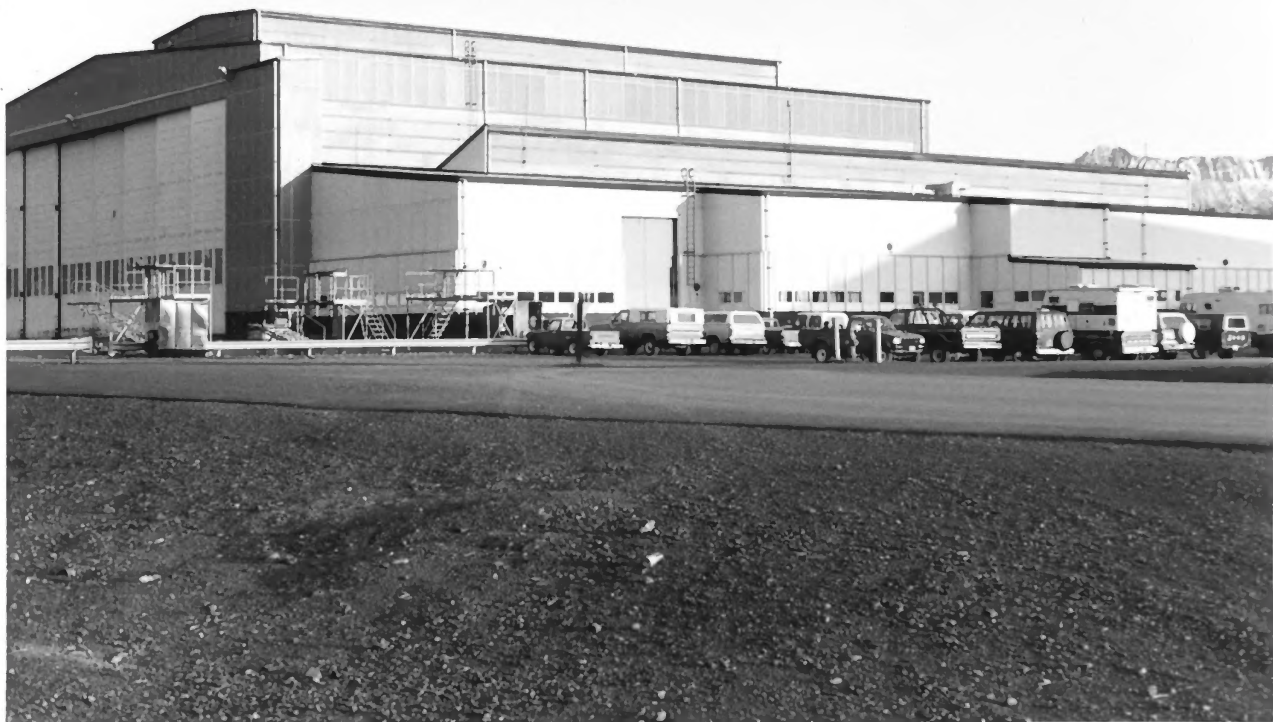
3. Engine overhead and aircraft maintenance building at former Kodiak naval base.