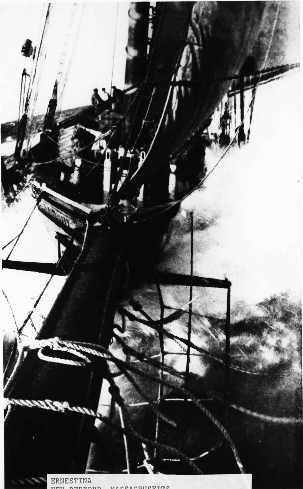
ERNESTINA NEW BEDFORD, MASSACHUSETTS Owner: SCHOONER ERNESTINA COMMISSION MORRISSEY DRIVING ALONG ON THE BANKS, 1913.