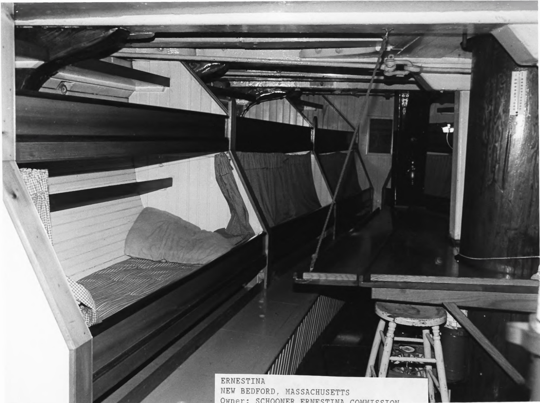
ERNESTINA NEW BEDFORD, MASSACHUSETTS Owner: SCHOONER ERNESTINA COMMISSION FORECASTLE. NOTE THE TRADITIONAL BUNKS OF A GLOUCESTER FISHERMAN. Photo #12 by CANDACE CLIFFORD, 1990 Courtesy of: NATIONAL PARK SERVICE