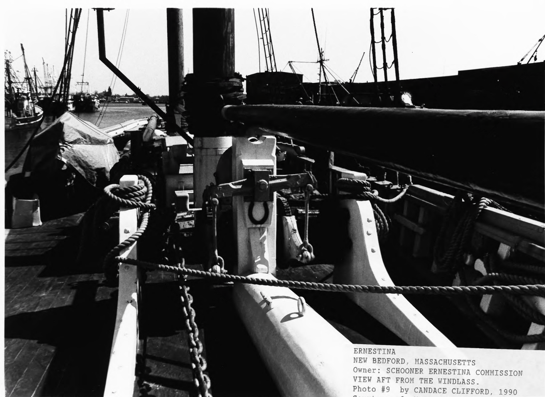
ERNESTINA NEW BEDFORD, MASSACHUSETTS Owner: SCHOONER ERNESTINA COMMISSION VIEW AFT FROM THE WINDLASS. Photo #9 by CANDACE CLIFFORD, 1990 Courtesy of: NATIONAL PARK SERVICE