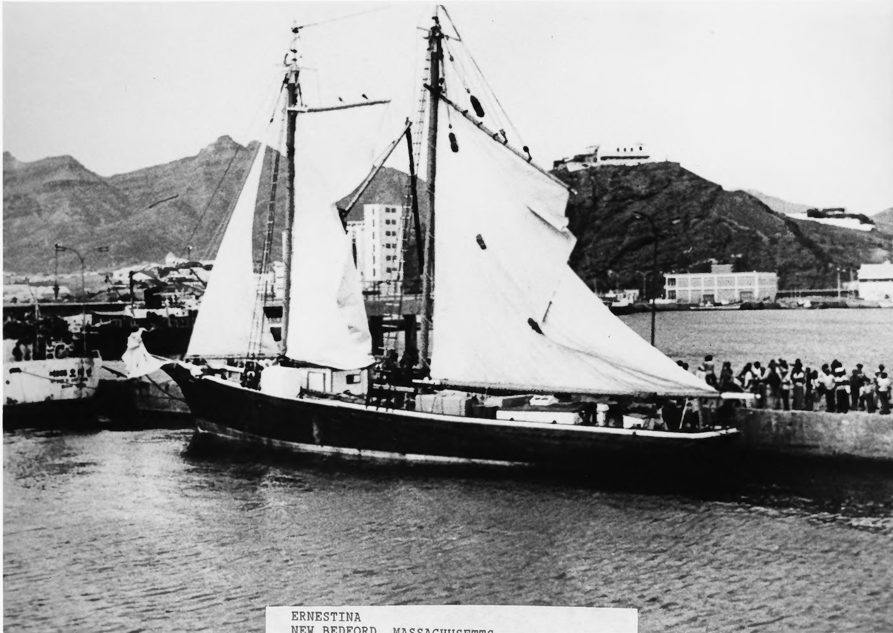
ERNESTINA NEW BEDFORD, MASSACHUSETTS Owner: SCHOONER ERNESTINA COMMISSION THE SCHOONER, NOW ERNESTINA, IN THE CAPE VERDE ISLANDS PRIOR TO RETURN TO THE US. Photo #6 by UNKNOWN, CIRCA 1965 Courtesy of: SCHOONER ERNESTINA COMMISSION