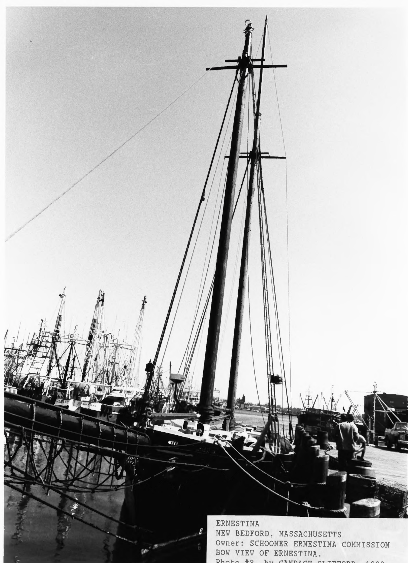
ERNESTINA NEW BEDFORD, MASSACHUSETTS Owner: SCHOONER ERNESTINA COMMISSION BOW VIEW OF ERNESTINA. Photo #8 by CANDACE CLIFFORD, 1990 Courtesy of: NATIONAL PARK SERVICE