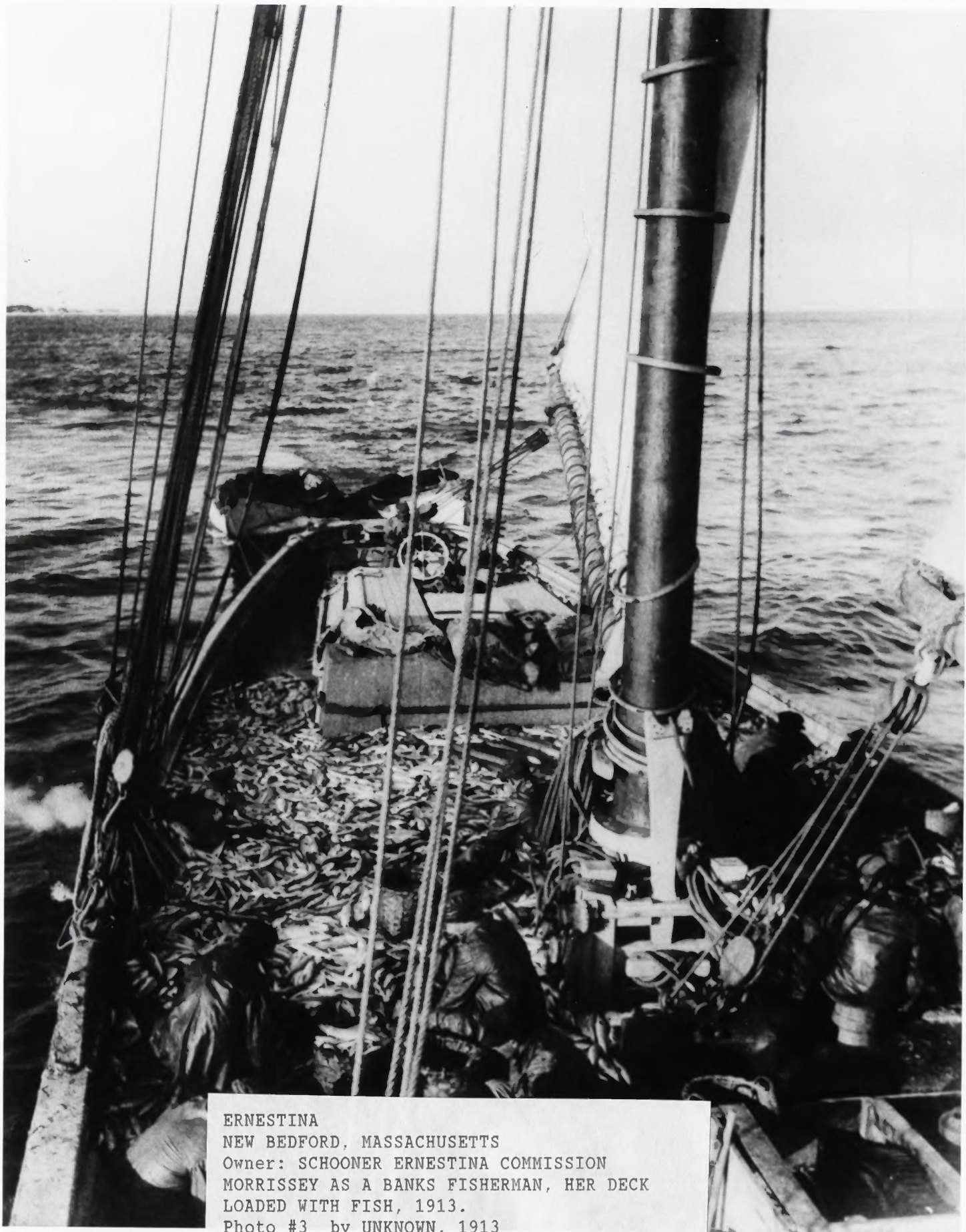
ERNESTINA NEW BEDFORD, MASSACHUSETTS Owner: SCHOONER ERNESTINA COMMISSION MORRISSEY AS A BANKS FISHERMAN, HER DECK LOADED WITH FISH, 1913. Photo #3 by UNKNOWN, 1913 Courtesy of: SCHOONER ERNESTINA COMMISSION