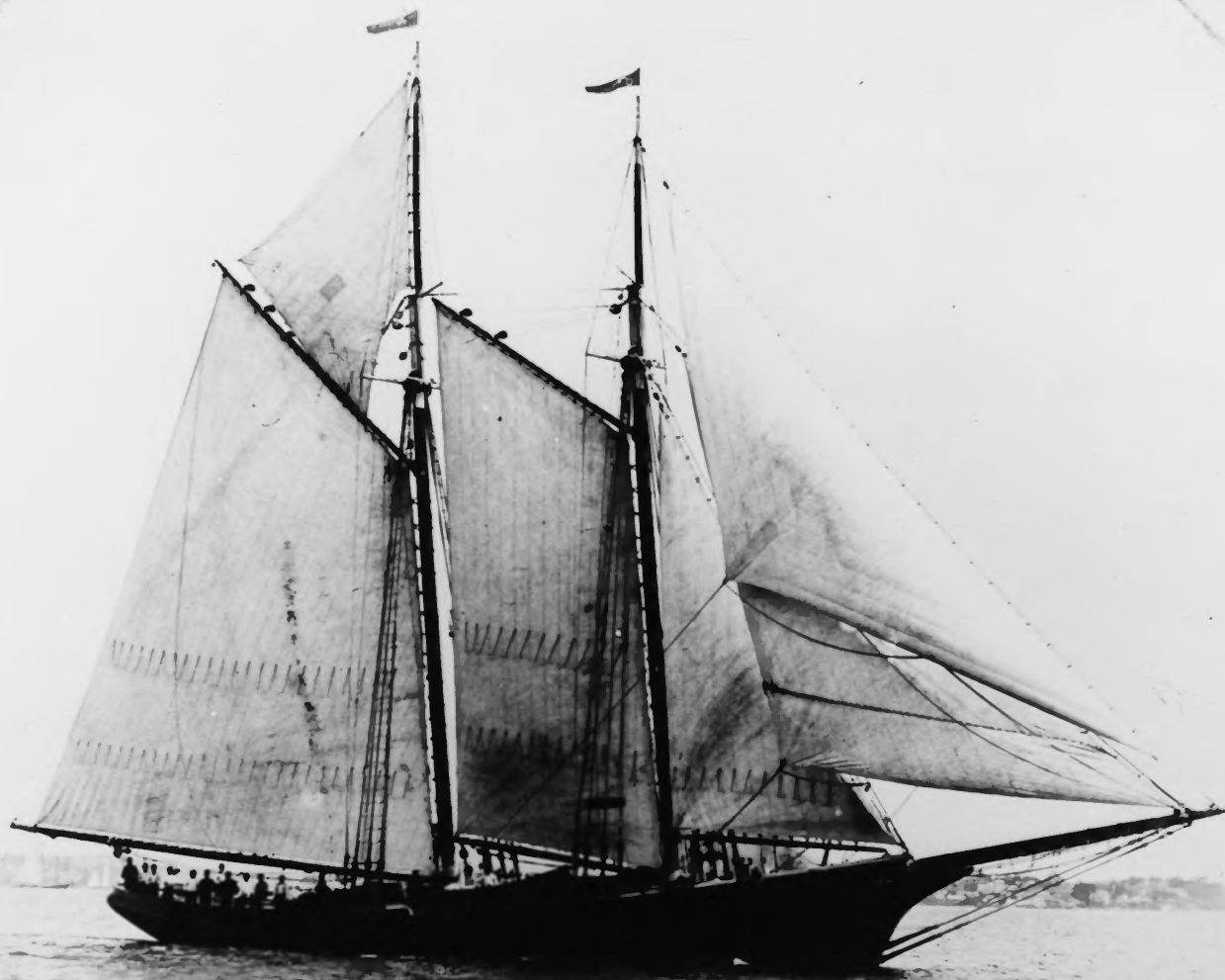
ERNESTINA NEW BEDFORD, MASSACHUSETTS Owner: SCHOONER ERNESTINA COMMISSION EFFIE M. MORRISSEY, LATER ERNESTINA, IN 1894.