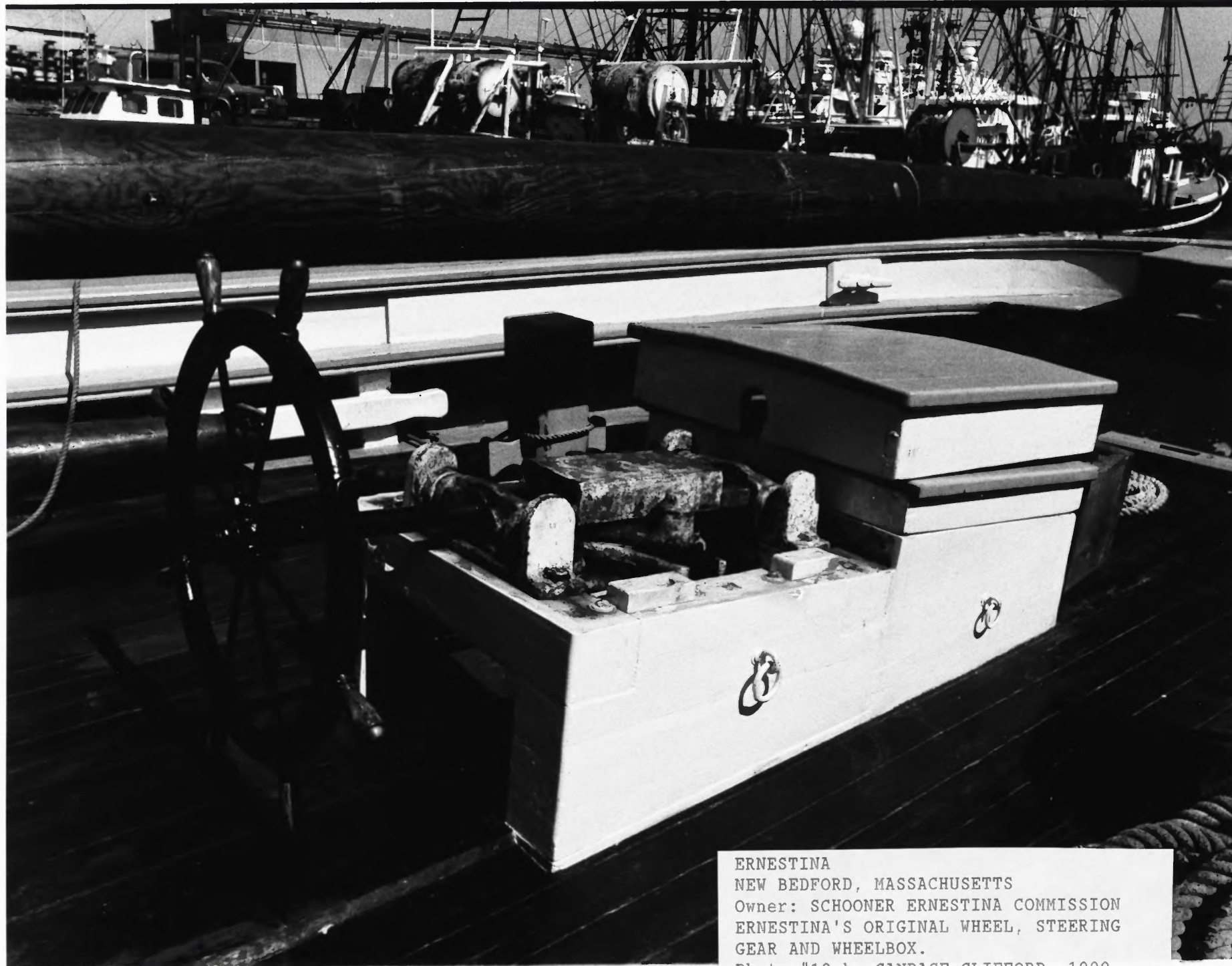
ERNESTINA NEW BEDFORD, MASSACHUSETTS Owner: SCHOONER ERNESTINA COMMISSION ERNESTINA'S ORIGINAL WHEEL, STEERING GEAR AND WHEELBOX.