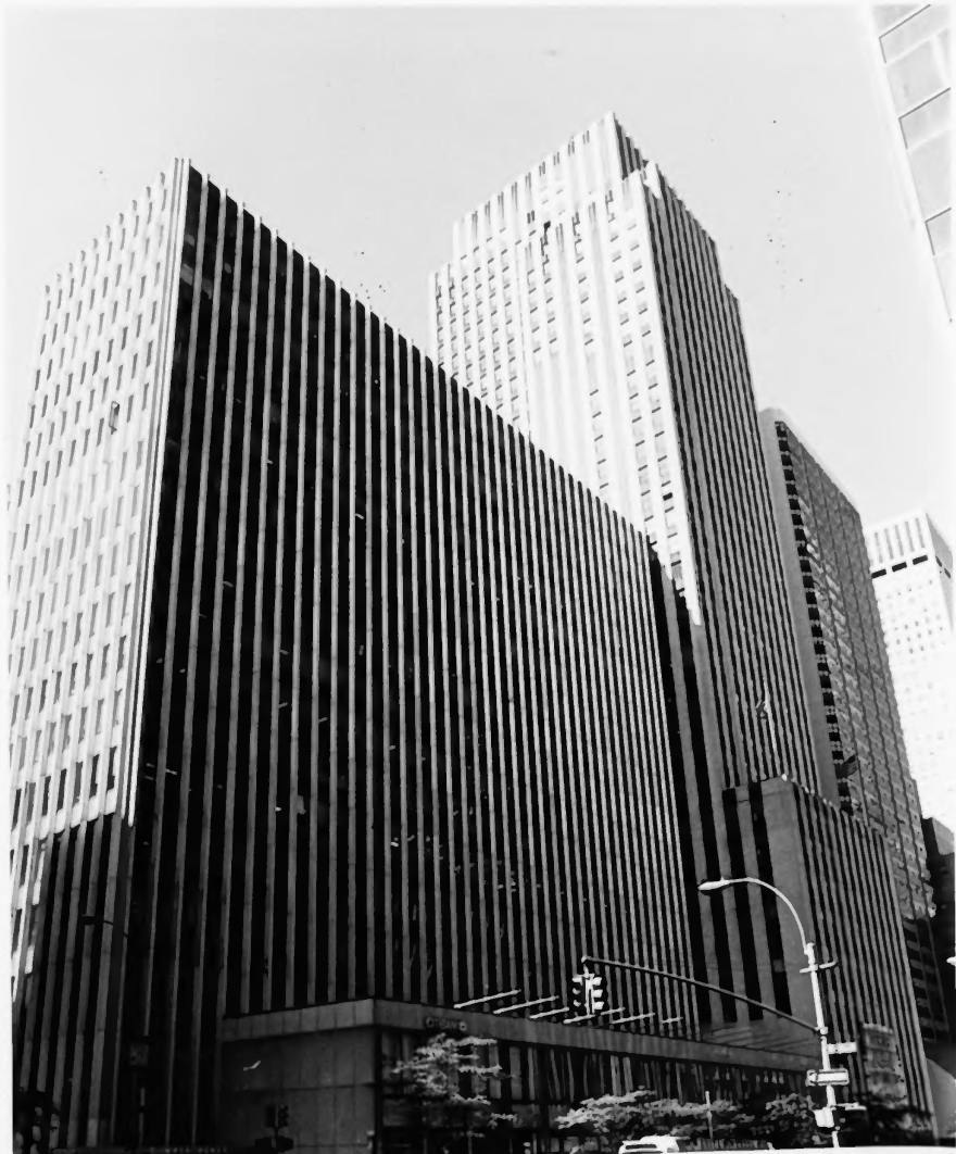
DAILY NEWS BUILDING New York County, New York

Photo by: Carl Forster, 1981 Neg. at: New York Landmarks Preservation Commission