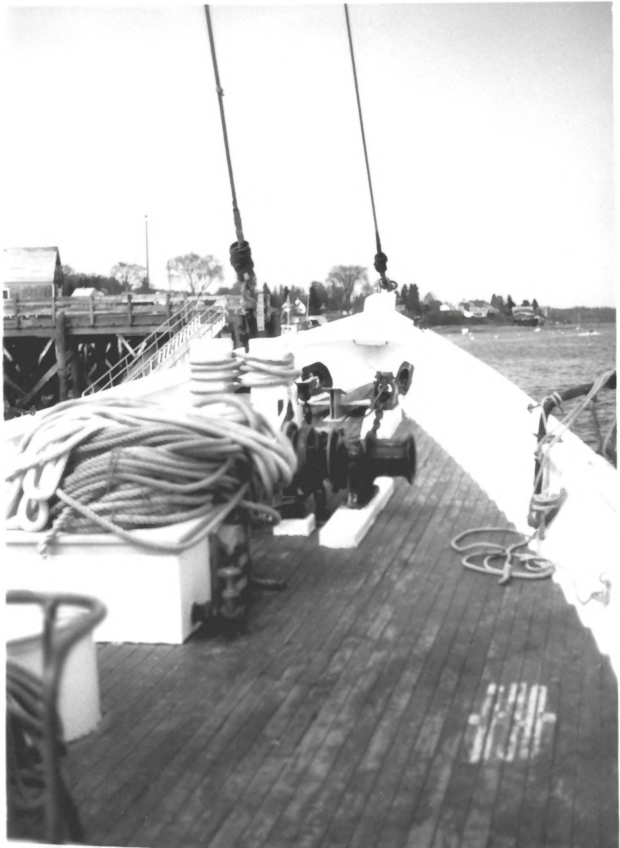
SCHOONER BOWDOIN CASTINE, MAINE Owner: SCHOONER BOWDOIN ASSOCIATION, INC. VIEW OF THE FORECASTLE DECK, SHOWING THE ORIGINAL WINDLASS. Photo #6 by JAMES P. DELGADO, 1989 Courtesy of: NATIONAL PARK SERVICE