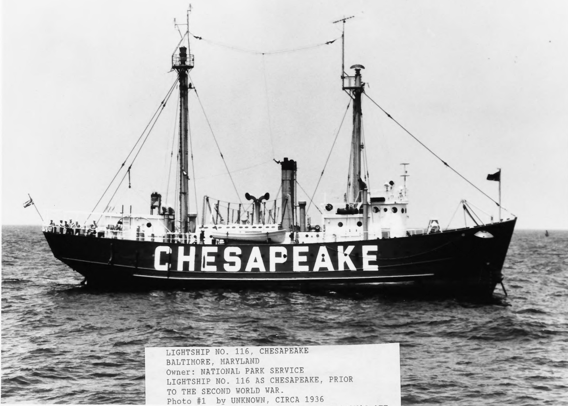
LIGHTSHIP NO. 116, CHESAPEAKE BALTIMORE, MARYLAND Owner: NATIONAL PARK SERVICE LIGHTSHIP NO. 116 AS CHESAPEAKE, PRIOR TO THE SECOND WORLD WAR. Photo #1 by UNKNOWN, CIRCA 1936 Courtesy of: U.S. COAST GUARD HISTORIAN'S OFF