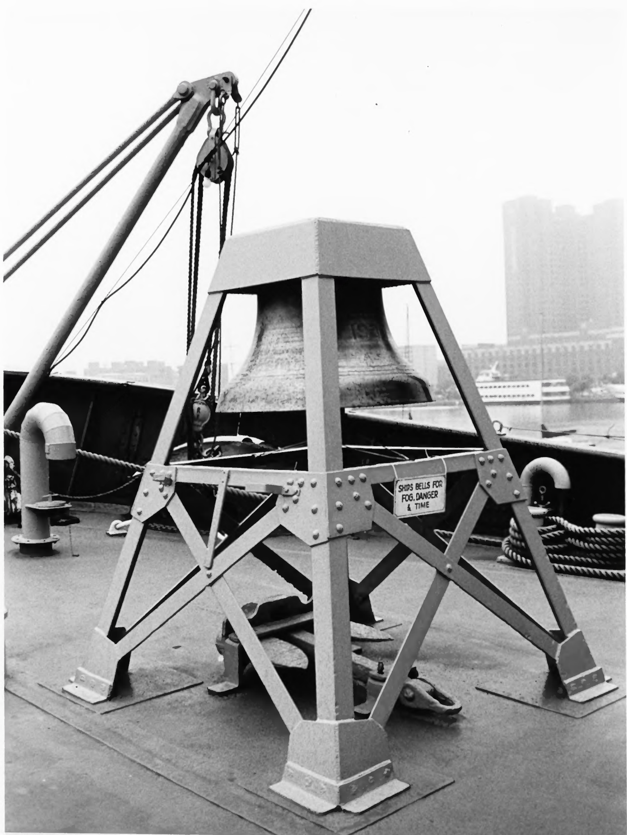
LIGHTSHIP NO. 116, CHESAPEAKE BALTIMORE, MARYLAND Owner: NATIONAL PARK SERVICE HAND STRUCK FOG BELL ABOARD LIGHTSHIP NO. 116.

Photo #4 by J. CANDACE CLIFFORD, 1989 Courtesy of: NATIONAL PARK SERVICE