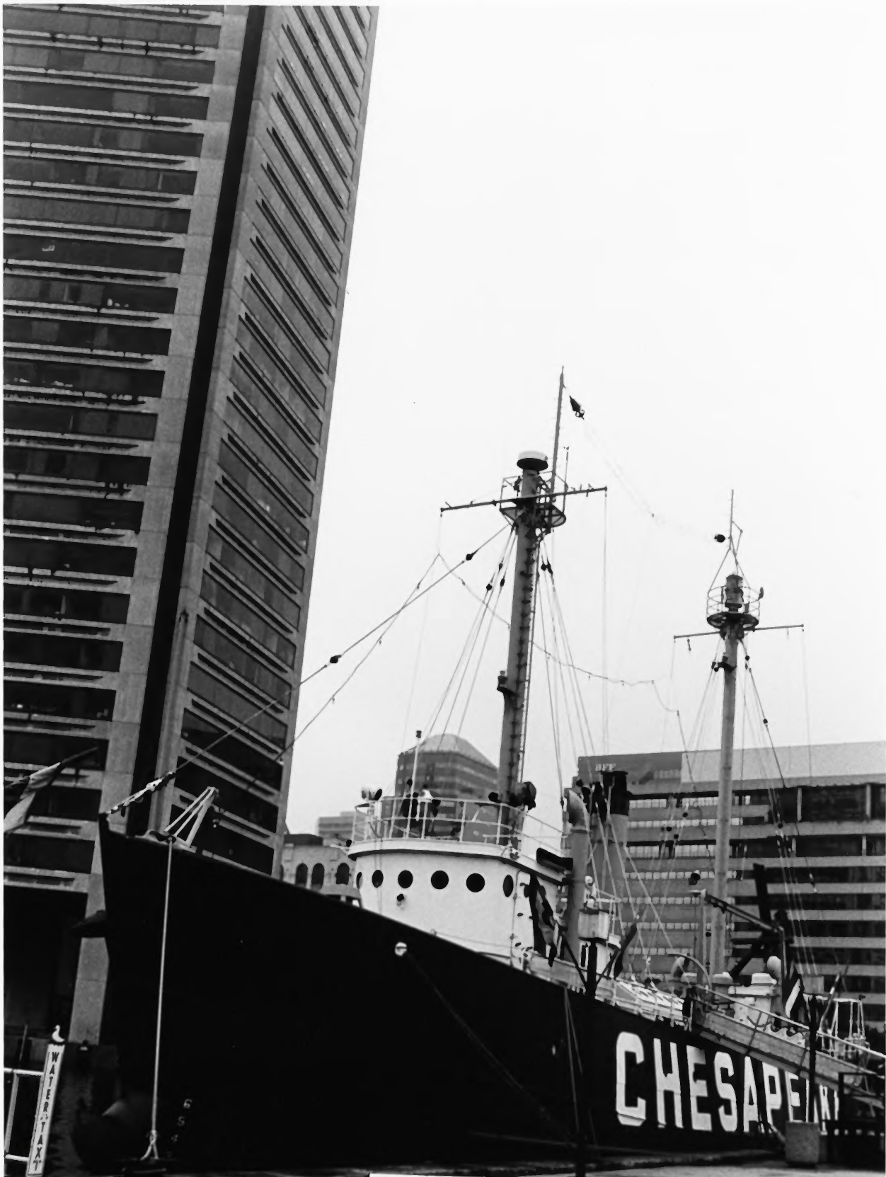
LIGHTSHIP NO. 116, CHESAPEAKE BALTIMORE, MARYLAND Owner: NATIONAL PARK SERVICE BOW VIEW OF LIGHTSHIP NO. 116, SHOWING THE MASTS WITH OPTICS. Photo #3 by J. CANDACE CLIFFORD, 1989 Courtesy of: NATIONAL PARK SERVICE