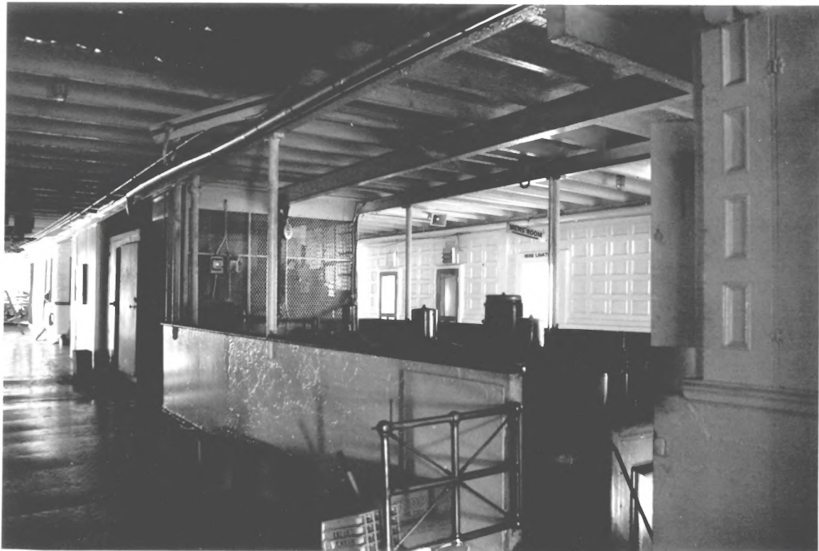
Steamer Columbia Ecorse, Michigan Main deck amidships, 1991