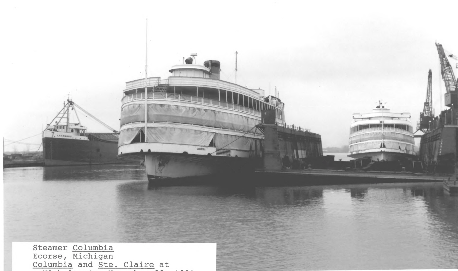
Steamer Columbia Ecorse, Michigan Columbia and Ste. Claire at Nicholson's, November 22, 1991