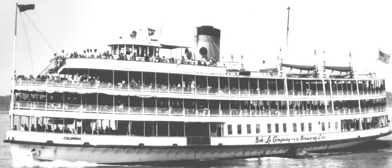
Steamer Columbia Ecorse, Michigan Part of the Browning Line, 1973 Photo #7 by Unknown Courtesy Bob-Lo Boat Company