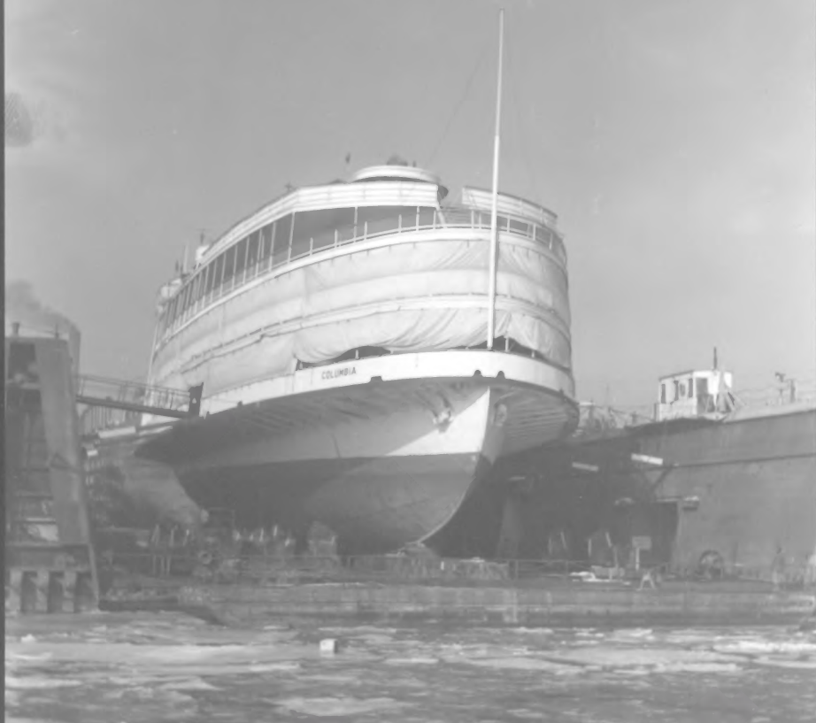
Steamer Columbia Ecorse, Michigan In drydock, 1966