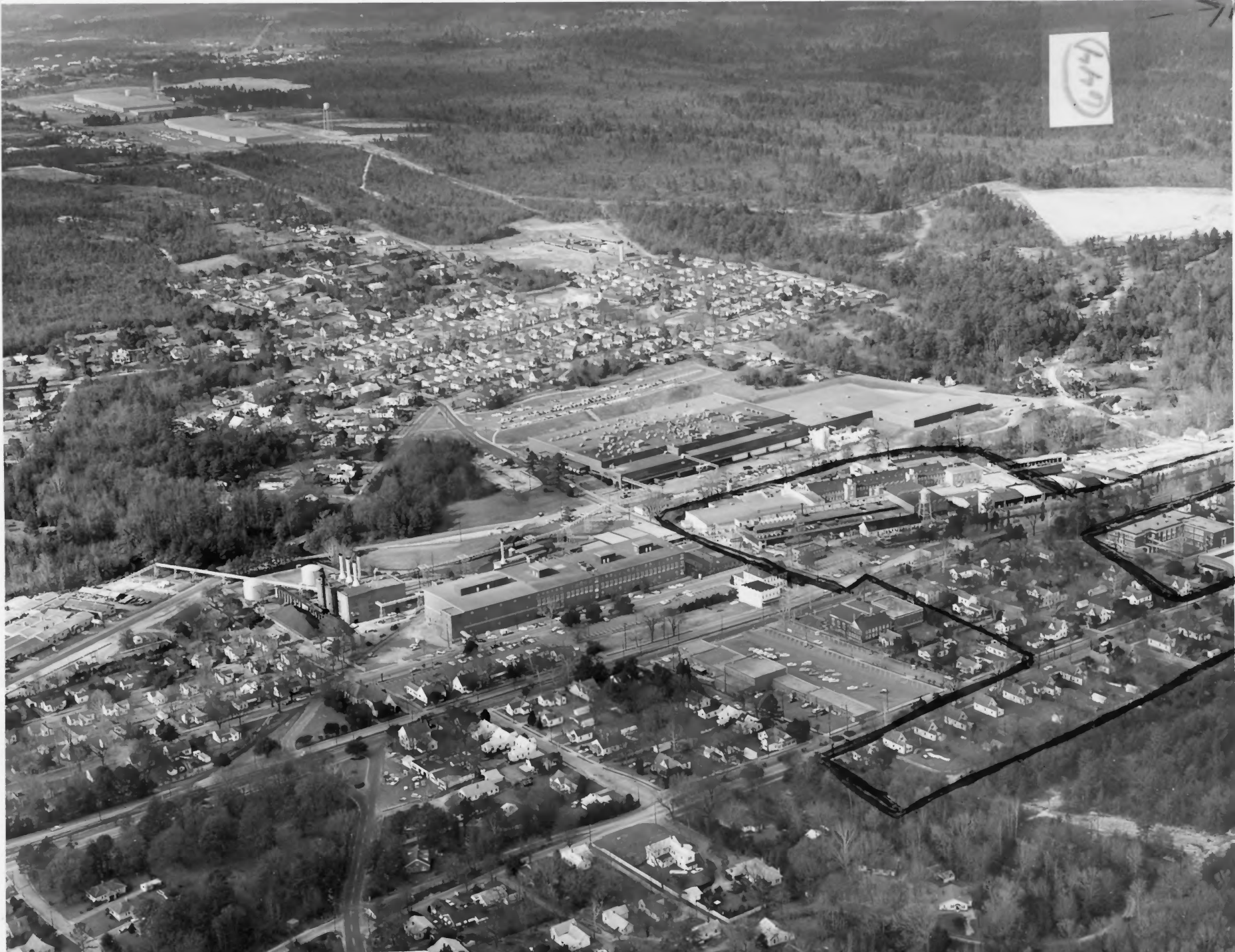
GRANITEVILLE HISTORIC DISTRICT