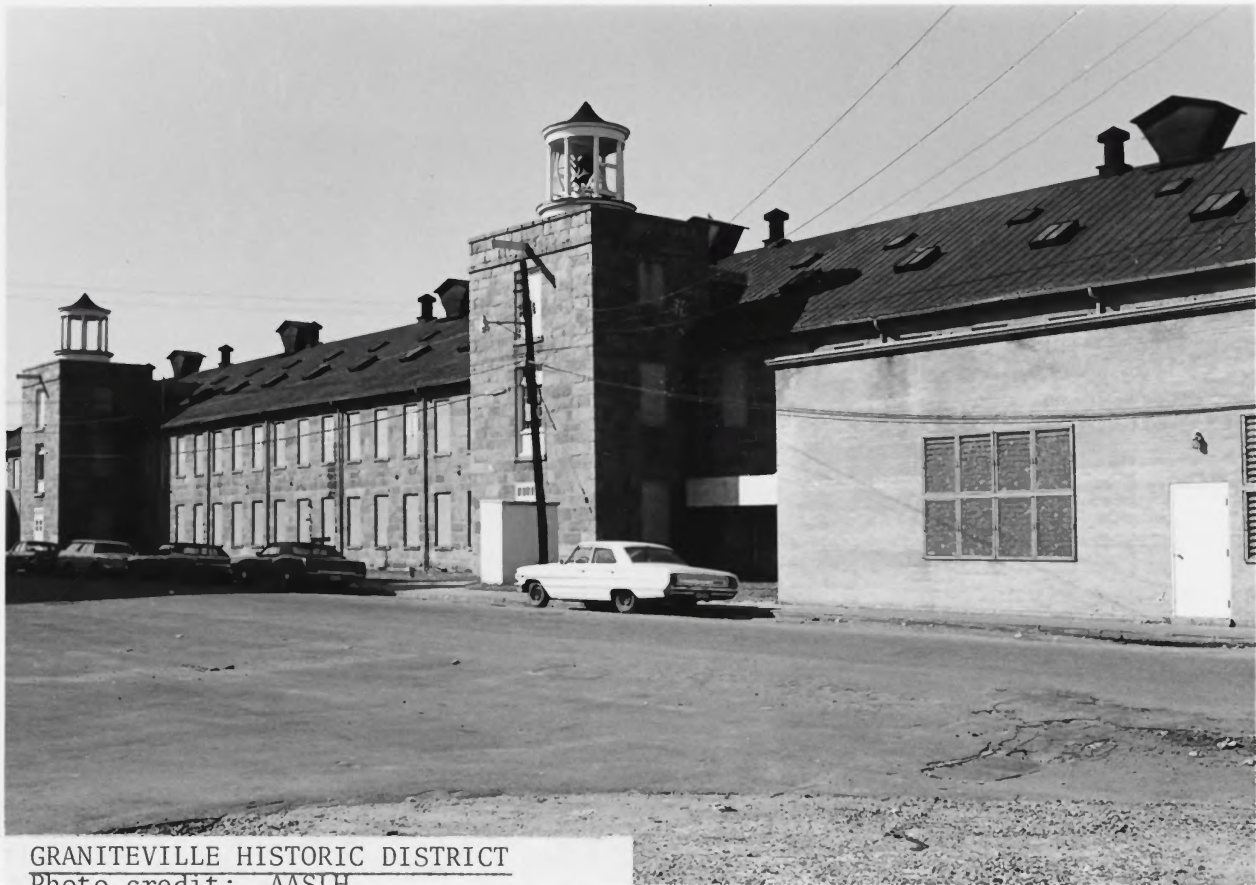
GRANITEVILLE HISTORIC DISTRICT