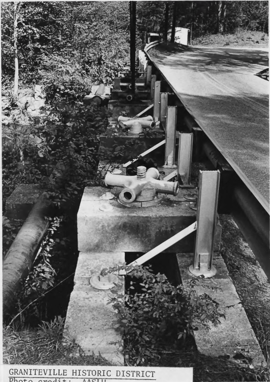
GRANITEVILLE HISTORIC DISTRICT