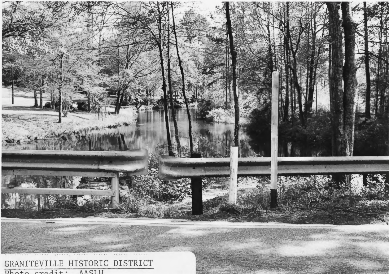
GRANITEVILLE HISTORIC DISTRICT