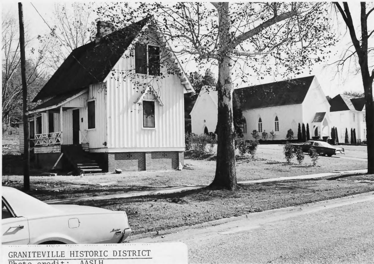
GRANITEVILLE HISTORIC DISTRICT