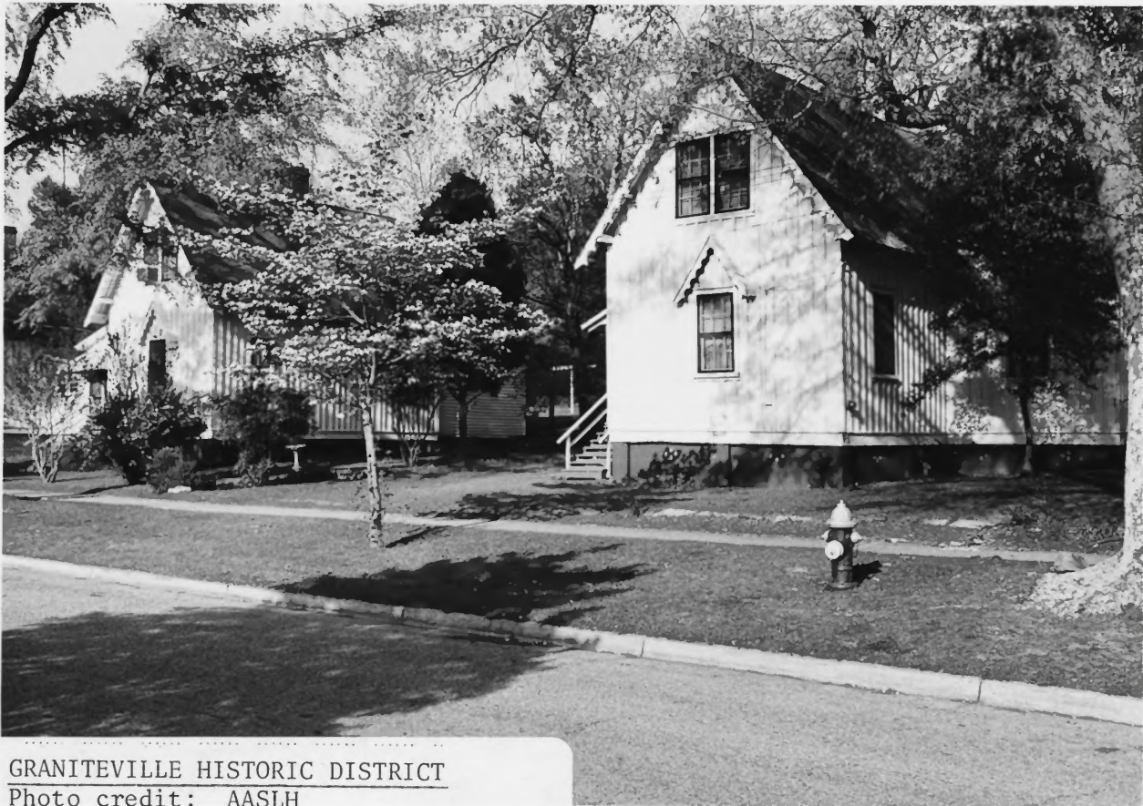
GRANITEVILLE HISTORIC DISTRICT