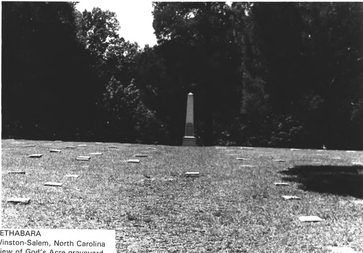
BETHABARA Winston-Salem, North Carolina View of God's Acre graveyard