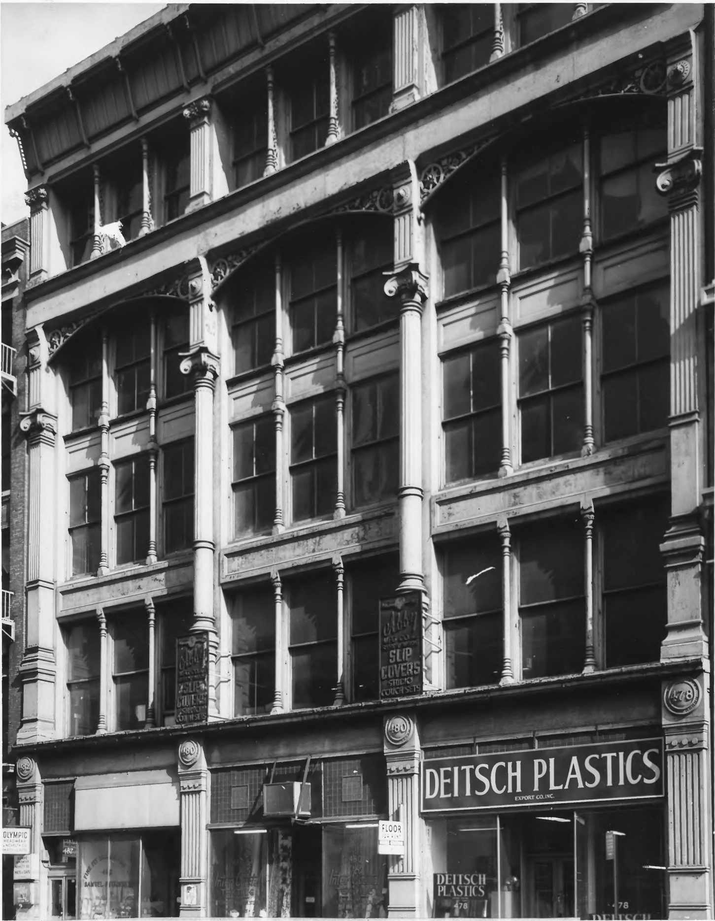
SoHo-Cast Iron Historic District, N.Y.