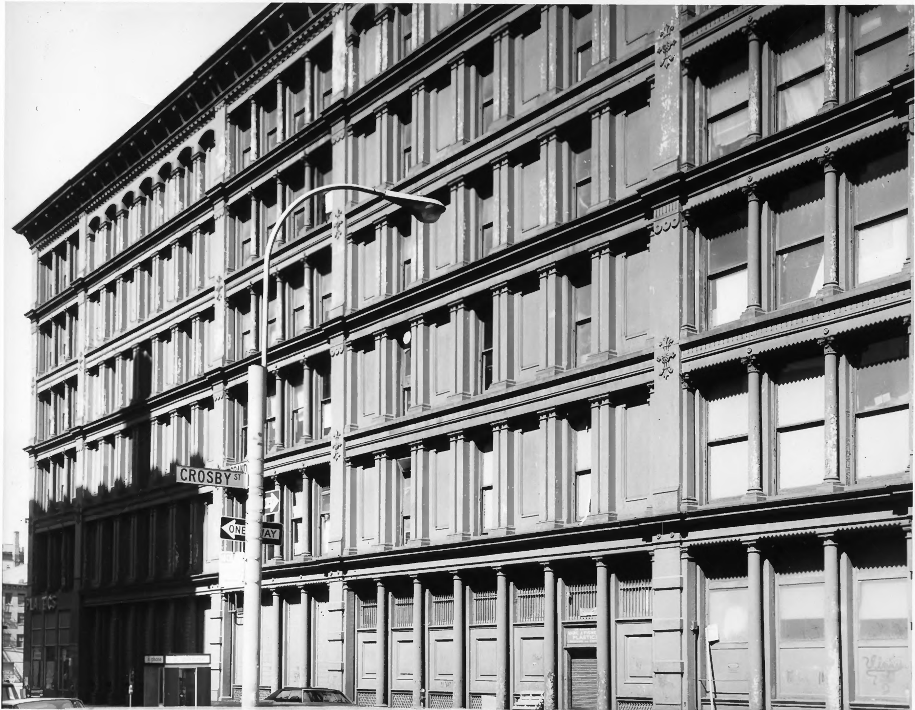
SoHo-Cast Iron Historic District, N.Y.