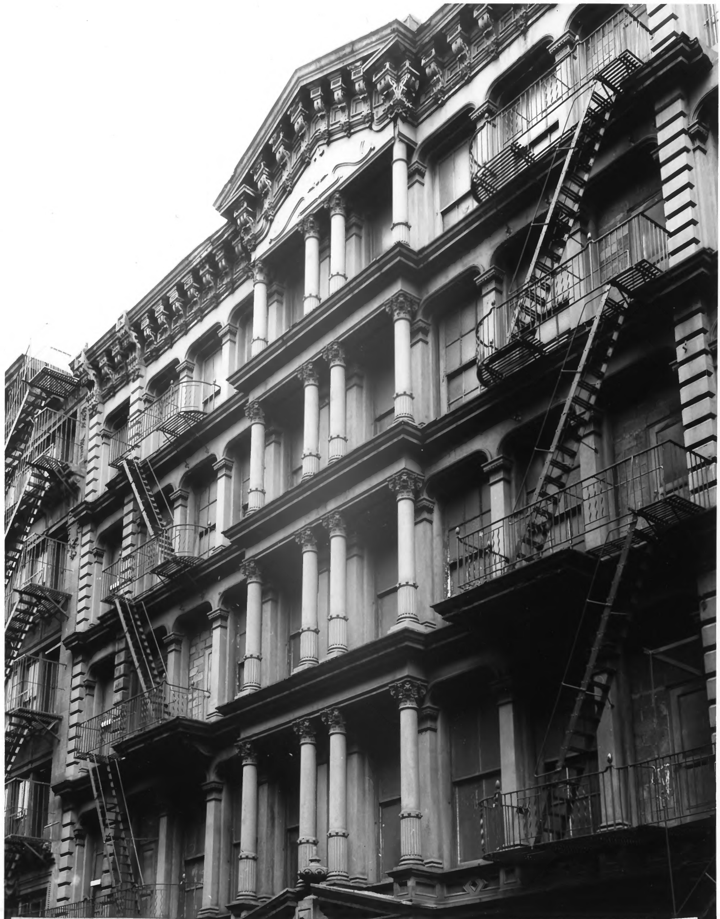
SoHo-Cast Iron Historic District, N.Y.