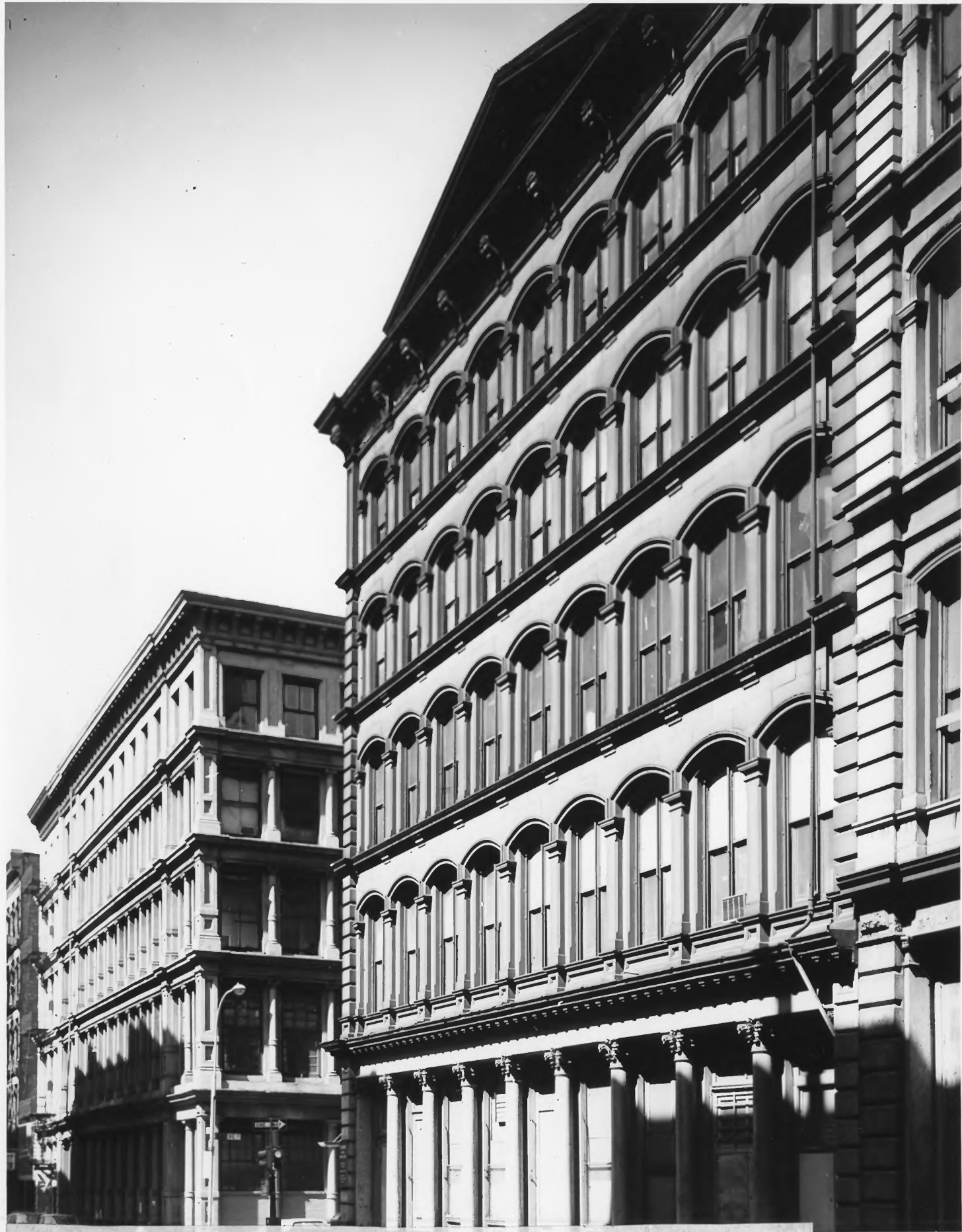
SoHo-Cast Iron Historic District, N.Y.