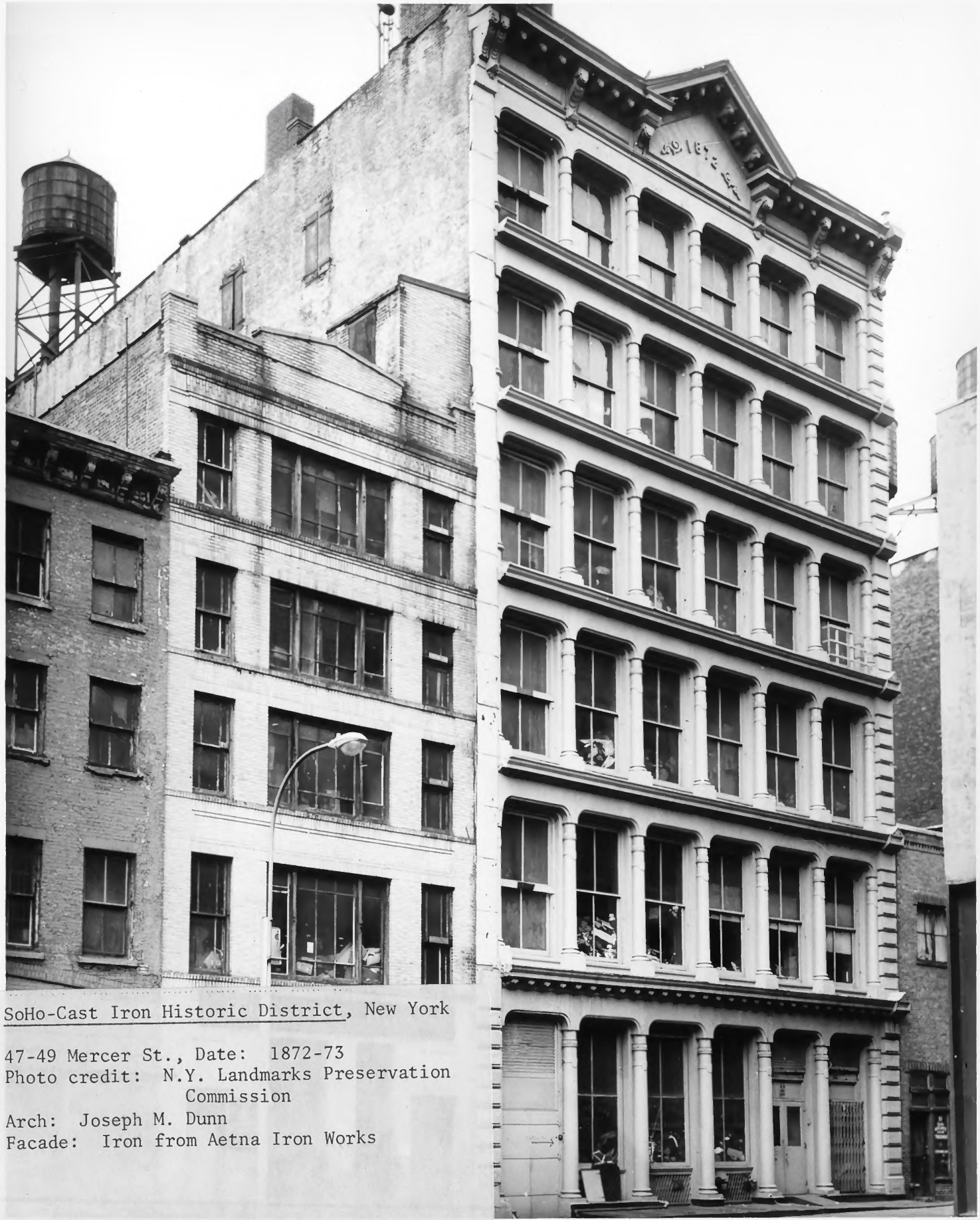
SoHo-Cast Iron Historic District, New York