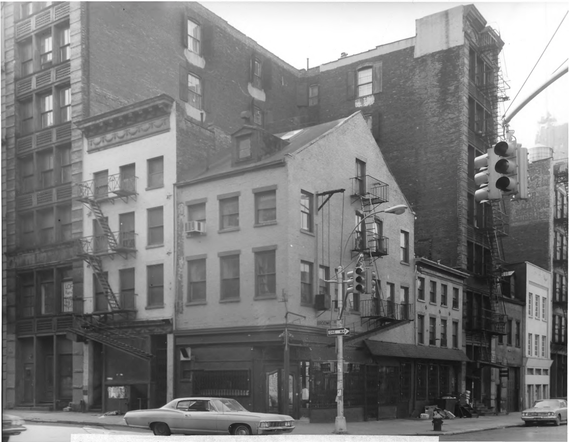
SoHo-Cast Iron Historic District, N.Y.