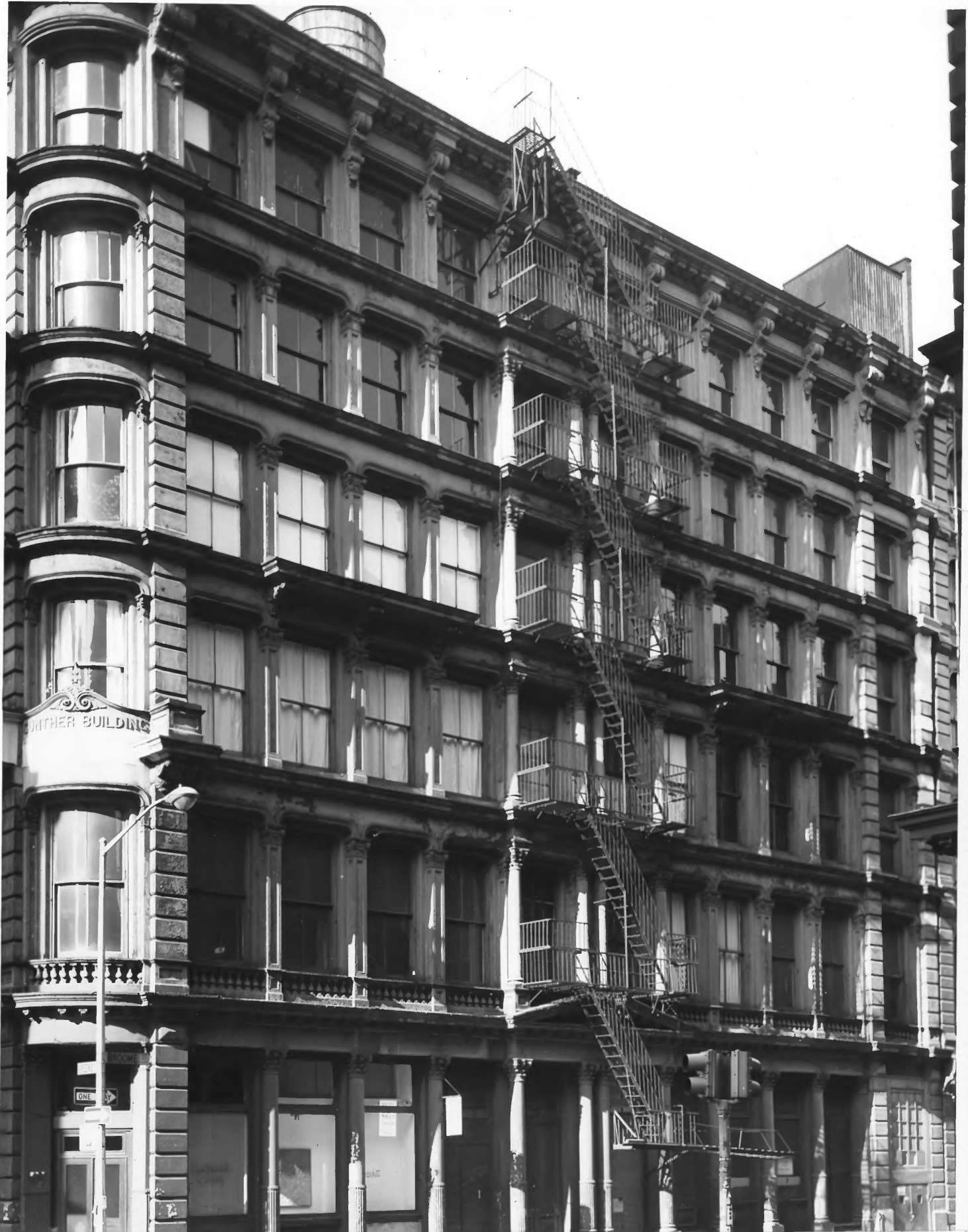
SoHo-Cast Iron Historic District, N.Y.