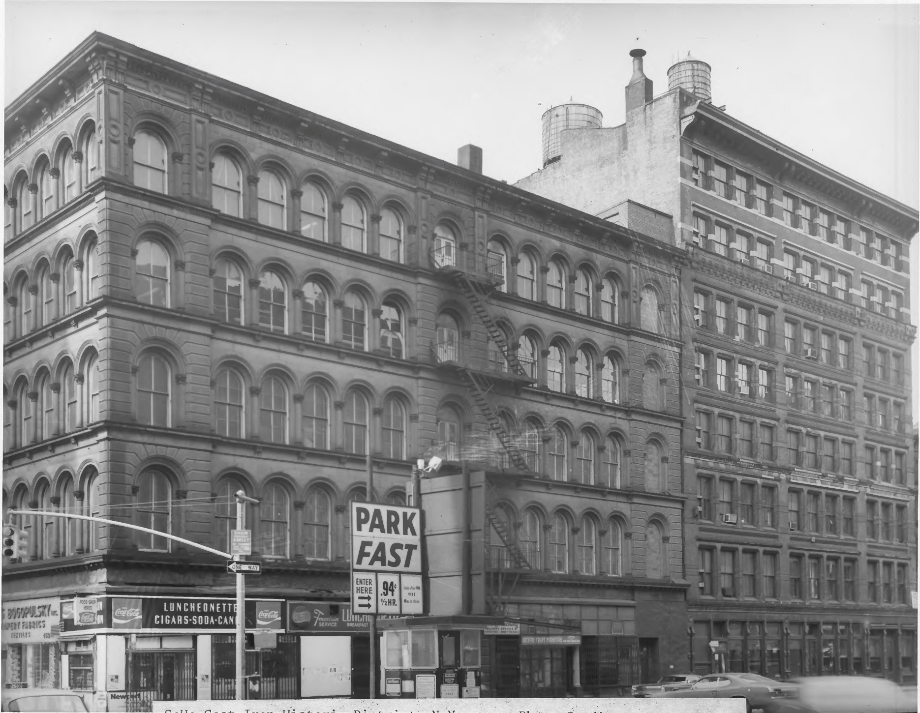
SoHo-Cast Iron Historic District, N.Y.