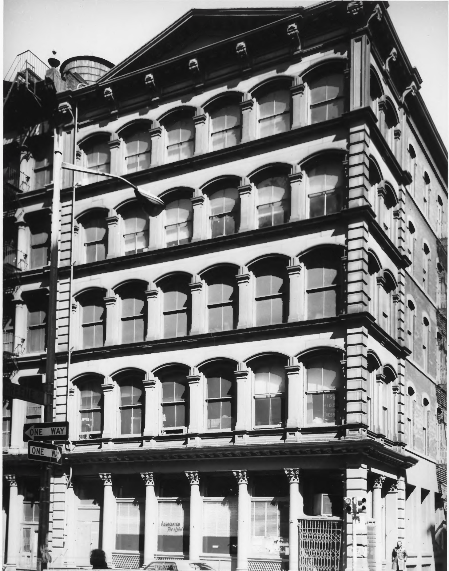
SoHo-Cast Iron Historic District, N.Y.