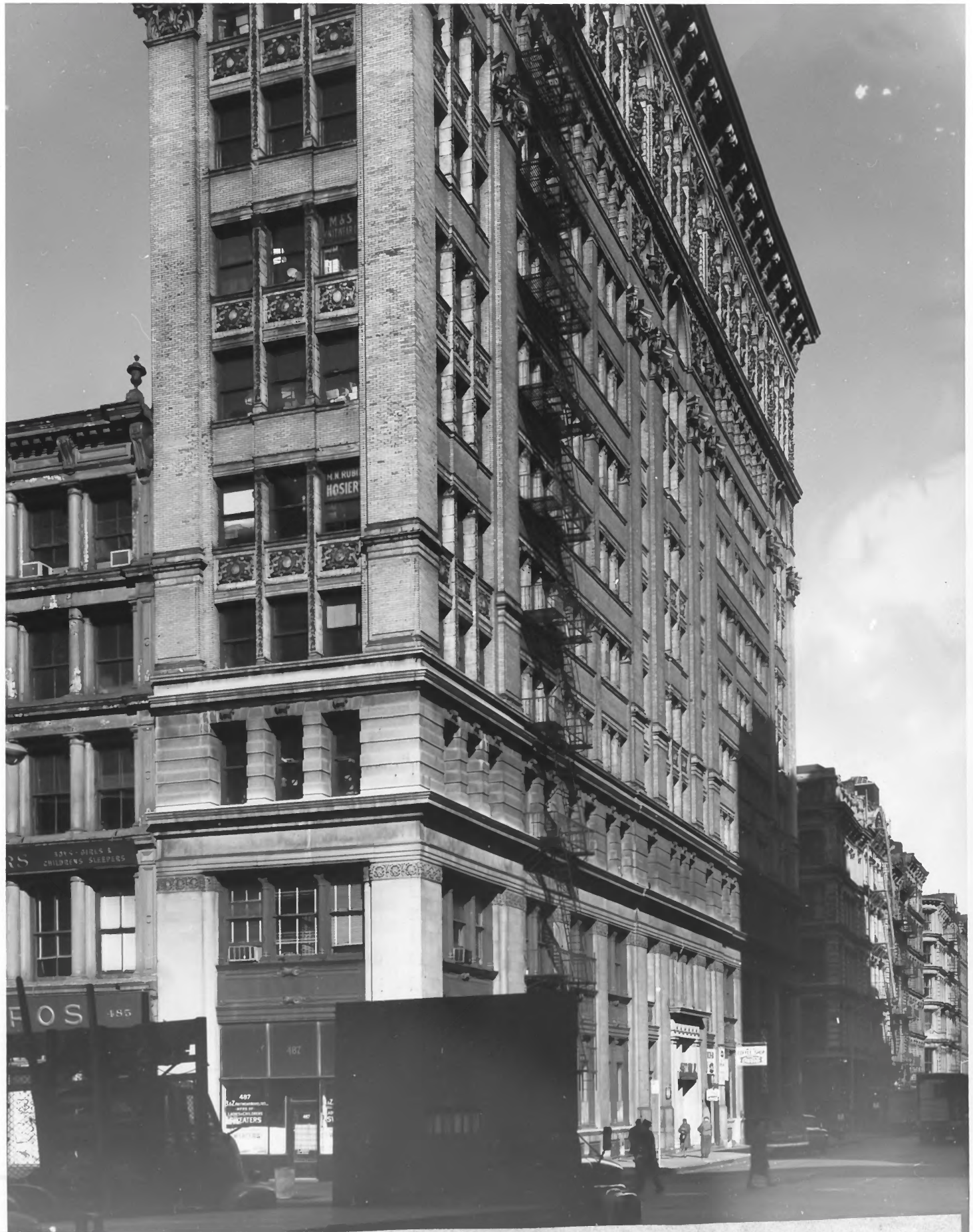
SoHo-Cast Iron Historic District, N.Y.