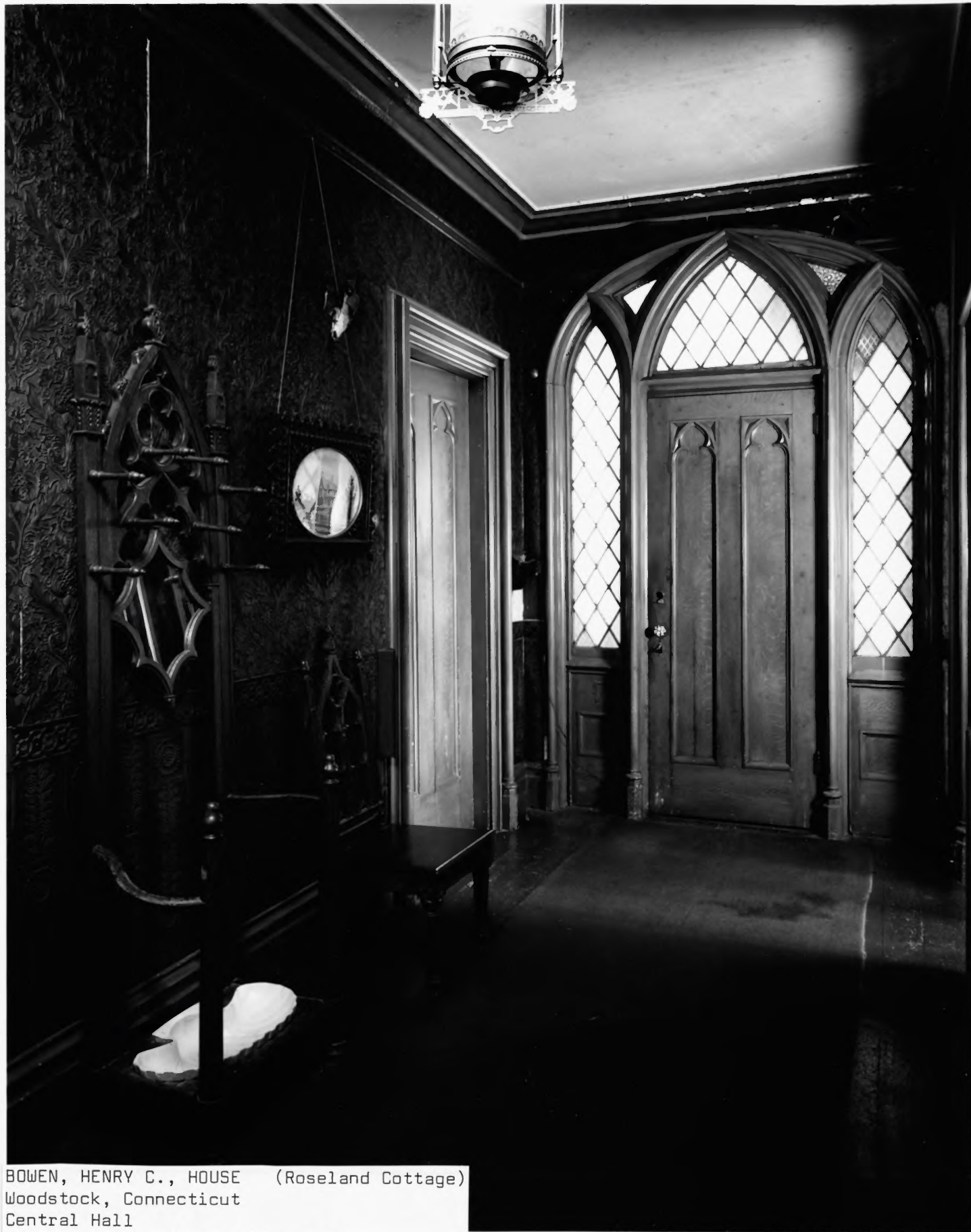
BOWEN, HENRY C., HOUSE (Roseland Cottage) Woodstock, Connecticut Central Hall