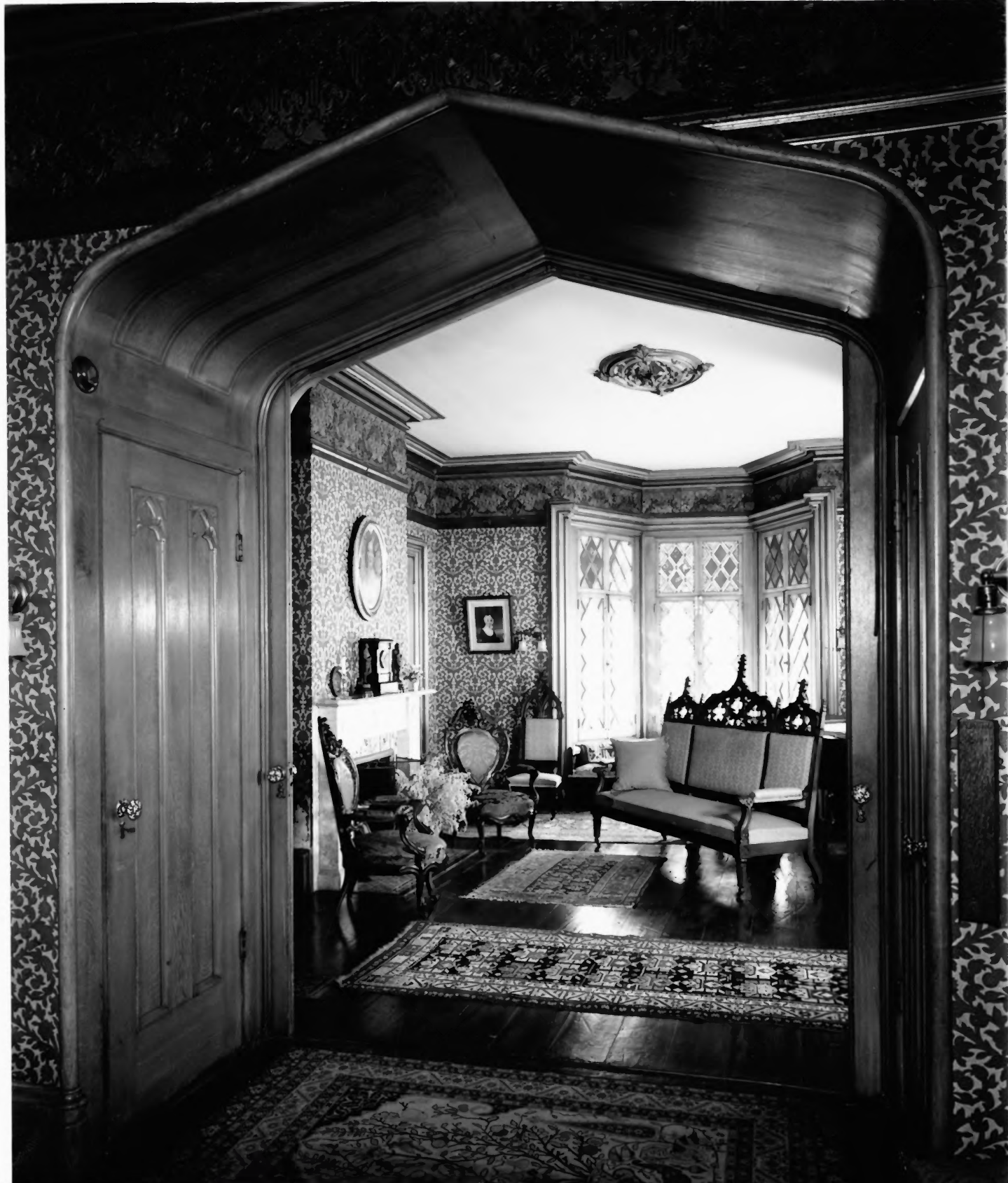
BOWEN, HENRY C., HOUSE (Roseland Cottage) Woodstock, Connecticut View into Back Parlor from Front Parlor