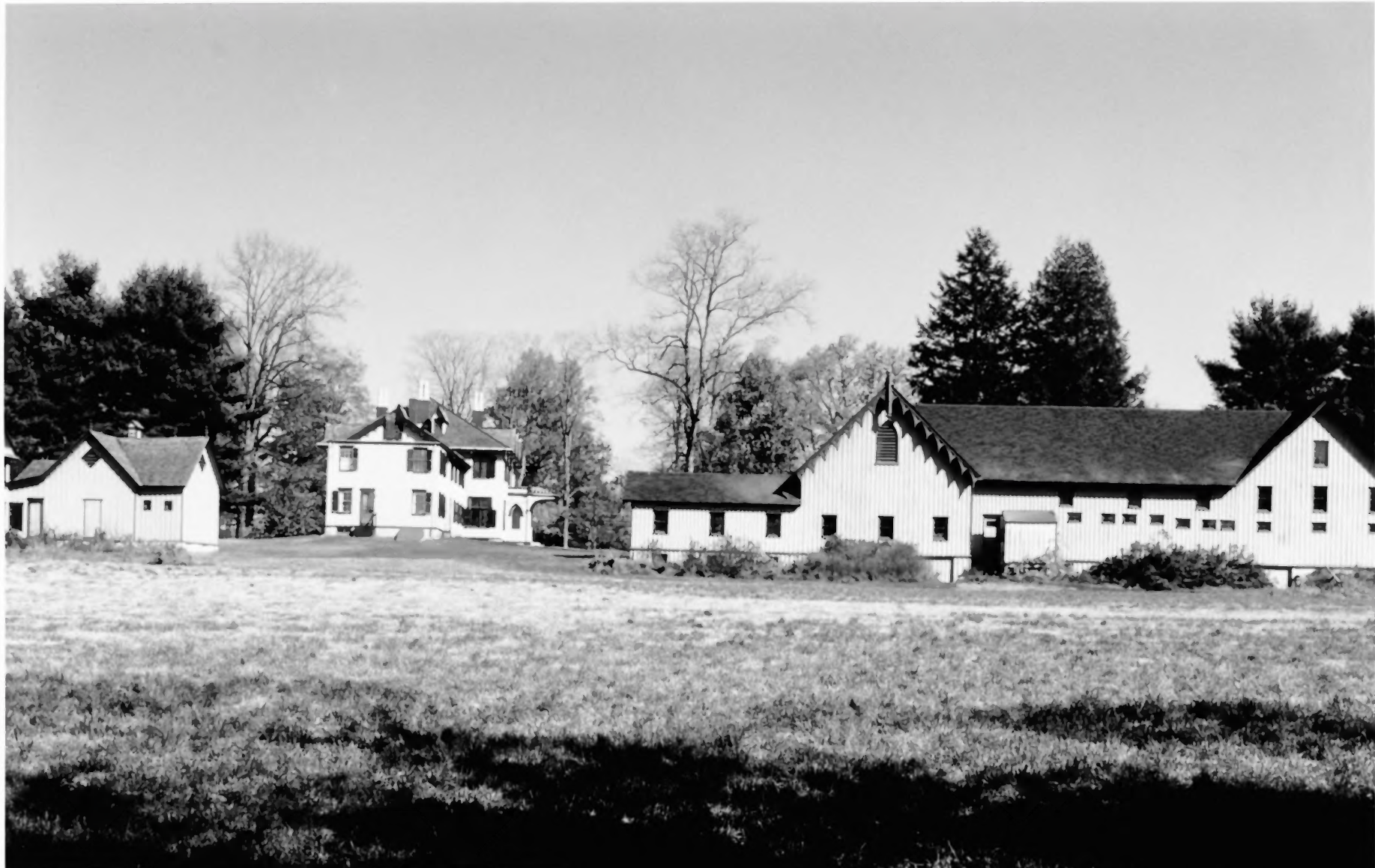
BOWEN, HENRY C., HOUSE (Roseland Cottage) Woodstock, Connecticut Ice house (left), west facade of house, barn & bowling alley (right)