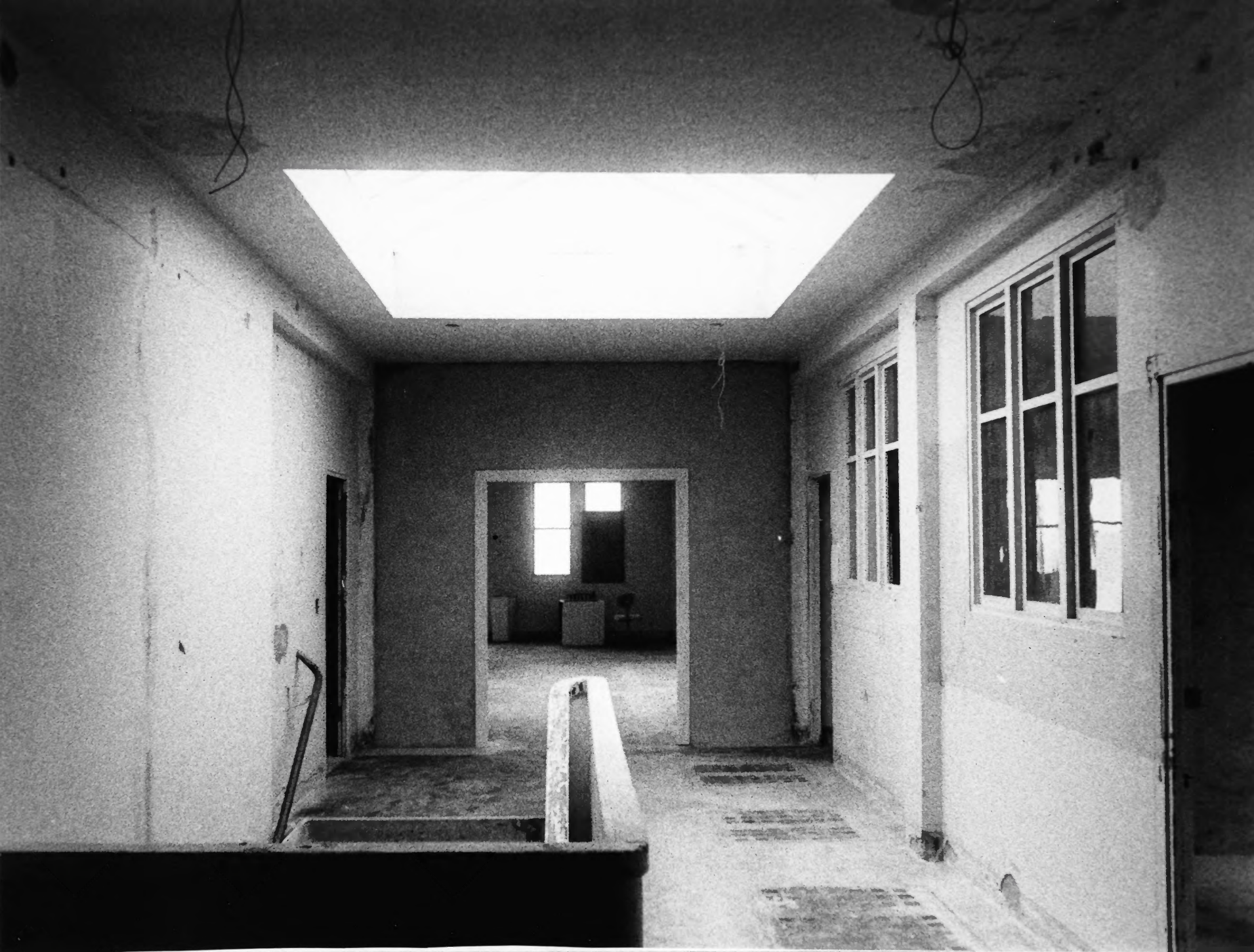
Upstairs corridor (toward classroom). Skylight, interior windows, and sidewalk lights visible. (Photo taken in natural light.) (1980)