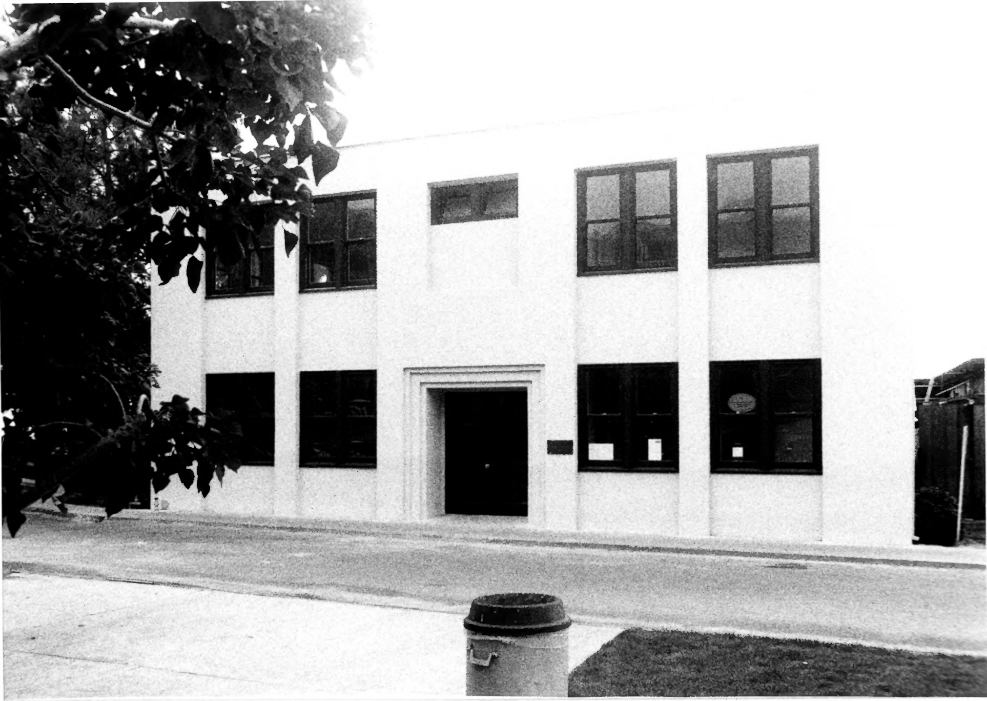
East facade, from site of Library-Museum. (1980)