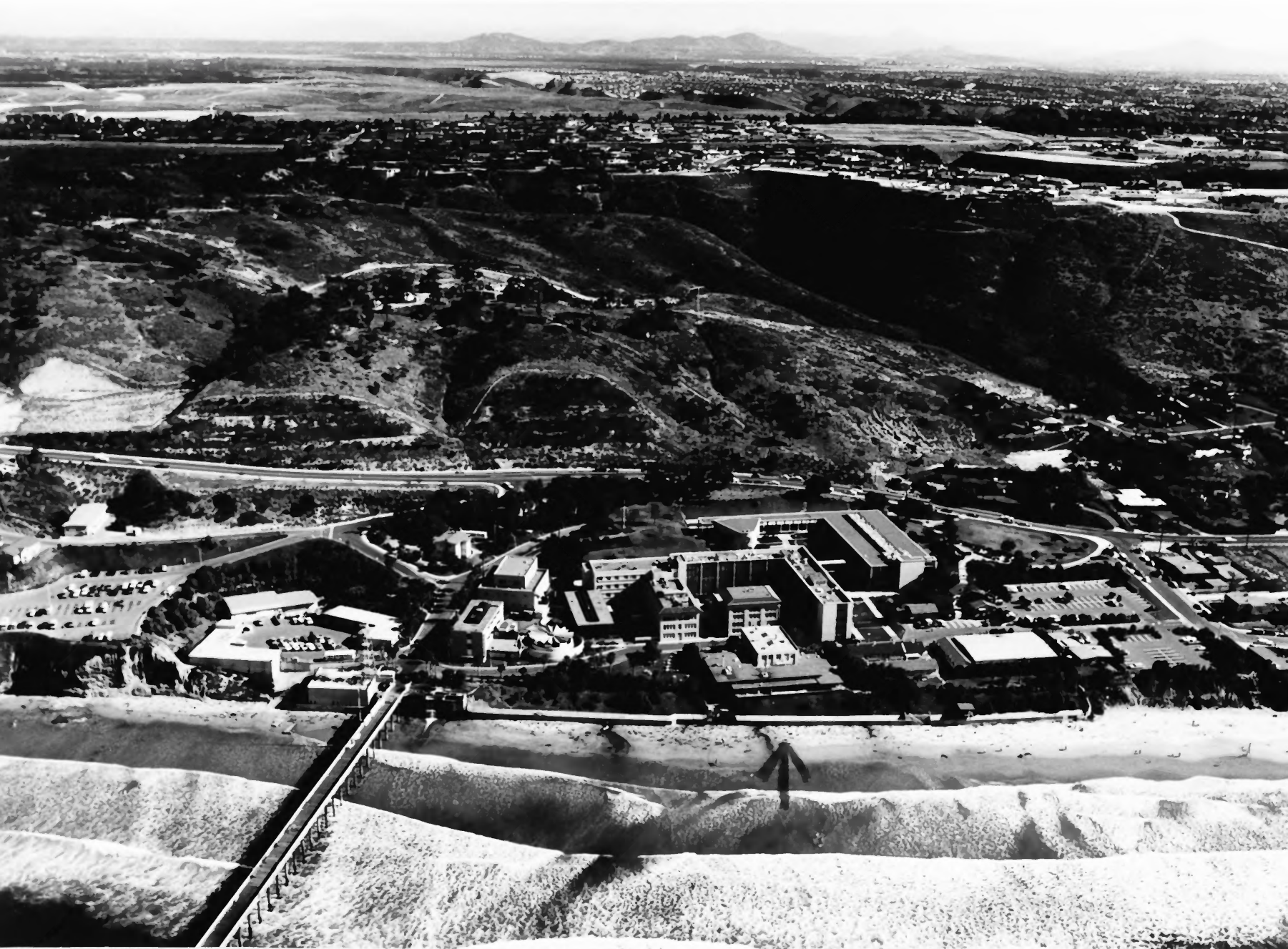
Scripps Institution Campus in the early 1970s, before demolition of the Library-Museum. Location of Old and New Scripps buildings marked by arrow.