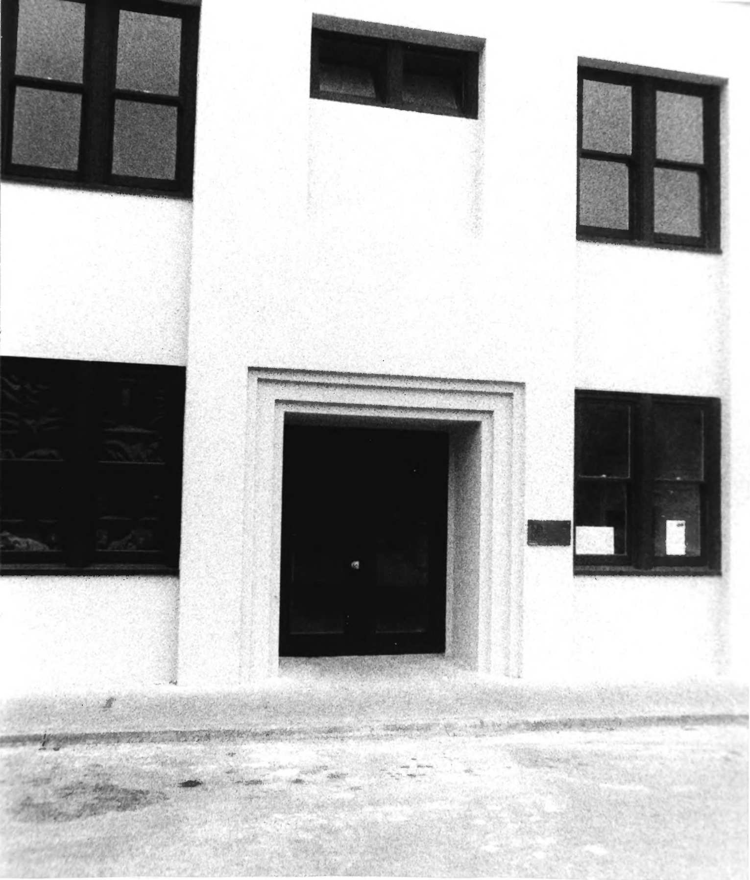
Detail of east entrance of Old Scripps.