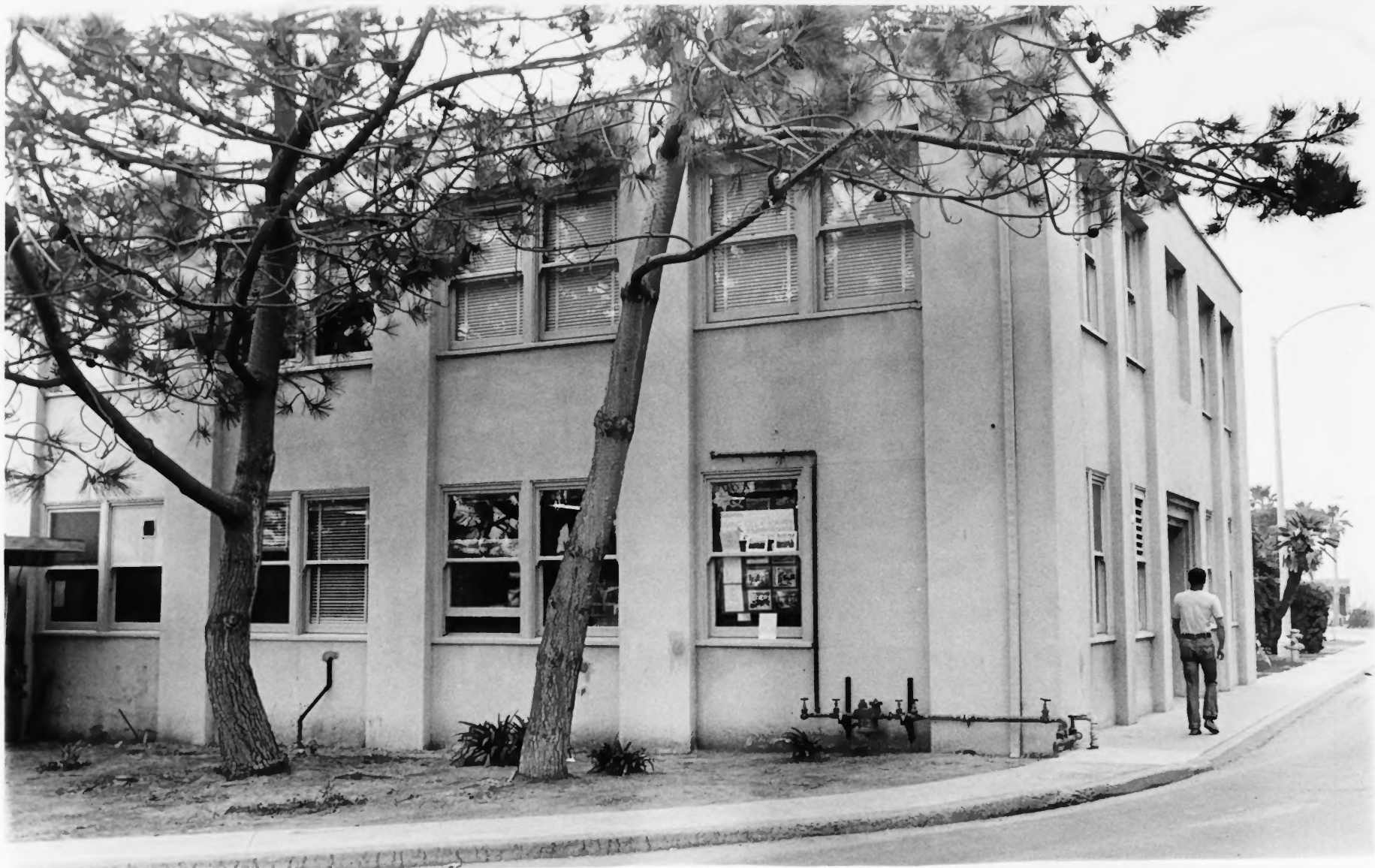
Old Scripps, south (left) and east (right) facades, 1977.