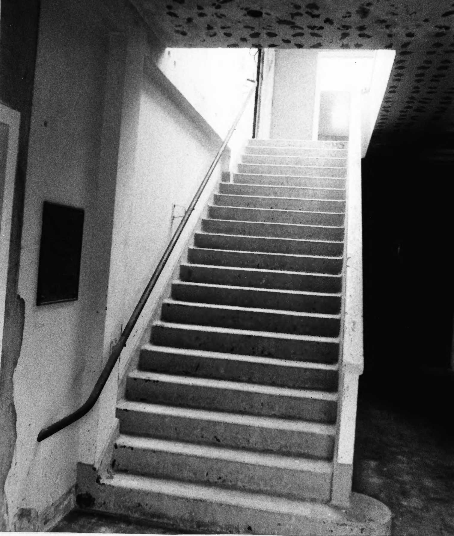
Stairs to second floor (natural light).