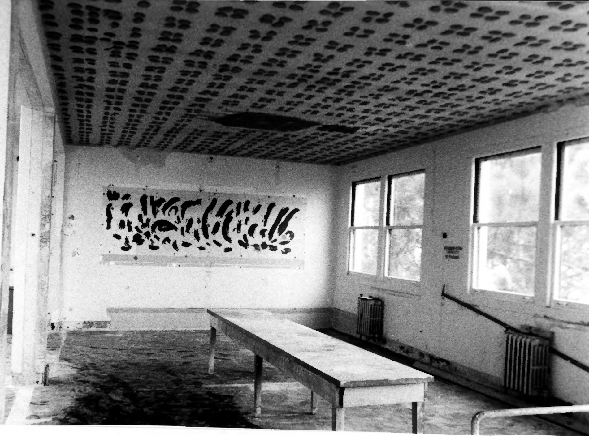
Interior of the classroom (1980)