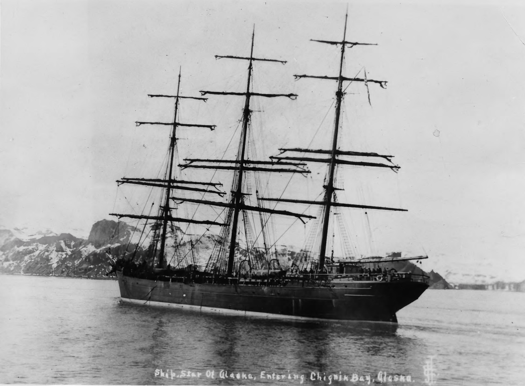
Ship, Star of Alaska, Entering Chignik Bay, Alaska.

Balclutha, as Star of Alaska , date unknown