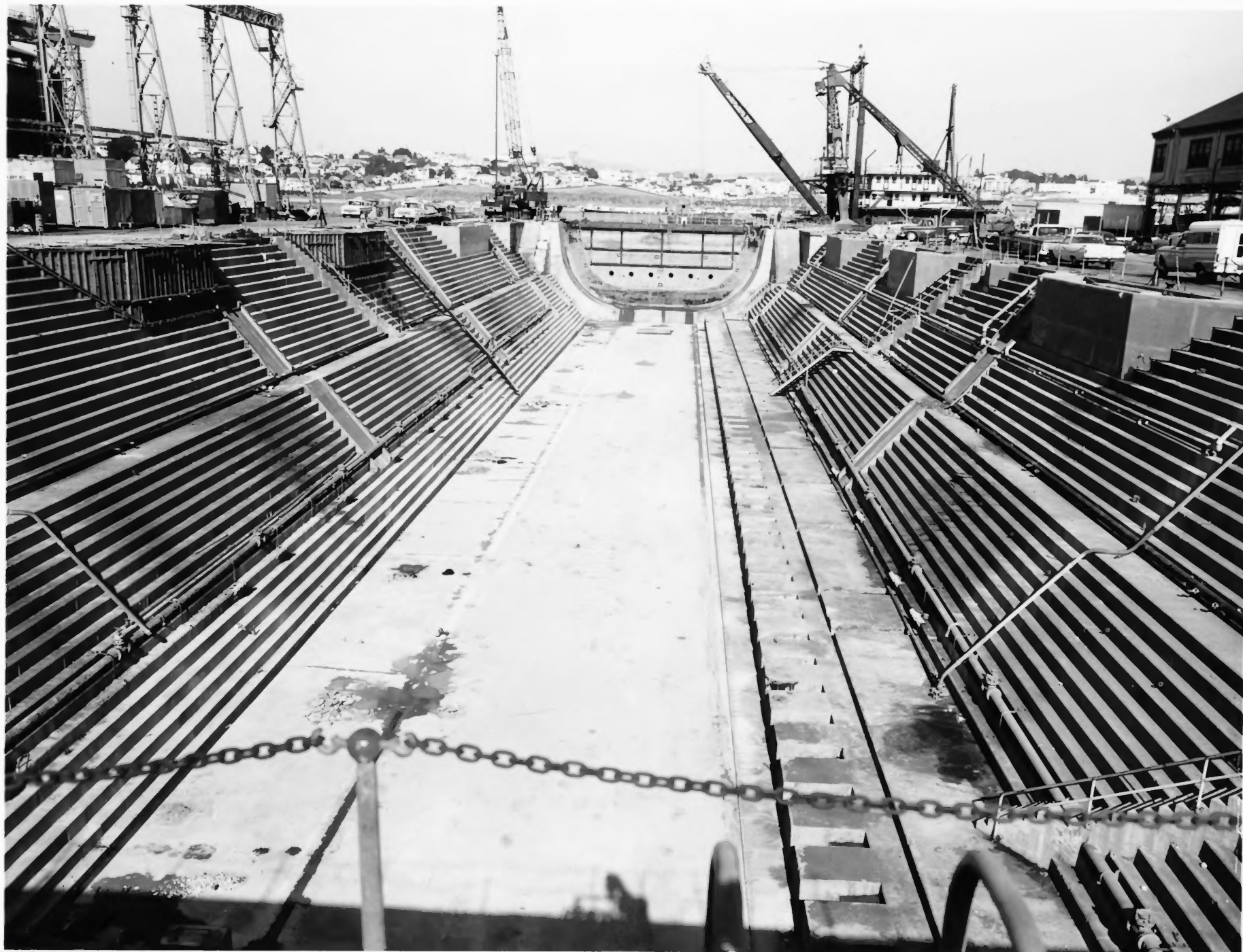
Mare Island Naval Shipyard, Vallejo, California; Drydock 1.