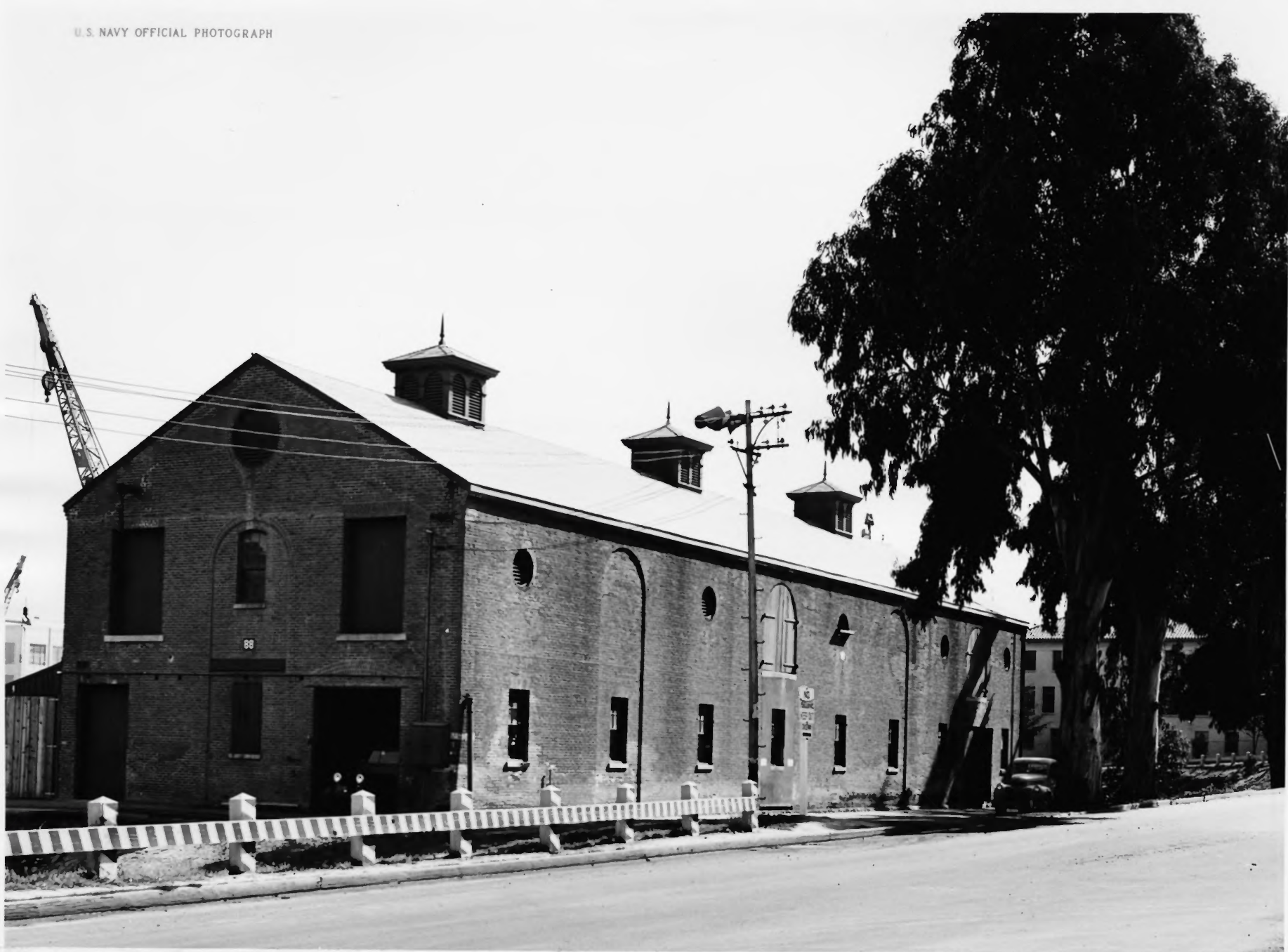
Mare Island Naval Shipyard, Vallejo, California; Stable.