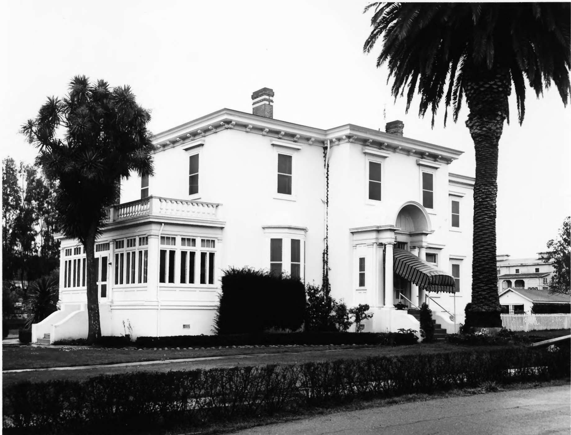
Mare Island Naval Shipyard, Vallejo, California; Marine Quarters. U.S. Navy official photograph, 1969