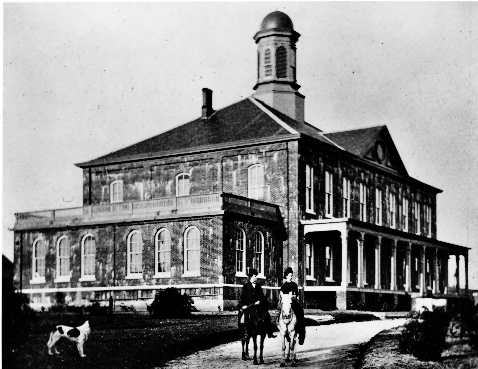
Mare Island Naval Shipyard, Vallejo, California; Administration Building circa 1860. U.S. Navy official photograph 1973