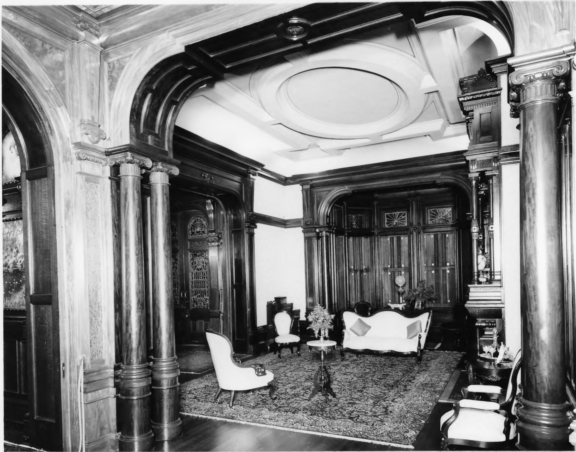
Bishop's Palace, drawing room; Galveston, Texas