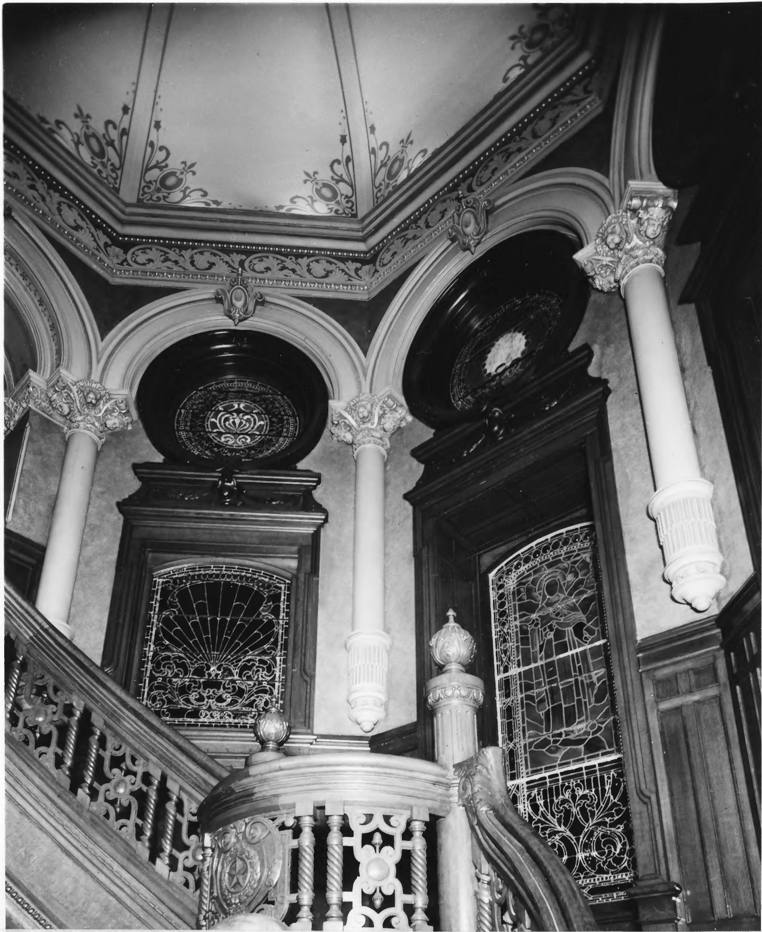
Bishop's Palace; Galveston, Texas