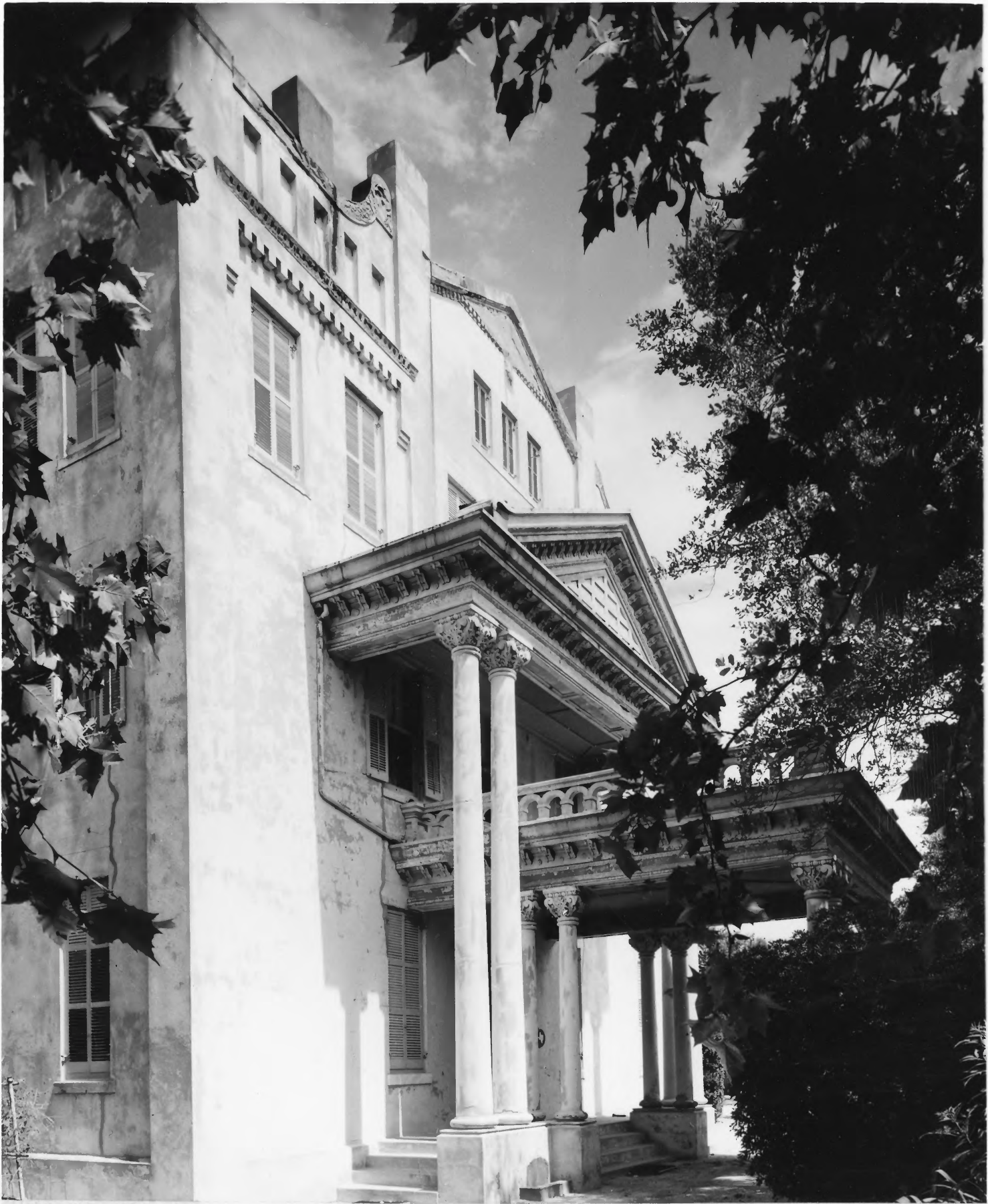
John Henry Hutchings House, Galveston, Texas