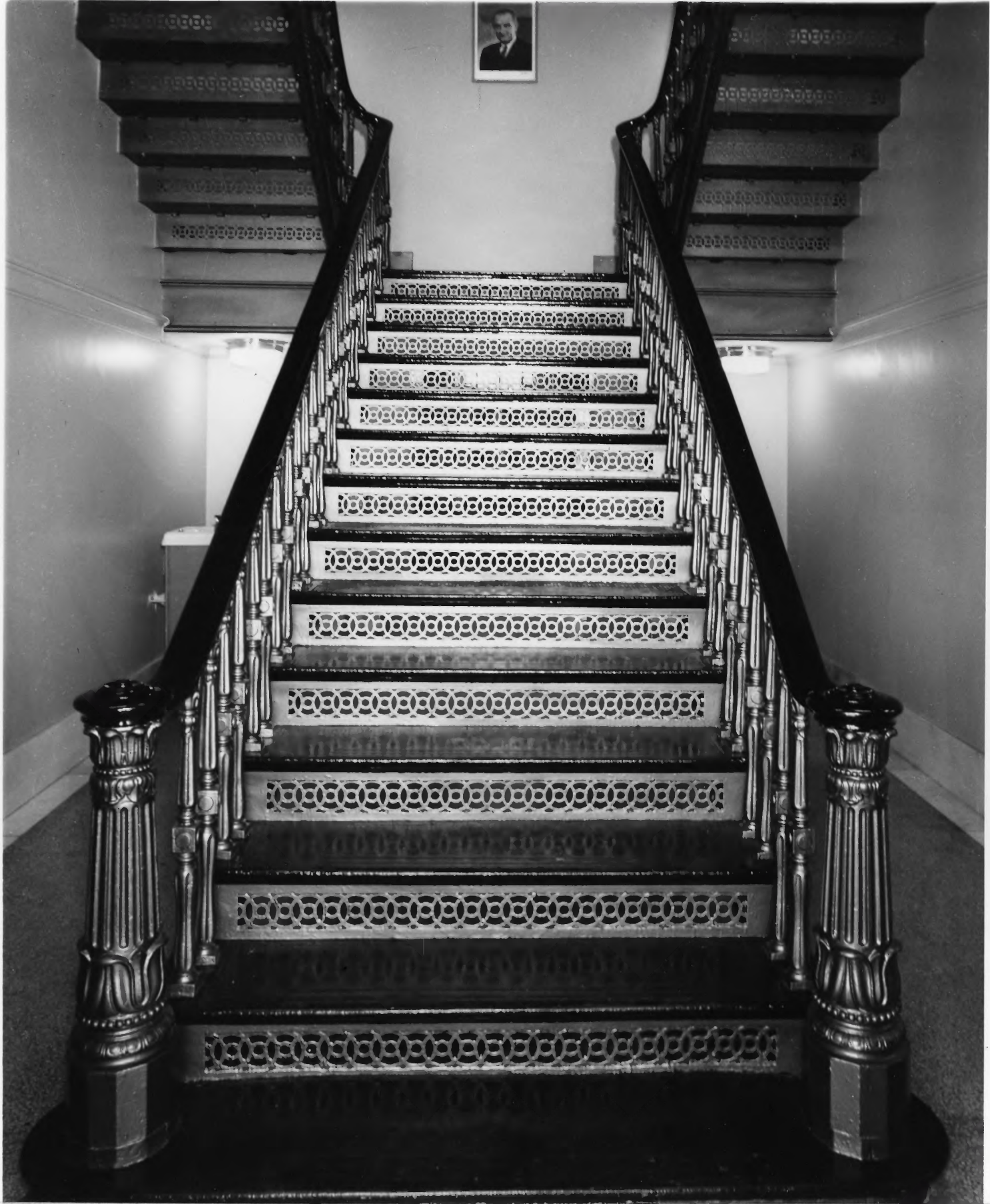
Customs House Stairs