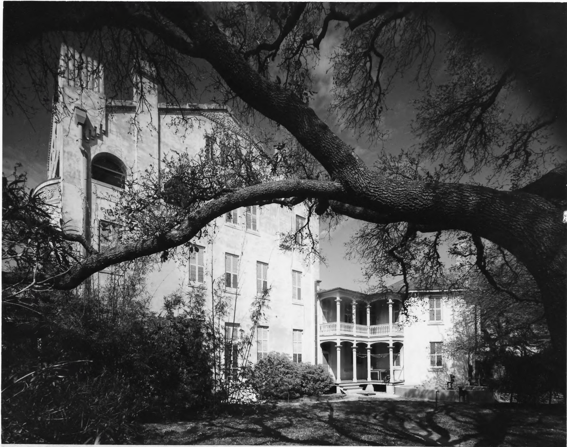
John Henry Hutchings House Galveston, Texas