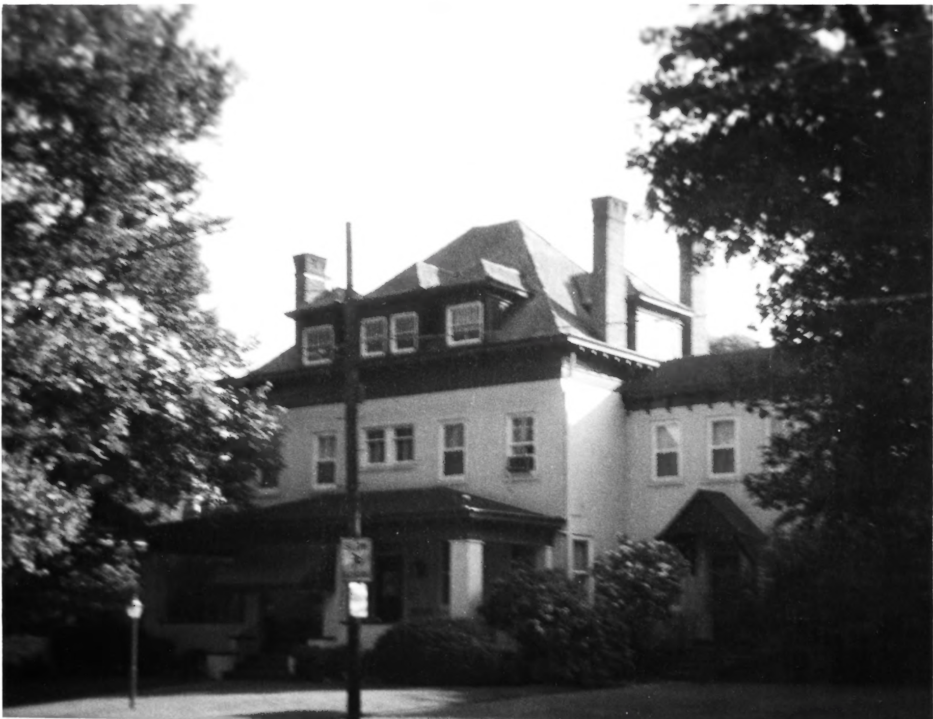
Matthew Quay House, Beaver, Pennsylvania