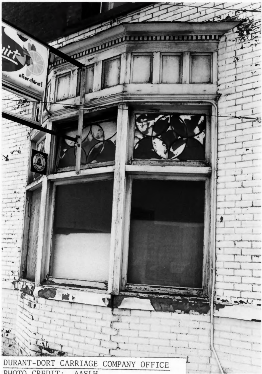
DURANT-DORT CARRIAGE COMPANY OFFICE